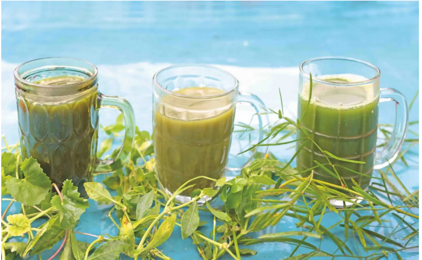
Gotu Kola, Mukunuwenna and Hathawariya kenda.

Most Sri Lankans gulp down a morning mug of Kenda, a veritable magic potion that gives the drinker strength to face the day.