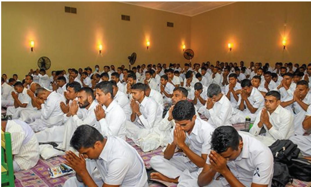
Inculcating discipline from an earlier age is a characteristic of a good human being.

Manōdaya Meditation Center Manōdaya Asapuwa (Facebook) Siriwardhanaramaya, Temple Lane, Kollupitiya sirirevathad@gmail.com dhammavedi.com