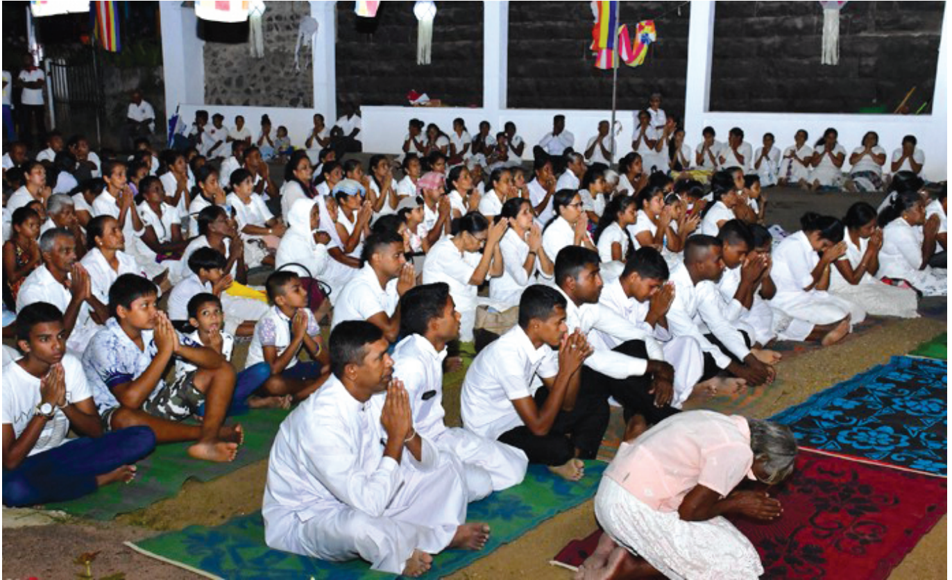
Devotees observe sil.

Generally, beings and human beings like to live in peace and harmony. It depends on non-other than discipline. Discipline is like an ornament for human beings which depends on precepts. It is also a characteristic of a good human being. Generally, it is said there is a difference between animals and human beings, as human beings have discipline. It is further intended as: if human beings get only: food, water, and shelter and procreate, they fulfill only basic needs similar to an animal. Real human being seeks protection of worldly and internal with empathy. When it is fulfilled, he looks for love and friendship with society. Besides that, most human being expects 'acceptance' from society. Because naturally, he likes pride or 'esteem need', and then he reaches the insight. According to Abraham Maslow's Theory, the "Hierarchy of Needs" is categorized as psychological needs, safety needs, love and belonging needs, esteem needs, and self-actualization. But some people rarely get self-actualization, and some move half of the journey, while others move very nearby. That must be the 'Meaning of Human Life.' That must also be the answer to some people who frequently ask, "What is the meaning or purpose of life?"