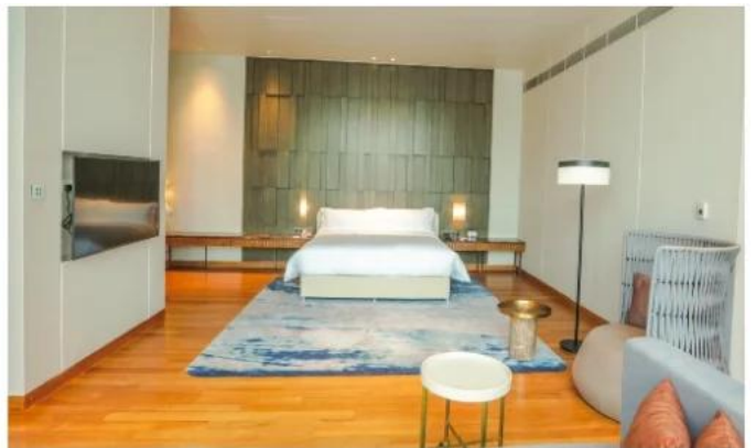
Another room of the Presidential Suite with a different interior.