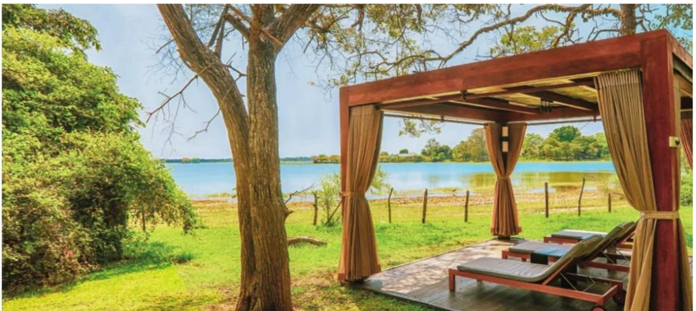
The comfortably furnished gazebos are named after birds.