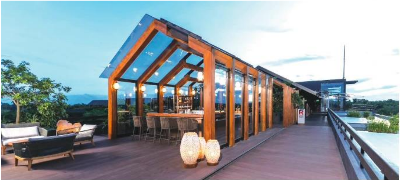
At dusk, Nightjar has a beautiful ambiance.