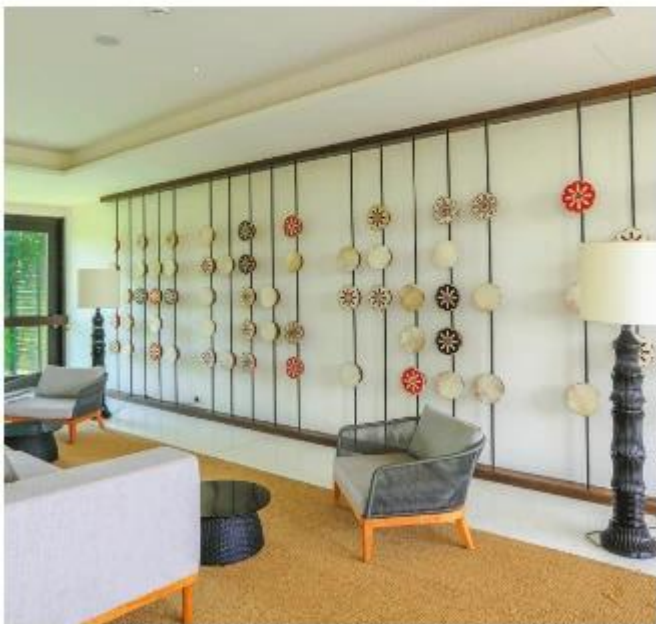
Above and below: Quaint spaces for guests to relax are adorned with Sri Lankan instruments.