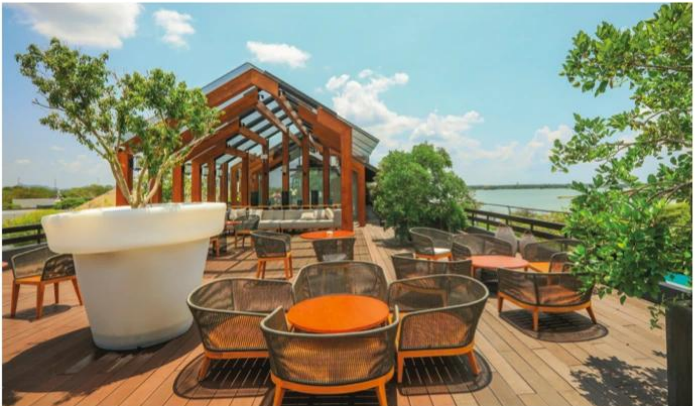
Guests can enjoy beautiful views of the South from the rooftop.