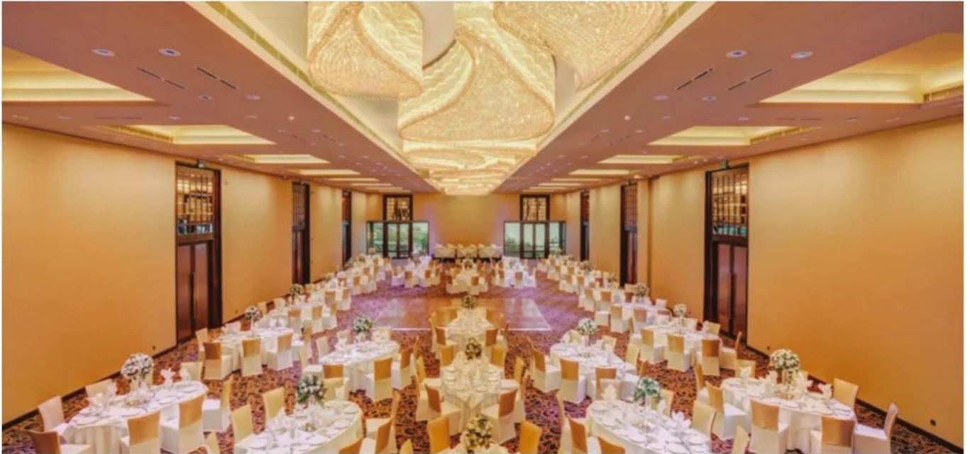
Grand Rajawarna provides banquet and conference facilities.