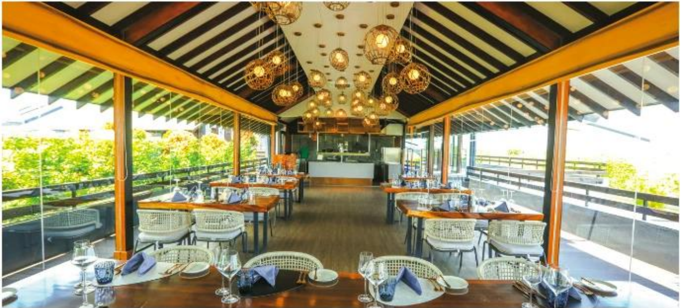
Redshank, the resort's signature seafood restaurant.