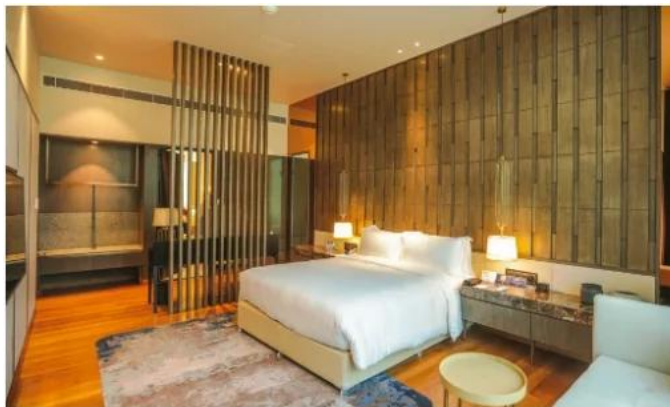
Each room of the Presidential Suite is unique.