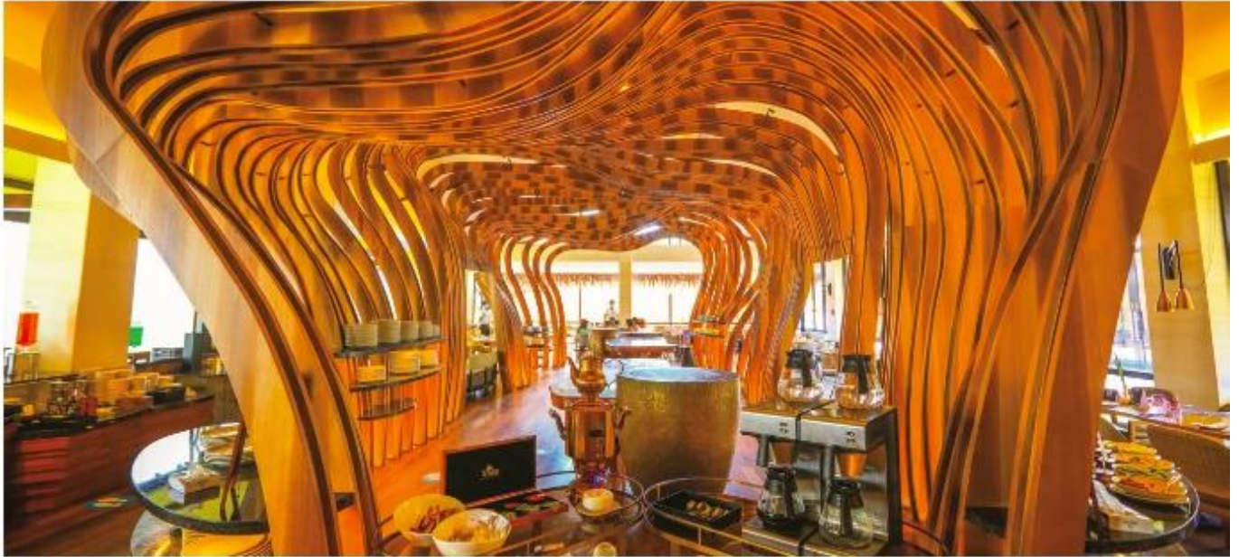
Spoonbill, all day dining restaurant, Tea Lounge and BBQ Grill.