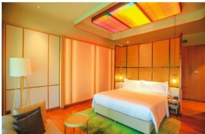
A Deluxe Double Suite.