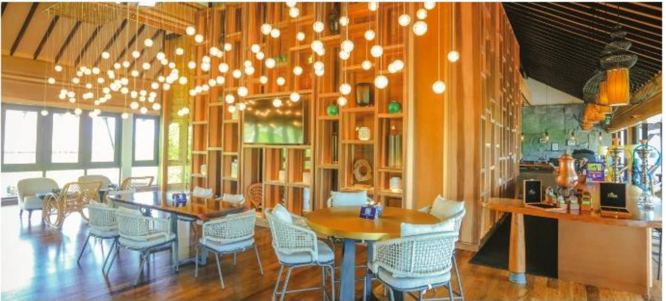
Turnstone, the main bar of the resort.