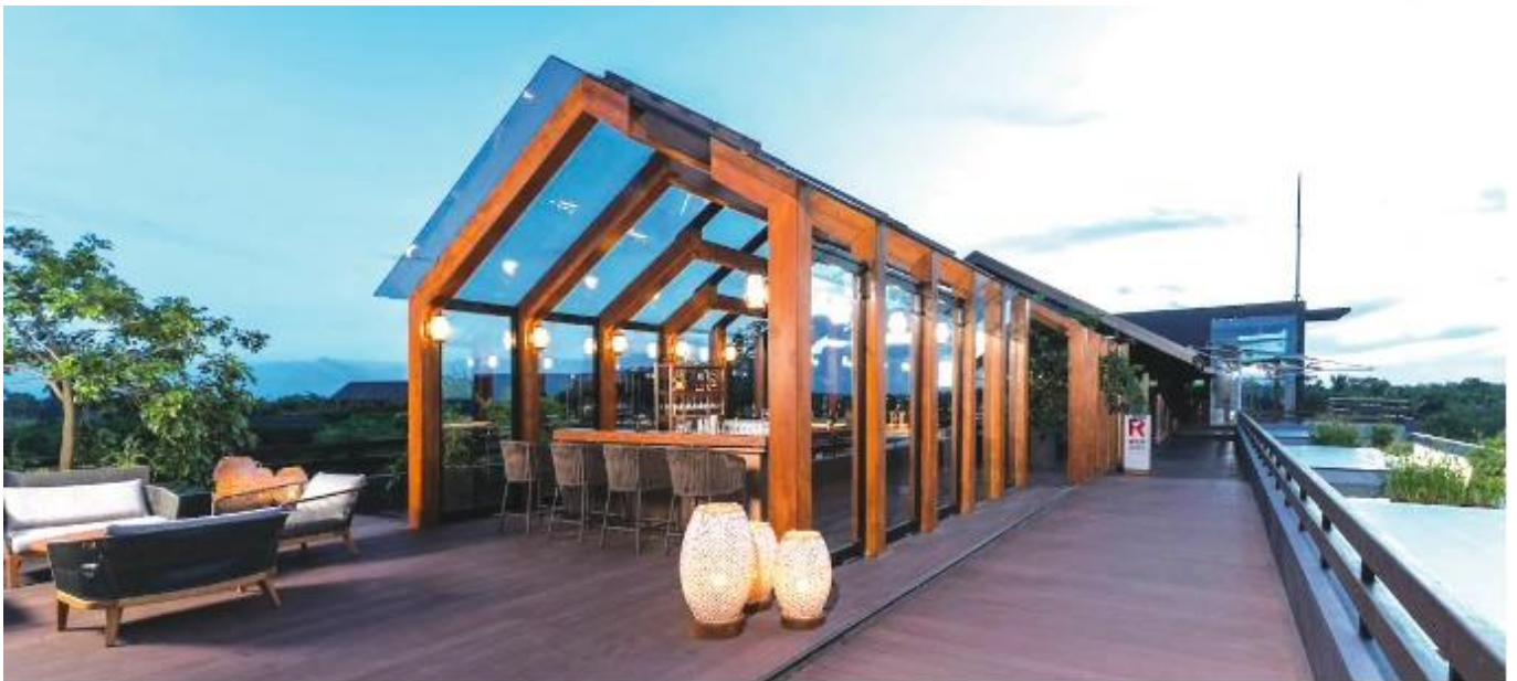
At dusk, Nightjar has a beautiful ambiance.