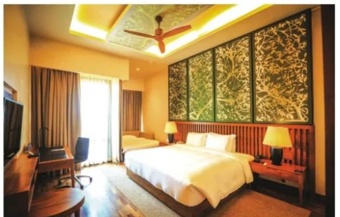
A Deluxe Room.