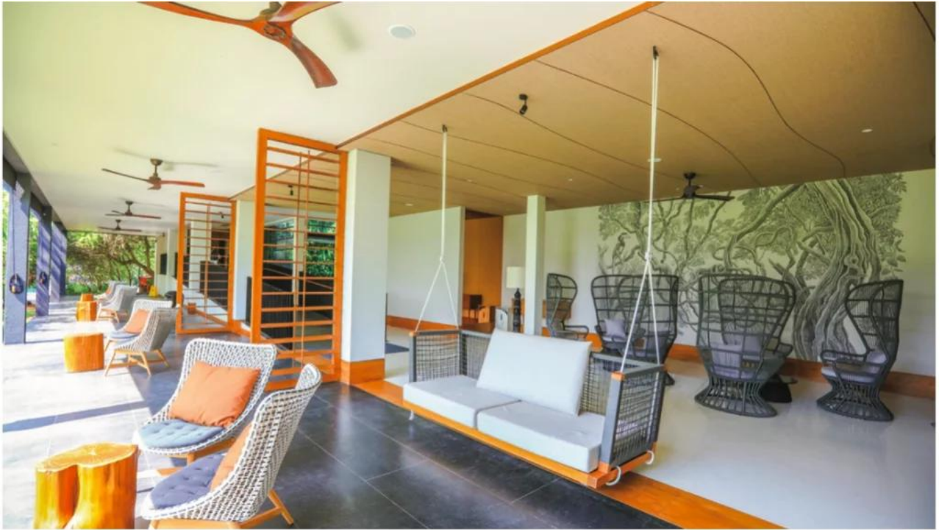
The lobby lounge is furnished with cooling and subtle shades.