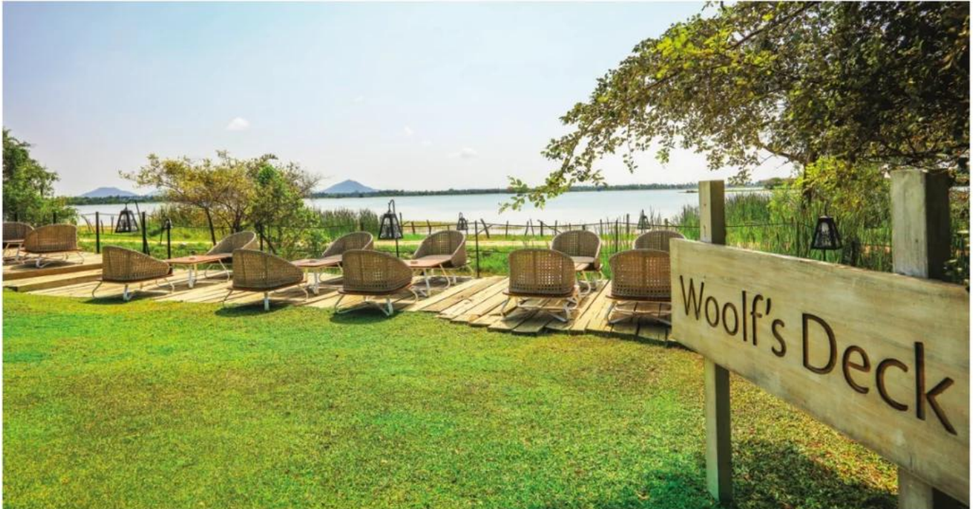
Woolf's Deck is the outdoor sitting area where guests can enjoy views of the Weerawila Lake.