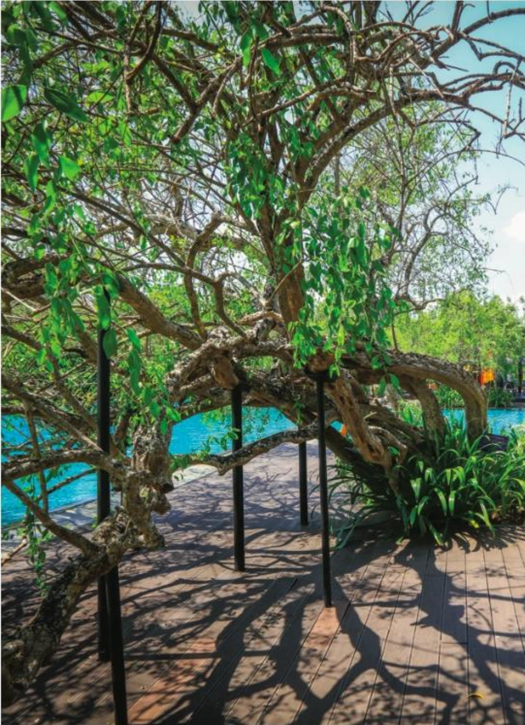
The restored tree held up with steel crutches.