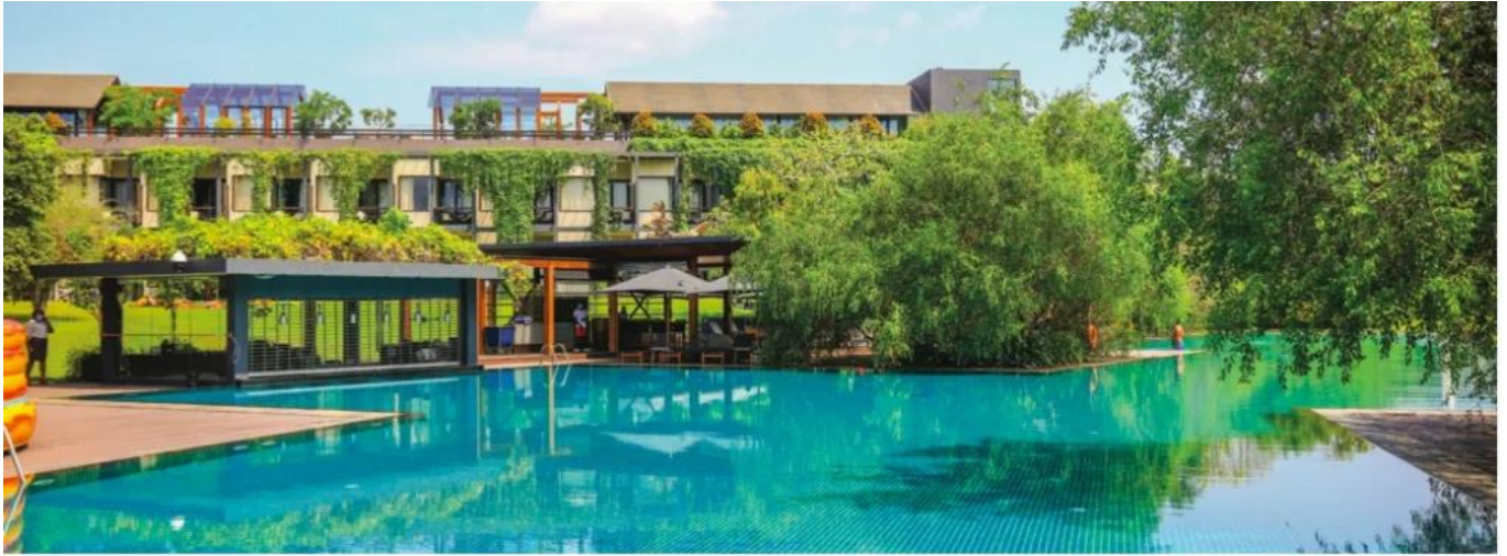
The 97m swimming pool has a unique shape as trees were incorporated into its design.