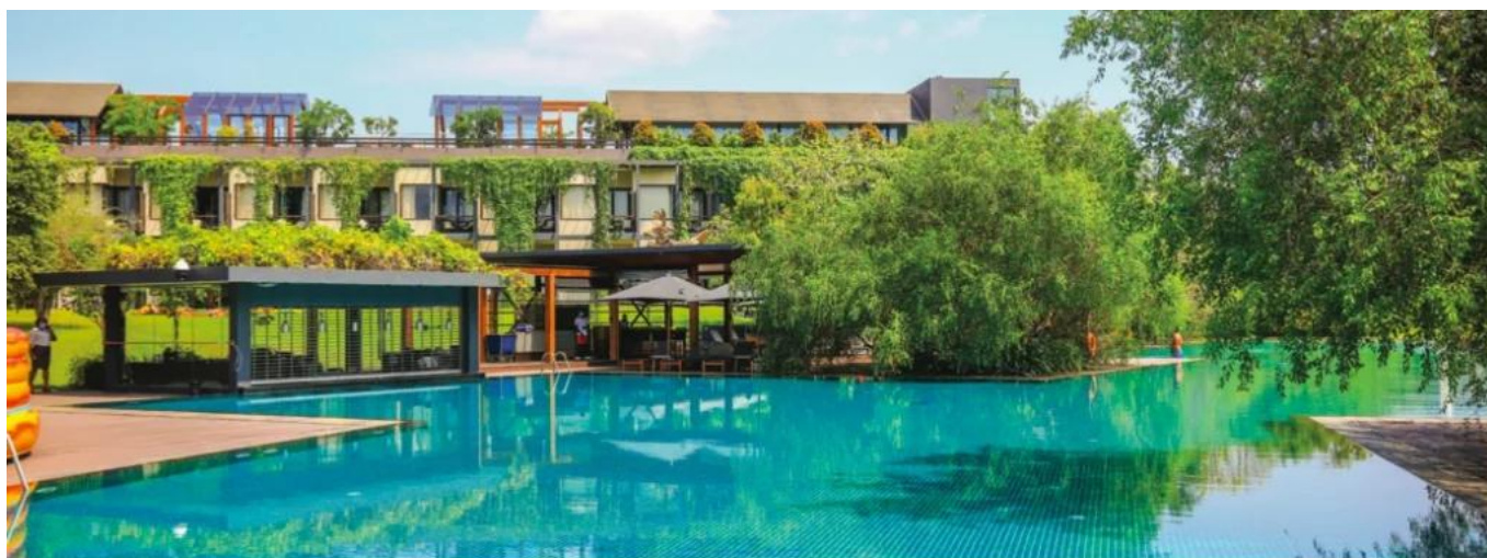
The 97m swimming pool has a unique shape as trees were incorporated into its design.