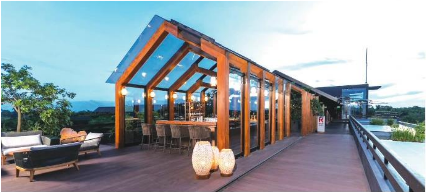
At dusk, Nightjar has a beautiful ambiance.