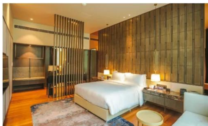
Each room of the Presidential Suite is unique.