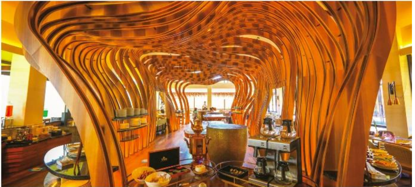
Spoonbill, all day dining restaurant, Tea Lounge and BBQ Grill.