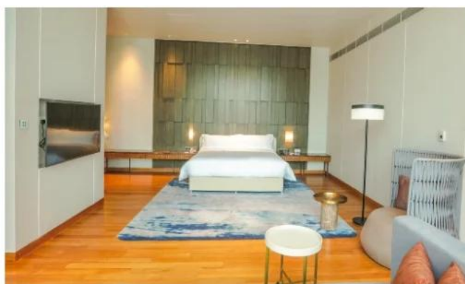
Another room of the Presidential Suite with a different interior.