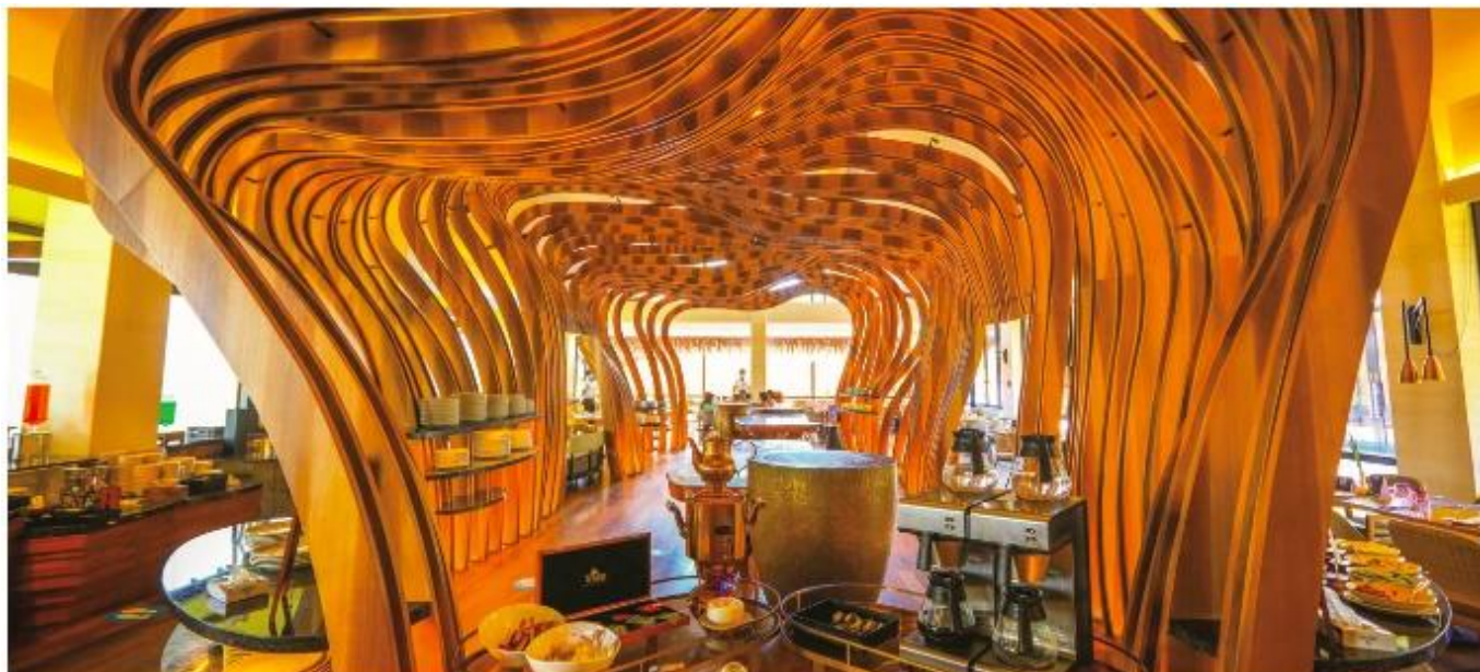
Spoonbill, all day dining restaurant, Tea Lounge and BBQ Grill.