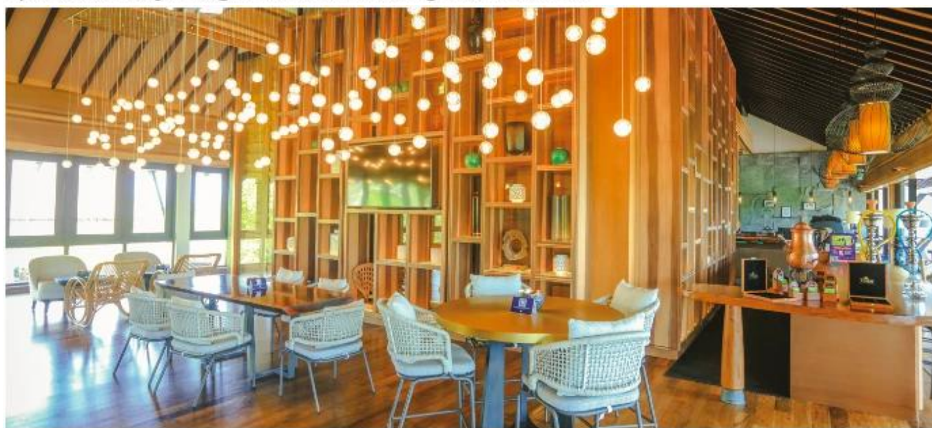
Turnstone, the main bar of the resort.