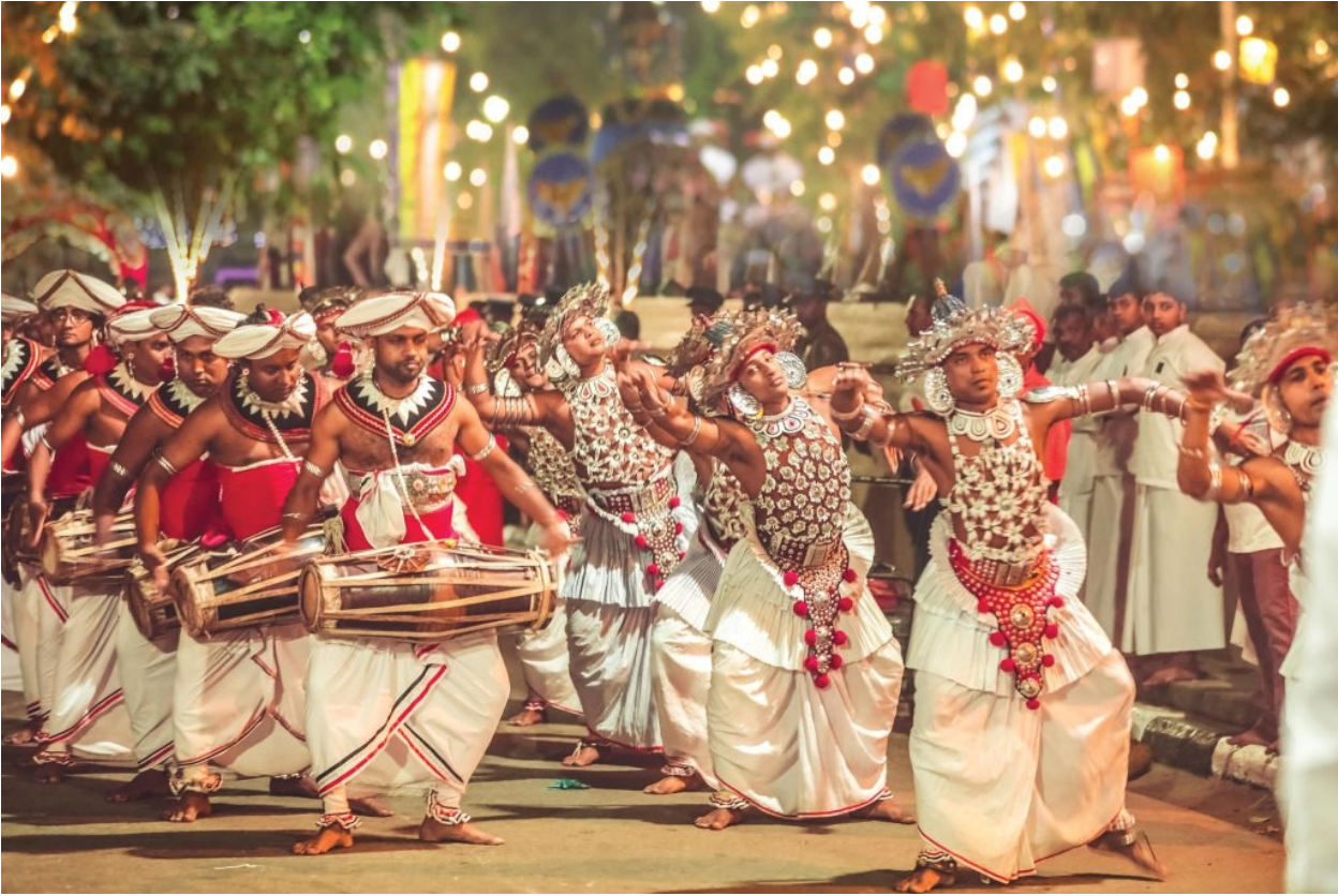
Ves dancers and Geta Bera drummers in perfect unison.