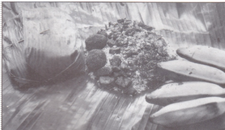
Lamprais – the special rice of the Dutch

To dwell on the merits and demerits of the sub species of lamprais in Sri Lanka coupled with the experience of their makers, would run into a modest volume. Rather than invoke fury on one side and (hopefully) praise, kisses and perhaps an imitation to lunch on the other, by naming notable lamprais makers, I will at this stage terminate this effort and make an entry in my diary: “Remember to collect your thirty lamprais on Saturday afternoon at Dehiwela.”