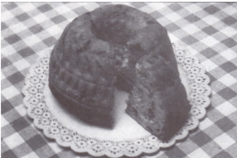
Breudher - the sultana cake made on festive occasions.