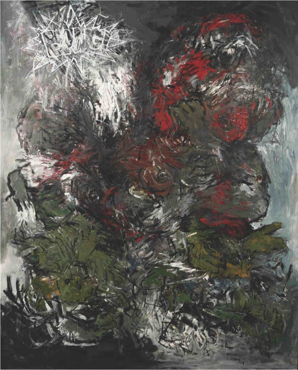
The Lost Member.