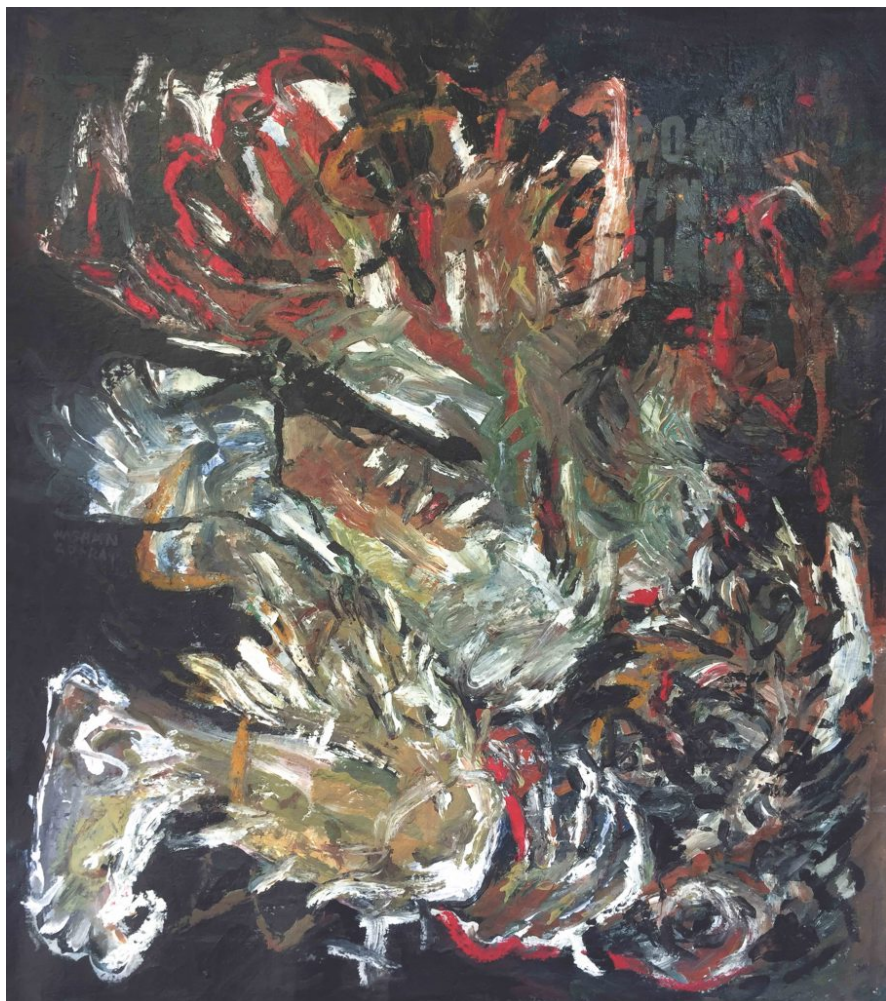
Dance with God.