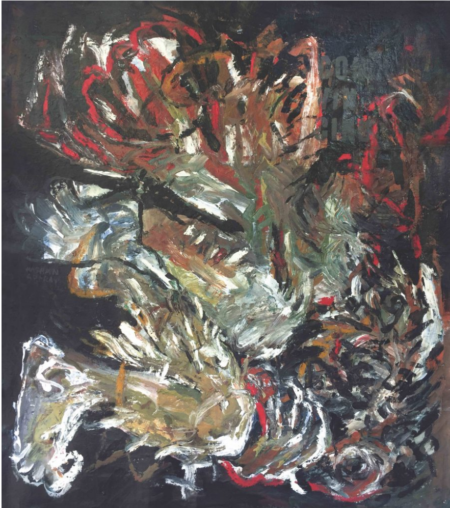
Dance with God.