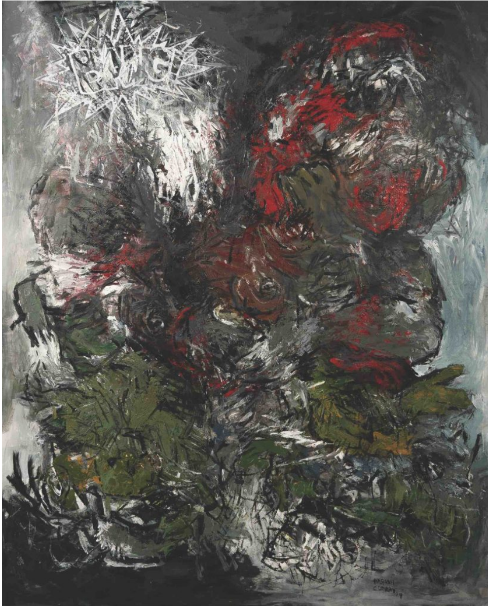
The Lost Member.