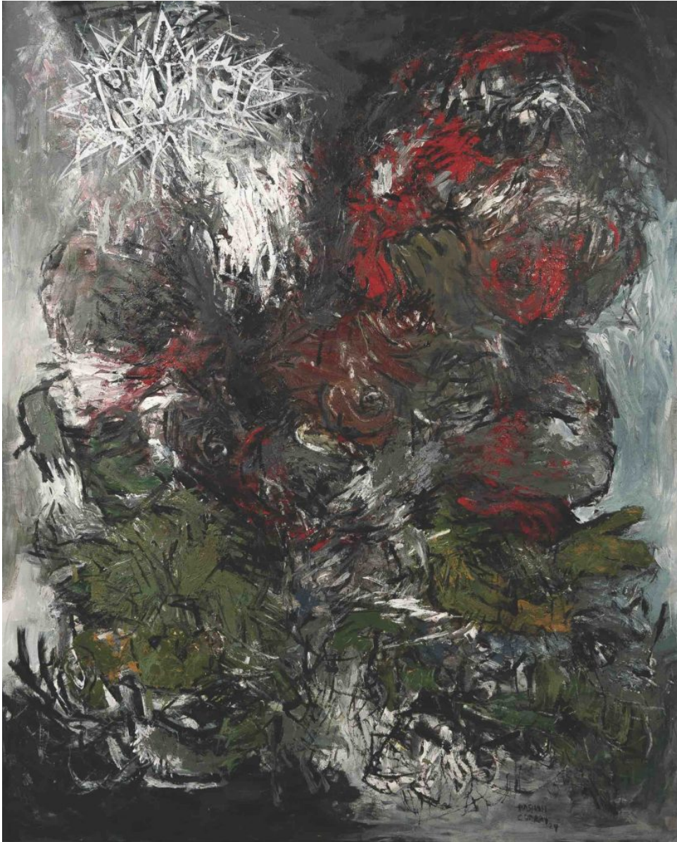
The Lost Member.