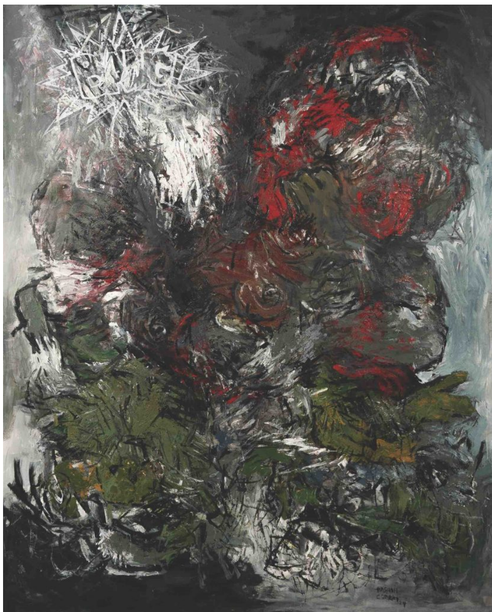
The Lost Member.