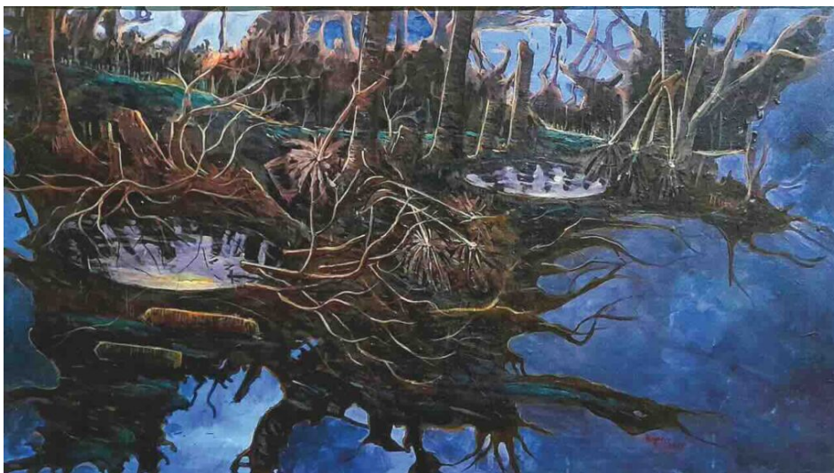
No man's land (I) by Balachandiran Kajeepan.

Echo: An Exhibition of Contemporary Art brings together artists from Sri Lanka’s North, East, and Central regions, all connected to Jaffna through training, memory, or belonging. Emerging from the post-armed conflict landscape, the exhibition works interrogate war and its aftermath through diverse media, personal narratives, and collective histories. Together, they articulate layered realities of survival, remembrance, and renewal—echoes that continue to shape Sri Lanka’s cultural present and future.