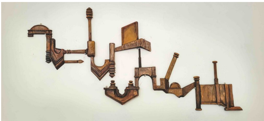
Haunting shadow by Mano Prashath.

Venue: Kolam, 199, Temple Road, Nallur, Jaffna