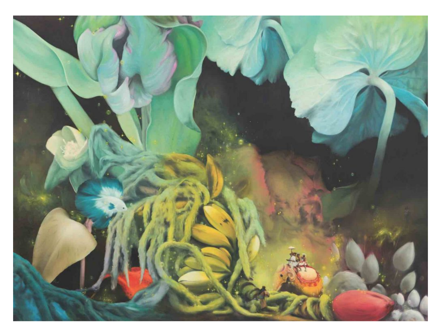
Abeysinghe's work is profoundly shaped by vibrant folklore and rural customs, encapsulating the spirit of rural life in the face of advancing urbanization.