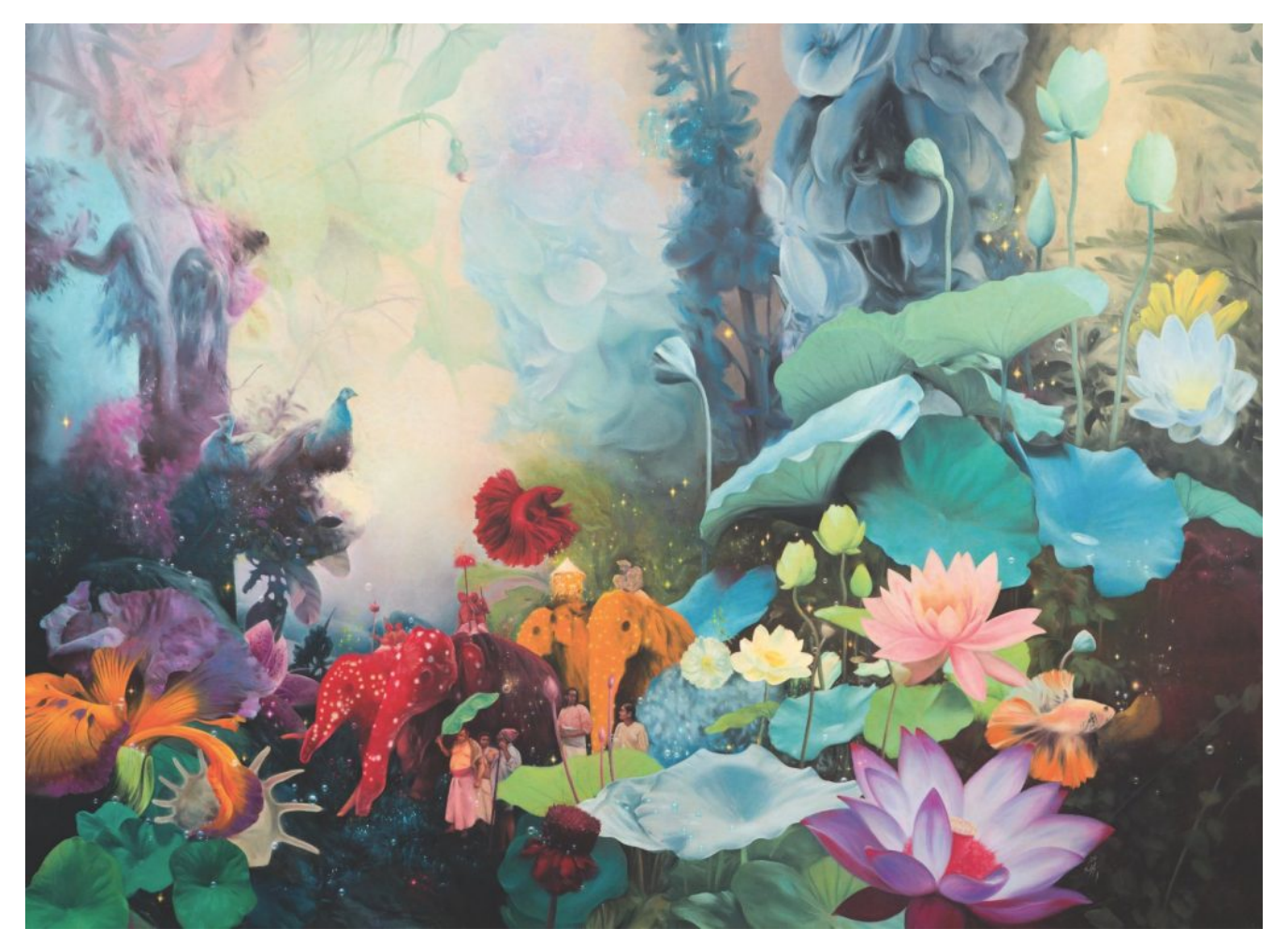
Discover a surreal underwater world in 'Elsewhere,' where towering terrestrial flora creates a haven for a forgotten civilization.

Saskia Fernando Gallery presents 'Elsewhere', an exhibition by artist Sandatharaka Abeysinghe. 'Elsewhere' imagines a surreal realm submerged beneath the water, where terrestrial flora has evolved into towering giants, creating a haven for a forgotten civilization. Inspired by Ilya Repin's 'Sadko', Sandatharaka Abeysinghe envisions an underwater world where a city engulfed by water continues to thrive in the present day, hidden from the world above.