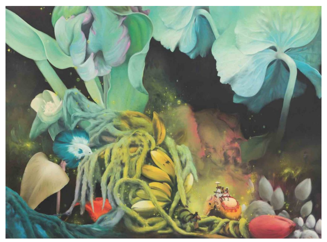
Abeysinghe's work is profoundly shaped by vibrant folklore and rural customs, encapsulating the spirit of rural life in the face of advancing urbanization.

Abeysinghe's imagination brings to life a romanticized interpretation of Sri Lankan culture and history in a world that transcends the rigid categories of modernity.