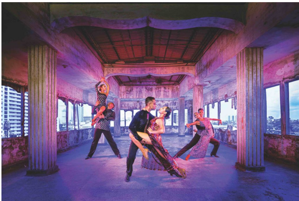
Epic Black - Embracing the transformative power of dance.