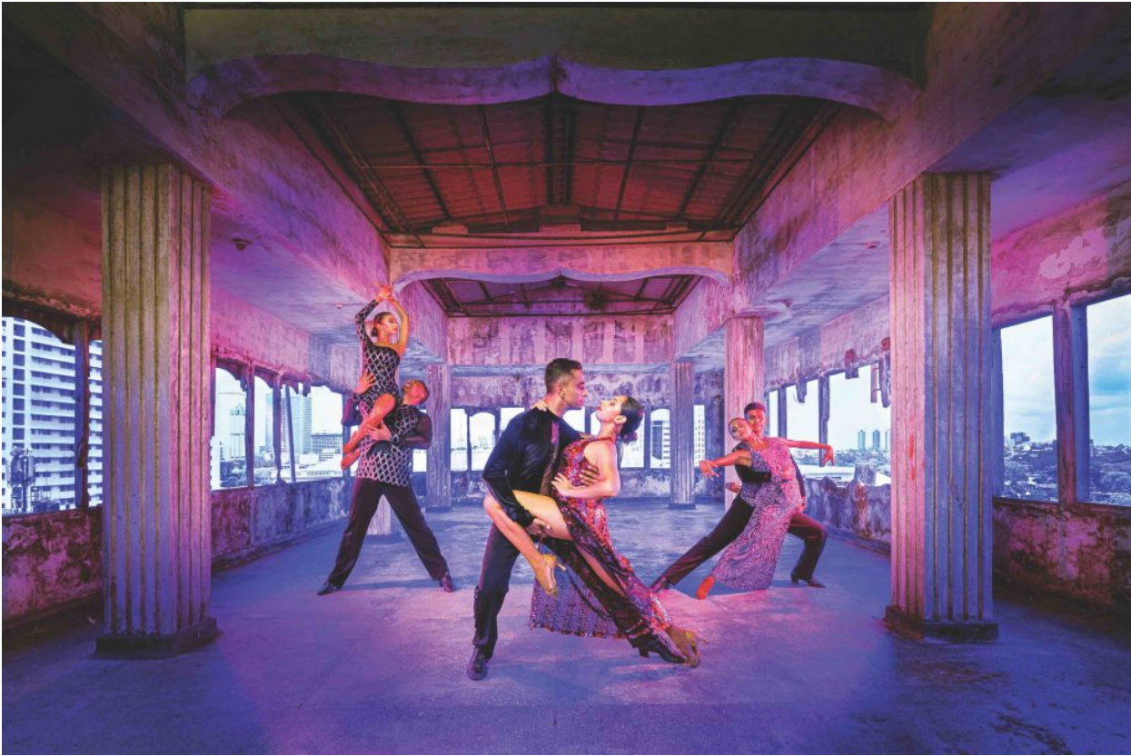
Epic Black - Embracing the transformative power of dance.