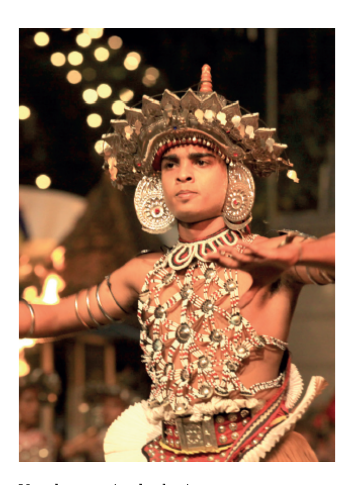
Ves dancers in rhythmic movement