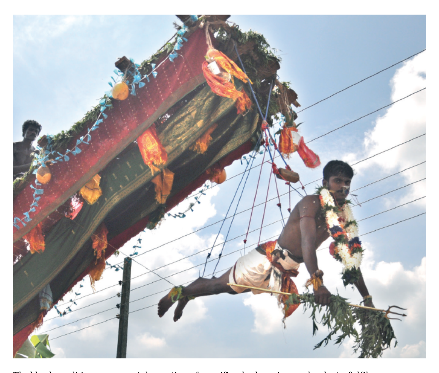
Thukku kavadi is a ceremonial practice of sacrifice by hanging on hooks to fulfil a vow.