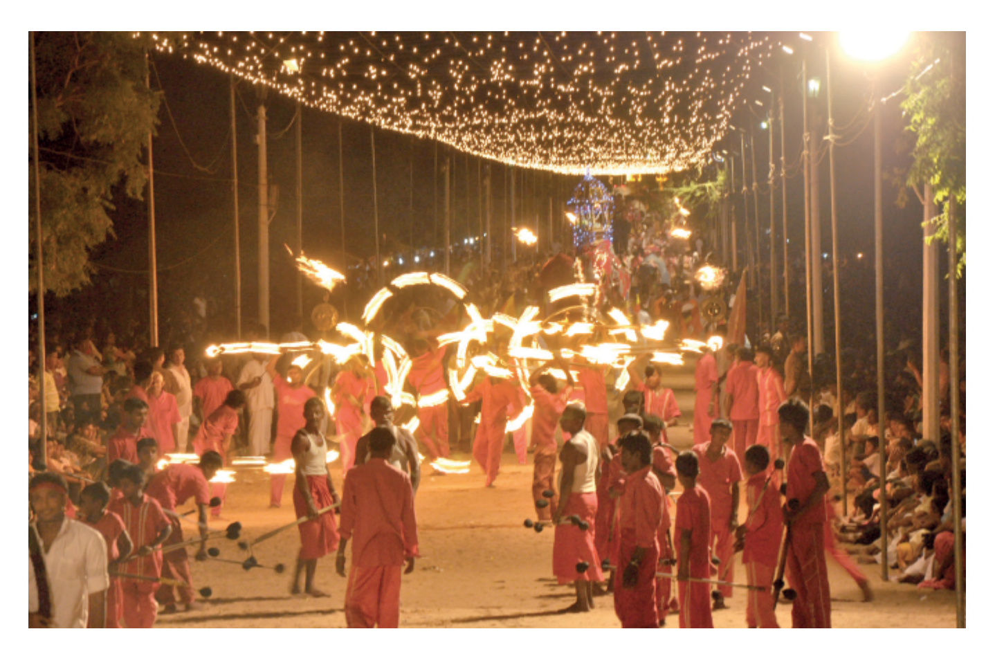
Adding to the sparkle of the perahera are the colorful lights, caparisoned elephants, dancers and drummers.