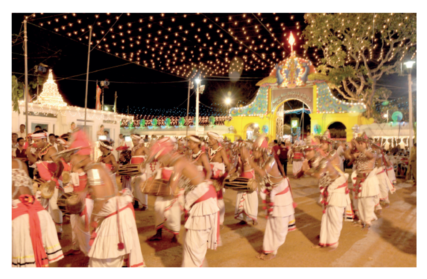
Ruhunu Maha Kataragama Devalaya is illuminated in sparkling lights during the annual perahera.