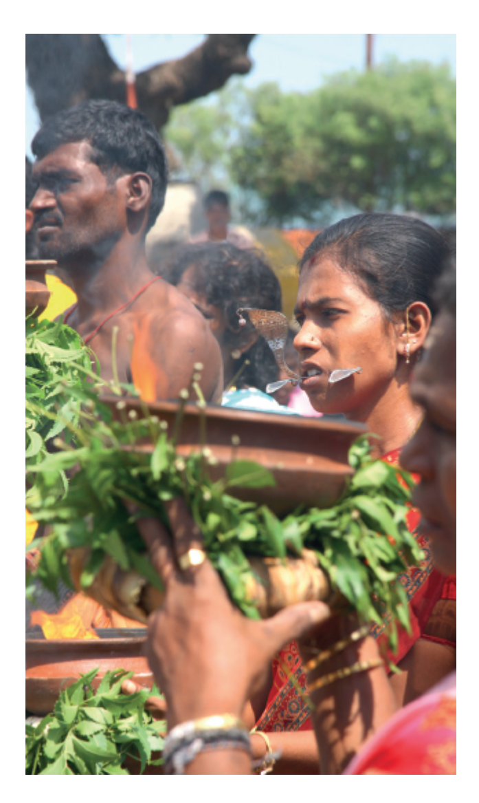
Devotees pierce vel (silver-arrow headed pins) in veneration.

Adding to the festival is the Paada Yathra, a devotional journey by pilgrims as they travel on foot from Jaffna to Kataragama through road and jungle amidst the sun and rain. Chanting prayers and spending nights in tents and places of worship, the villagers provide alms to those embarking on the journey. These pilgrims aim to participate in the festival celebrations and invoke the blessings of god Skanda. As devotees chant 'haro hara,' the procession with the Basnayake Nilame, temple officials, elephants, drummers, and dancers wends its way to the temples within the complex and then to the Valli Amma temple before returning to the Maha Devalaya. The Perahera concludes with Diya Kepeema Mangalyaya (water cutting ceremony) at the Menik Ganga. This year, the first Perahera begins on July 29th, followed by other peraheras consecutively. The Final Perahera (Main Perahera) and