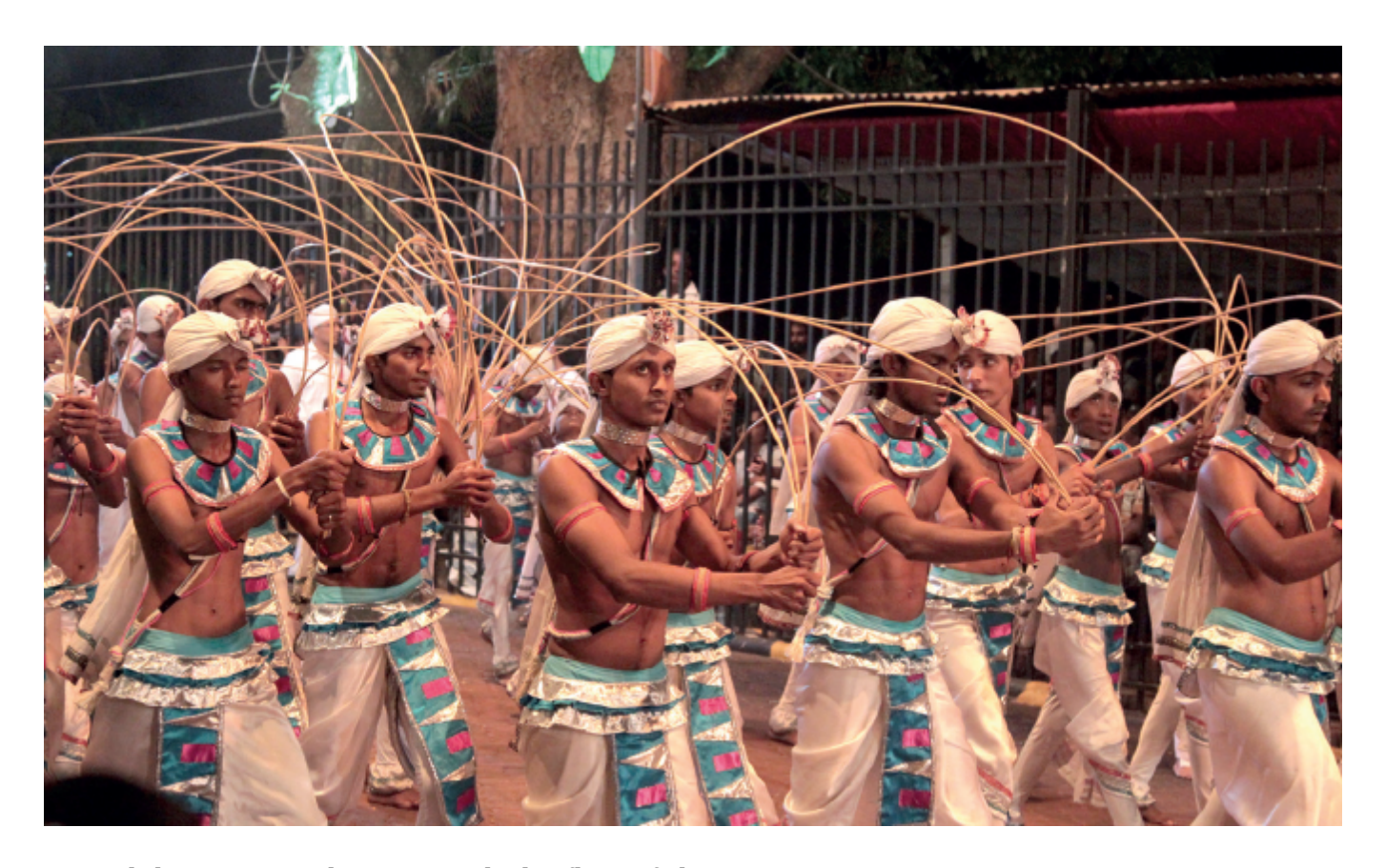
Wewal dancers synchronize with the flow of the procession.