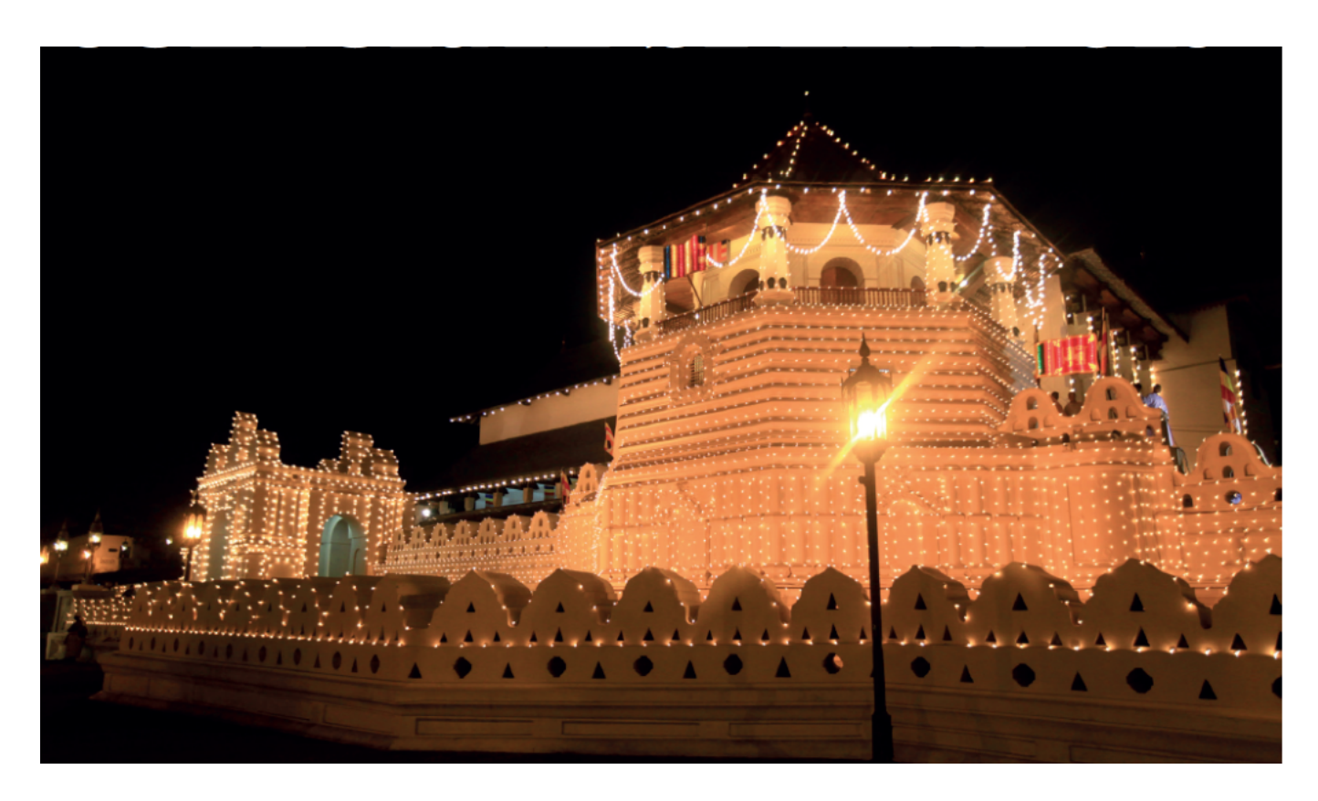
The Temple of the Tooth - Sri Dalada Maligawa dazzles during the Esala Perahera.

According to the Buddhist calendar, Esala is the eighth month that recalls several significant religious and historic events etched in Buddhism. The Esala full moon celebrates the island's two impressive cultural pageants. The Kandy Esala Perahera is celebrated every August and reflects its grandeur and elaborate religious rituals. The Kataragama Esala Perahera is a vibrant traditional festival celebrated with great pomp and pageantry.