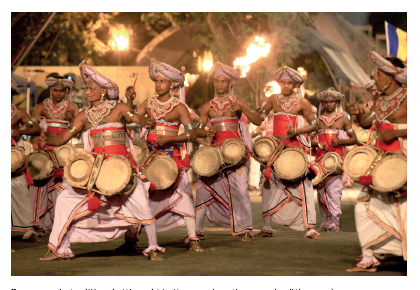
Drummers in traditional attire add to the reverberating sounds of the perahera.