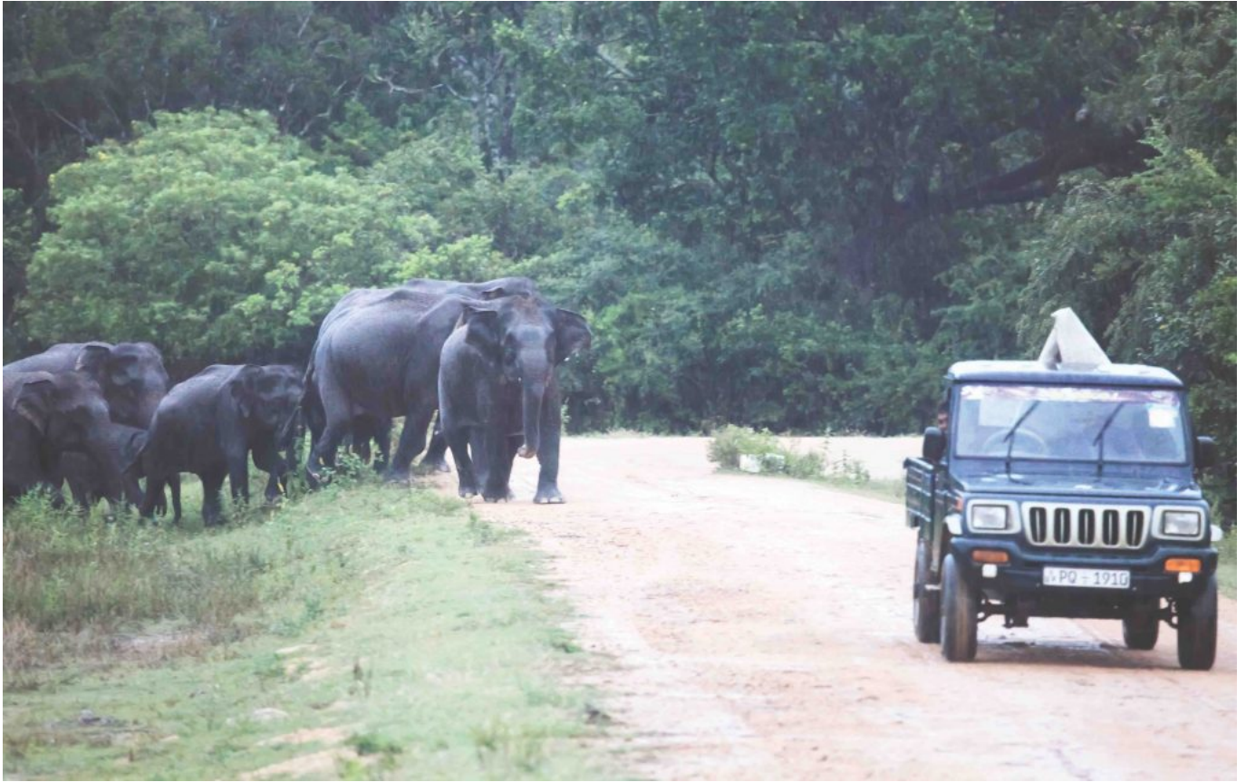
A herd of gentle giants gracefully makes their way through Kumana.