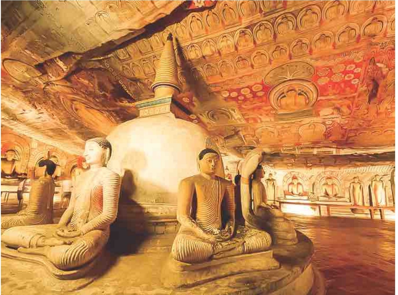
Dambulla Cave Temple stands as a significant shrine within the Buddhist faith in Sri Lanka.