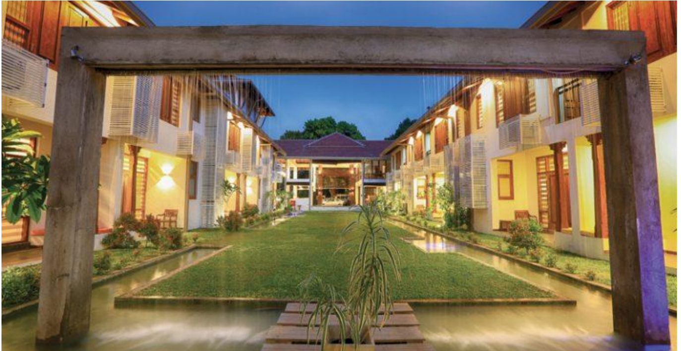
The Thinnai is mesmerising and tranquil

Cocooned within the precincts of homely Jaffna where one feels the Northern peninsula's heartbeat is The Thinnai. Calming and beautiful, it is a place to rest, relax and reunite; it is a place that feels like home.