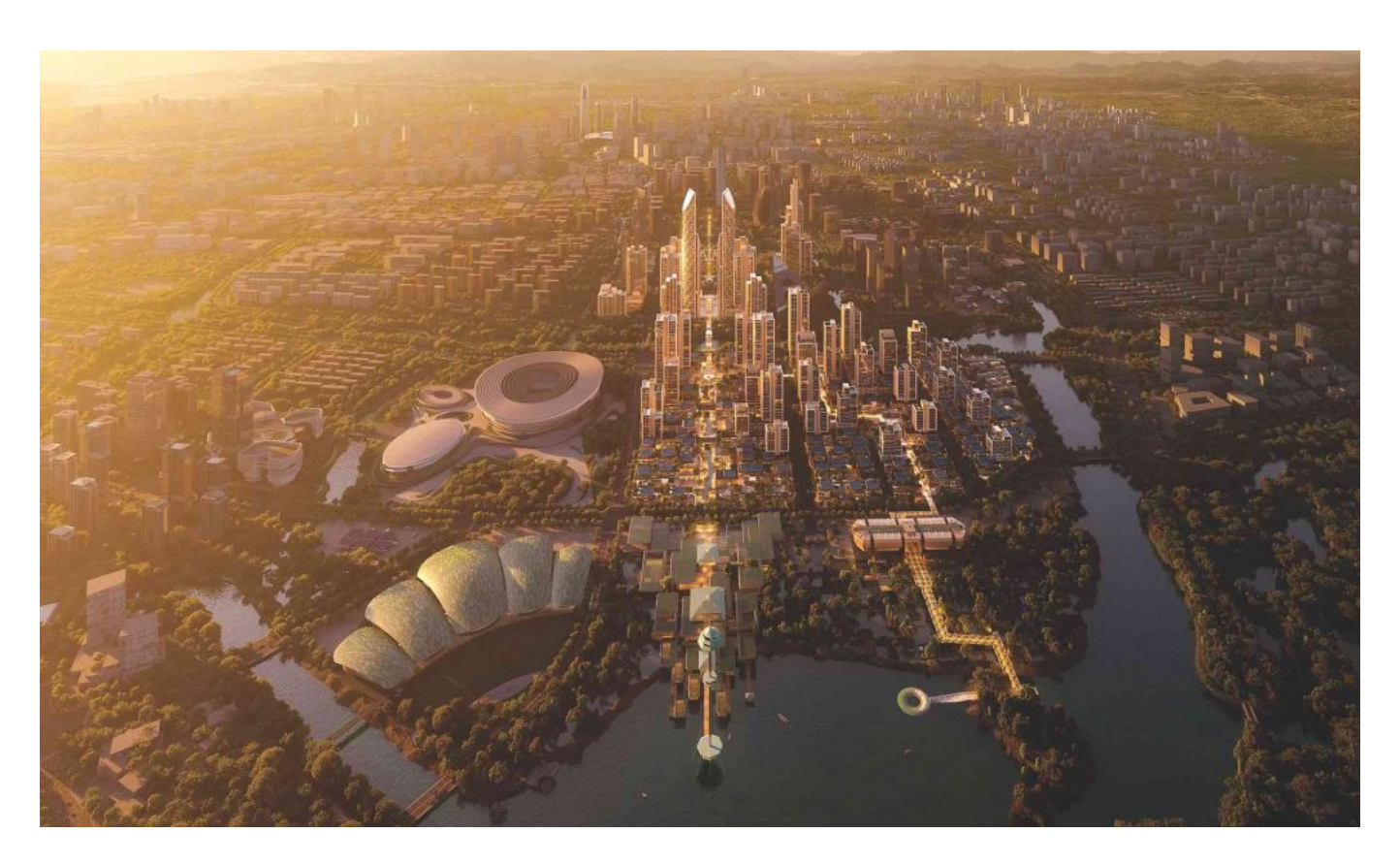
The low-carbon masterplan conserves existing wetlands and incorporates sustainable strategies.