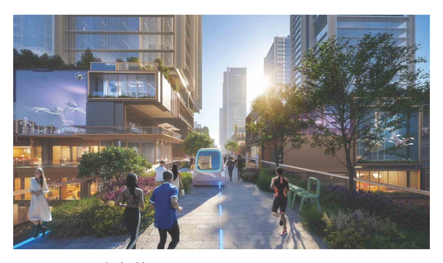
A convenient network of public amenities.