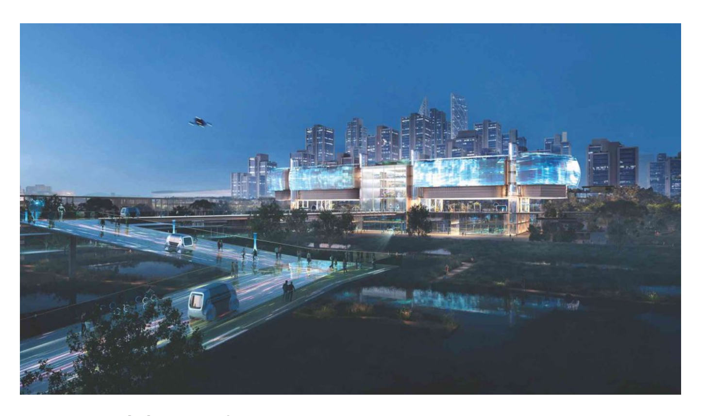
Connecting with the city's infrastructure systems.