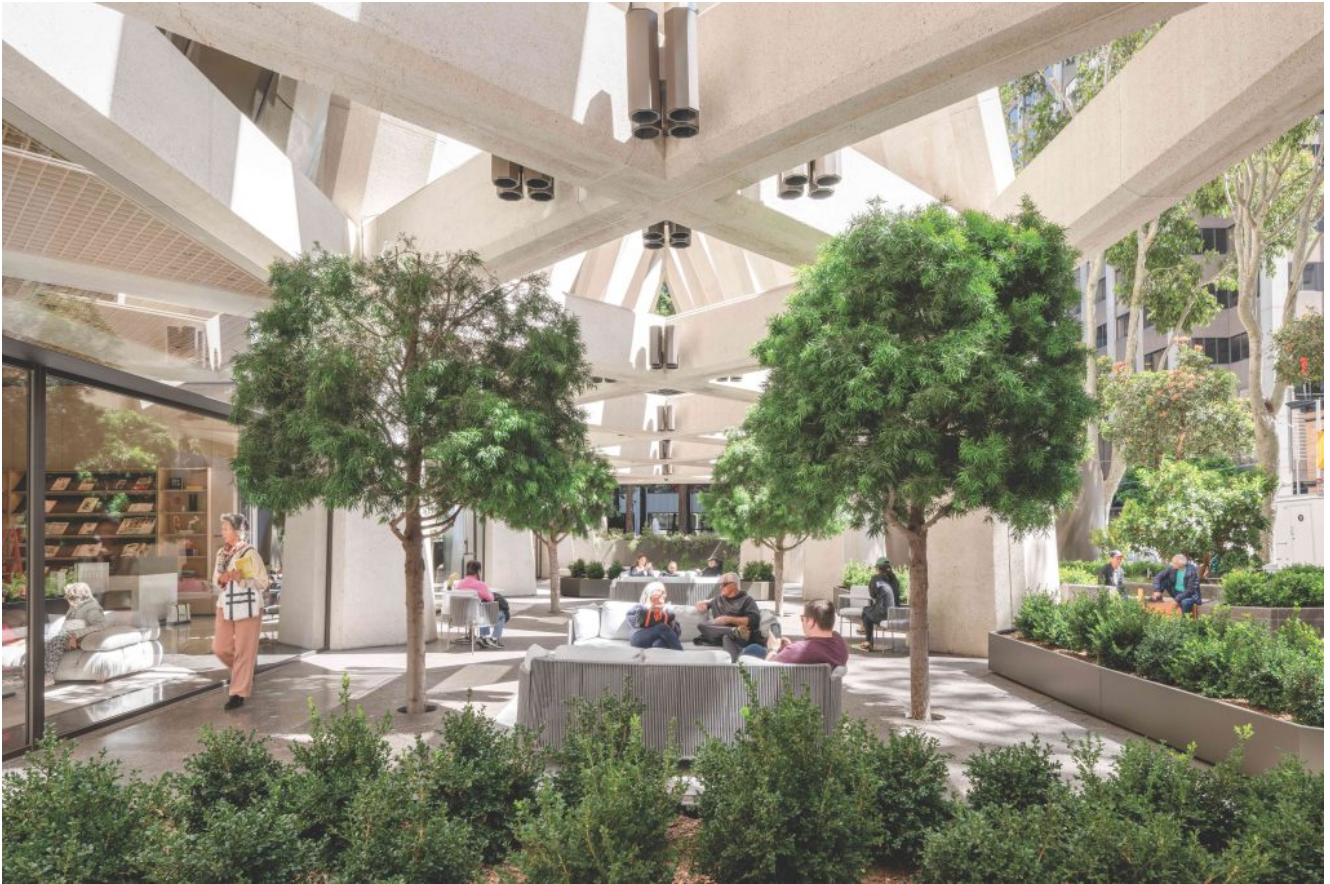
The colonnade is reimagined as an outdoor lounge that blurs the boundary between inside and outside.