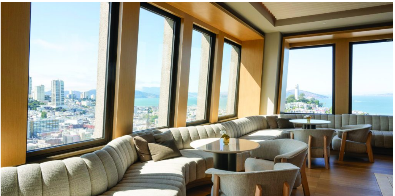
The lobby and amenity levels are reimagined as elevated hospitality spaces, with an emphasis on quality and comfort alongside panoramic city views.