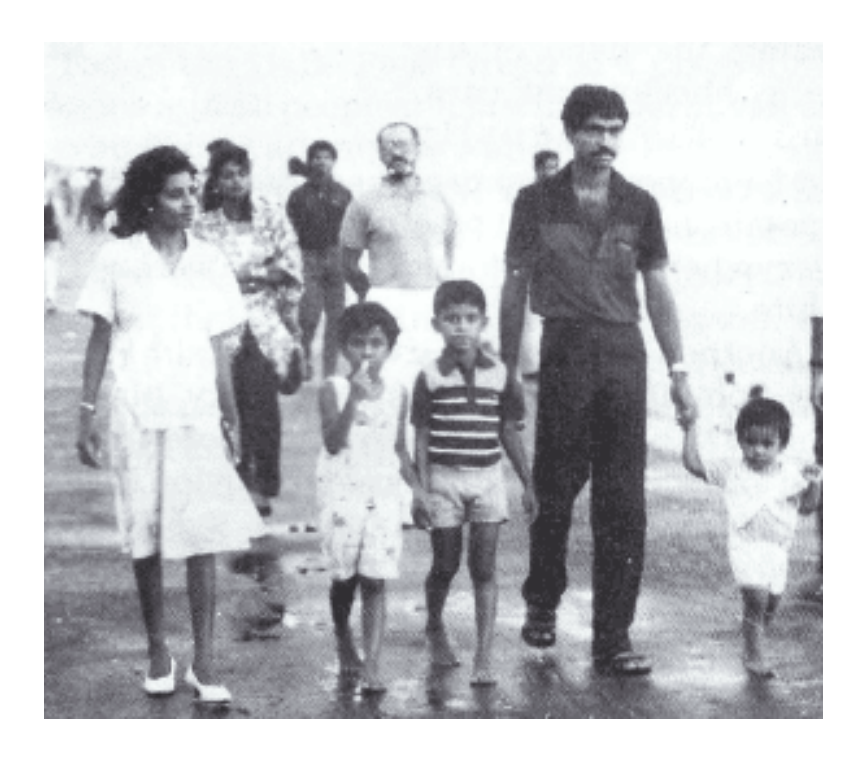
A family on an evening's outing at Galle Face promenade.