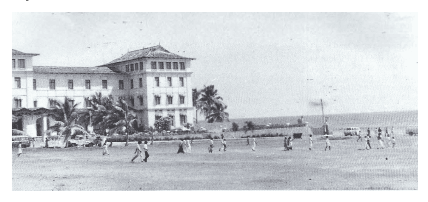
Part of the vast expense of the Green with the Galle Face Hotel on the left.

A sight so common but very dear and still admired is Colombo's Galle Face Green. In the early morning rush it gladdens the heart and lightens the spirit of passers-by with its blue skies and gentle breezes. In the sweltering midday sun the green and large expanse of sea beyond is cool and inviting. The young lovers in Colombo often accept the invitation and they are as common a sight on the Green under their colourful parasols. as are the vendors and regular walkers. At twilight the restaurants on wheels come out and park themselves for the night to serve all of those who still end up at Galle Face Green for a night out.