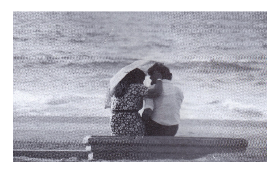
Young lovers like this are a familiar sight at Galle Fare.