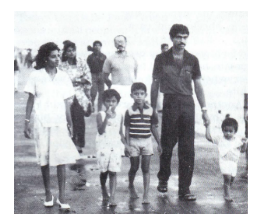
A family on an evening's outing at Galle Face promenade.

British Governor of Ceylon Sir Henry Ward had the promenade which skirts the sea front built; it was completed in 1859. As the inscription has it Ward "recommended it to his successors in the interest of the ladies and children of Colombo." His successors obviously took his advice as it still remains the most popular promenade among the women and children of Colombo and its suburbs. In the evening the early hours of the morning, the leading personalities of the day – men and women – take the morning air before they start work. Enterprising journalists have often resorted to the same practice following the maxim that "the early bird catches the worm."