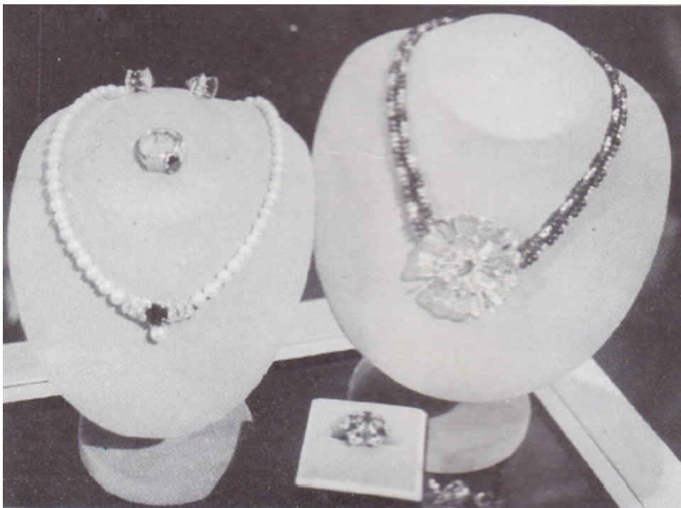
Two necklaces of pearls and beads, and rings to match.

A necklace fashioned in white and red-brown stones in the shape of two prawns lay on a bed of gold velvet with a crocheted cloth making an attractive background.