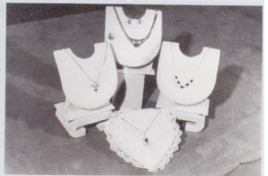
A variety of necklaces on display to tempt the fair sex.