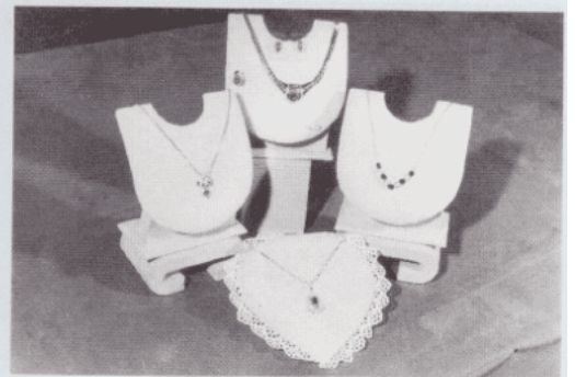
A variety of necklaces on display to tempt the fair sex.