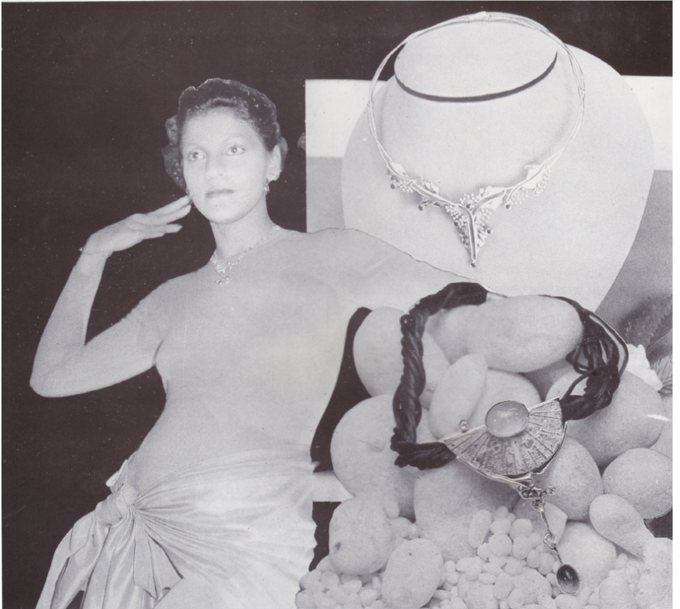
A model displays some interesting jewellery at the exhibition.