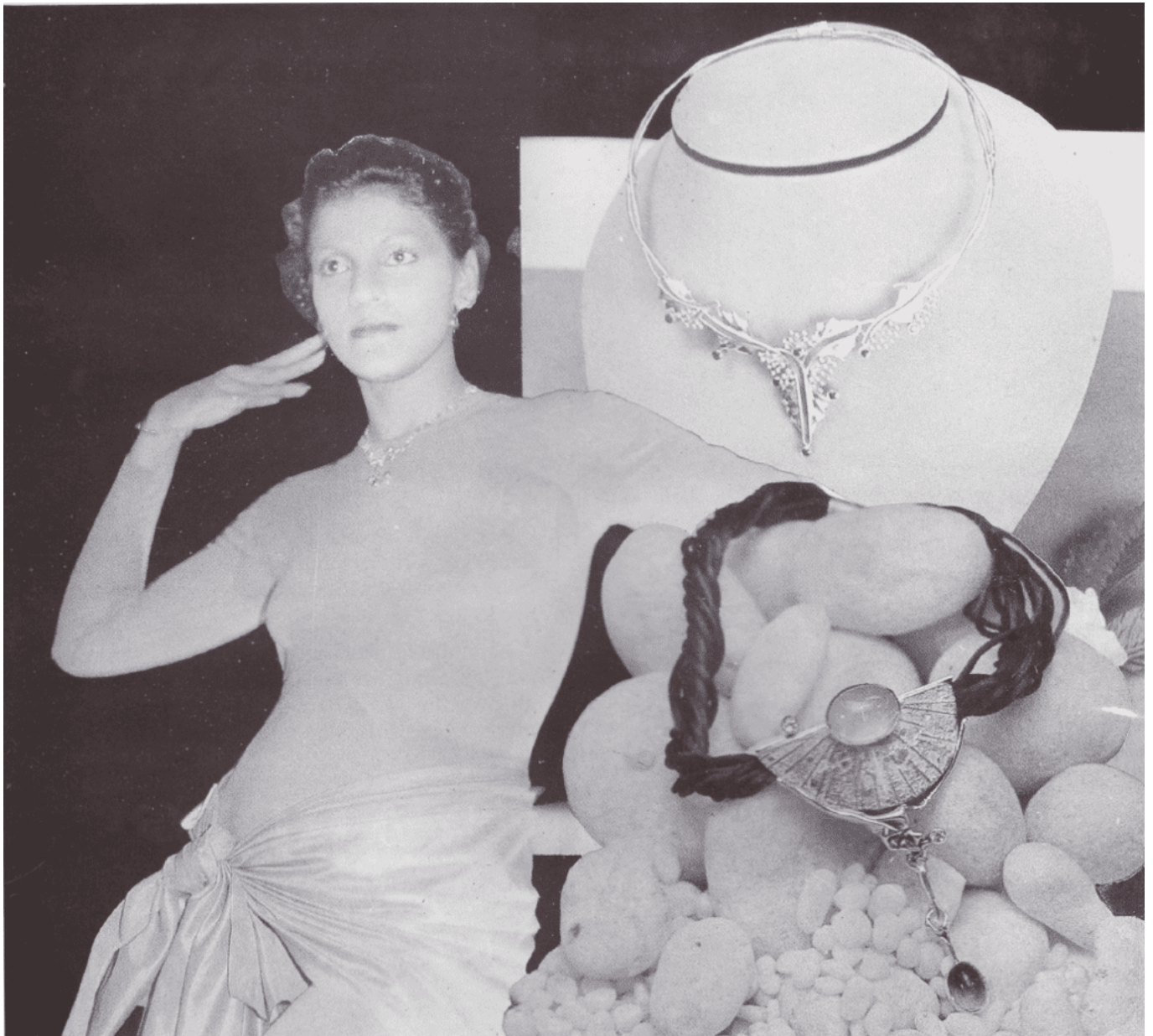
A model displays some interesting jewellery at the exhibition.

For today's fashion conscious women and men, this display of jewellery gave a much needed glimpse of the variety of design and style now available in Sri Lanka and held promise of much more vogue creations in the future.