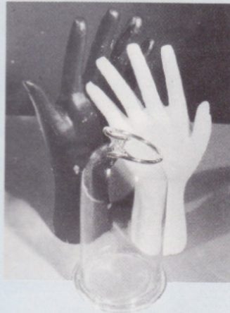
An armlet worked in gold.