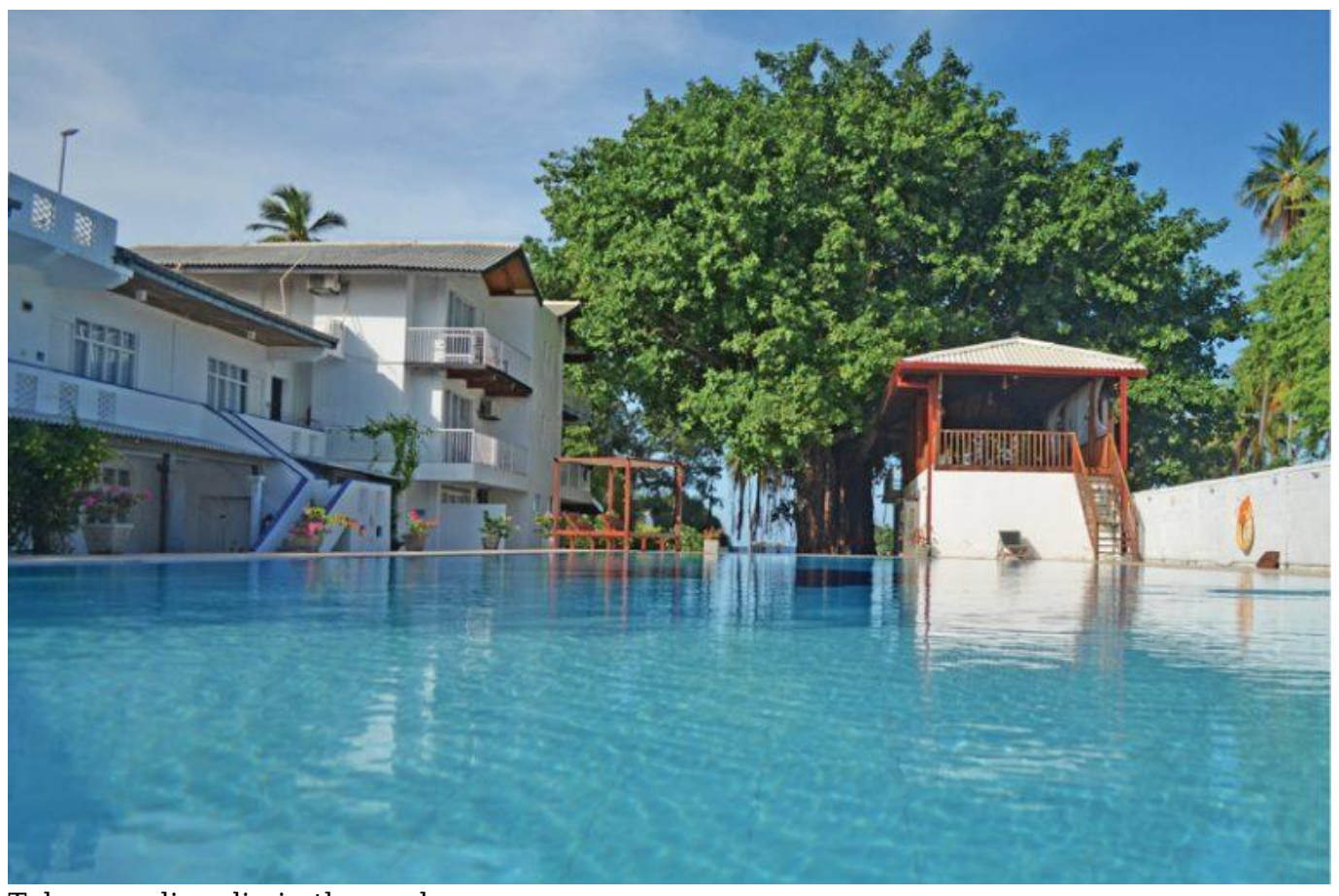
Take a cooling dip in the pool

Luxury and serenity starts from the word go - and as you step into the rooms, you will find out why. A thematically decorated room with all modern facilities ensures that nothing is left unattended. The more spacious ocean front rooms offer the added advantage of a balcony where an evening could be spent enjoying the mild sea breeze blowing across. The luxury suites takes serenity into a new level with a jacuzzi meant to keep the experience resplendent.