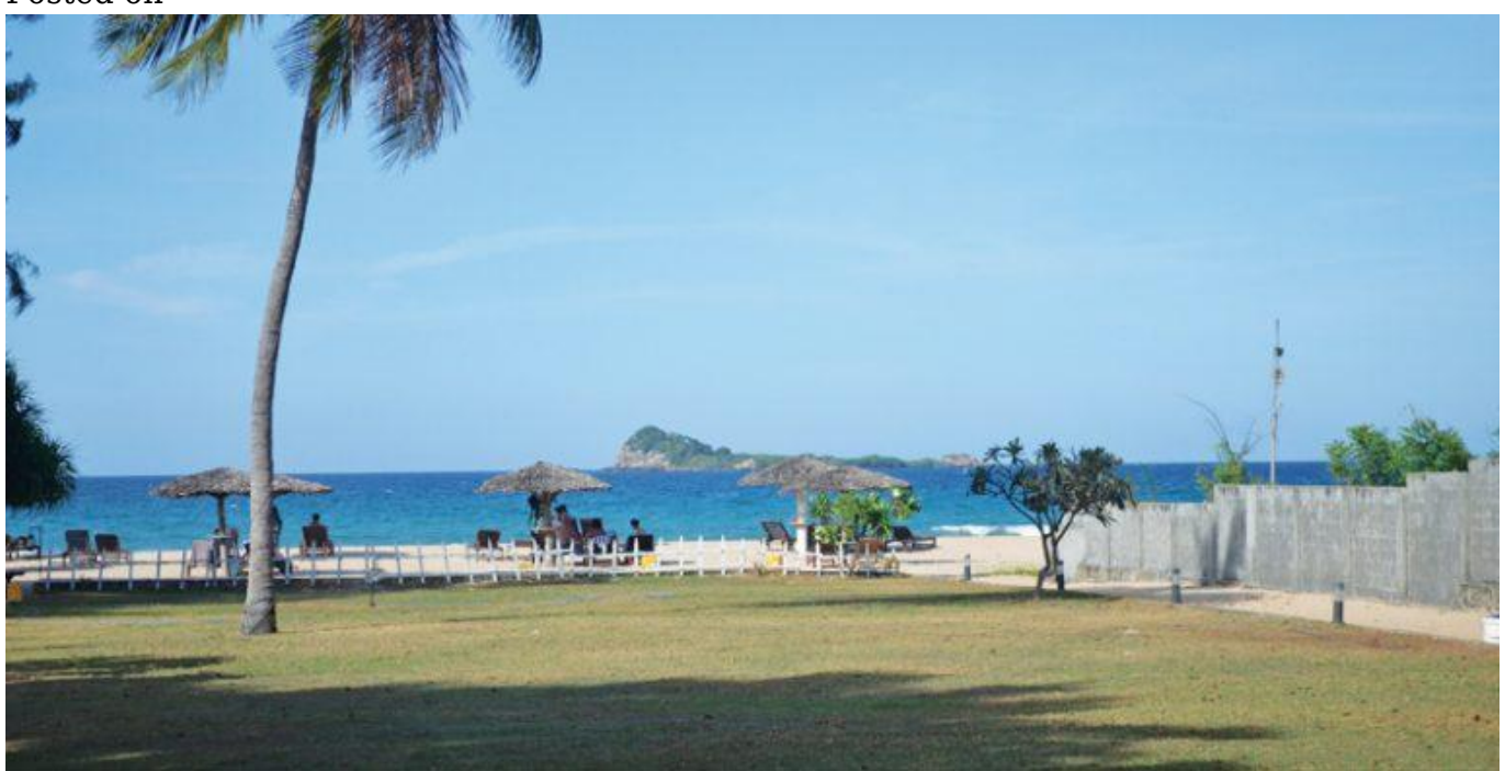
Relax on the tranquil and breezy beach overlooking the Pigeon Island

"The turquoise beach is serene, the breeze calming, and the whole world is yours. Welcome to the exotic Pigeon Island resort." The moment one walks through the ornately decorated doorway this is the vibe that is felt. Indeed, for a getaway with bliss and tranquil, there could be only very few alternatives to match this experience.