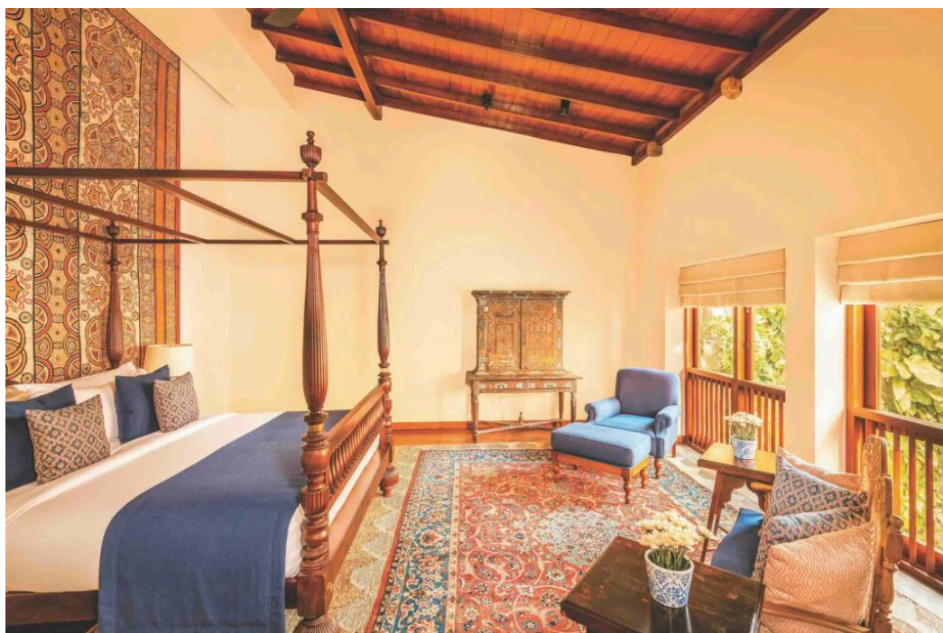
Master Suite 1.