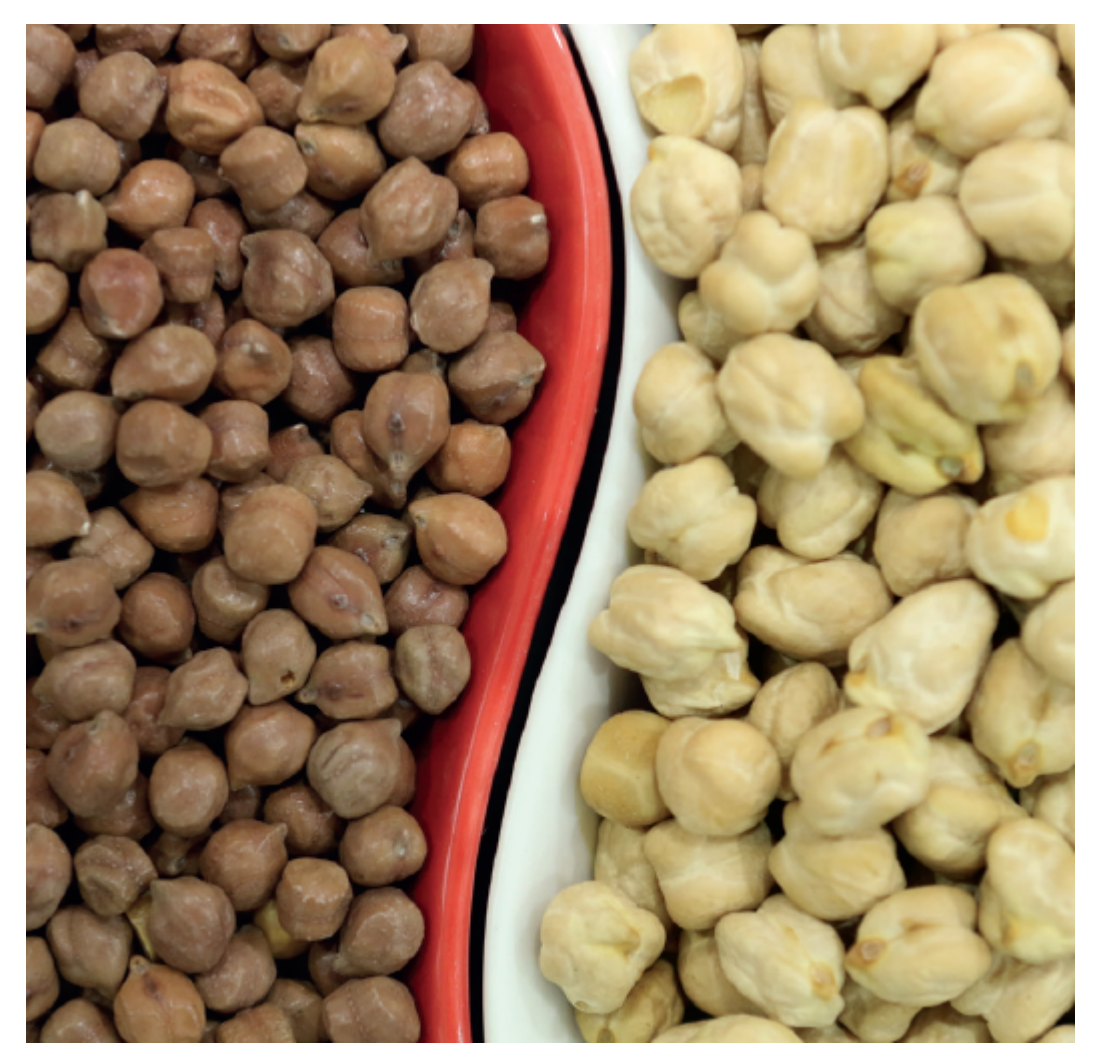
Brown chickpea and Kadala.