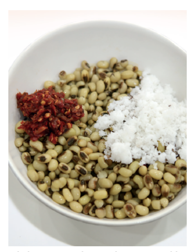
Boiled cowpea with grated coconut and lunu miris gives a creamy taste.