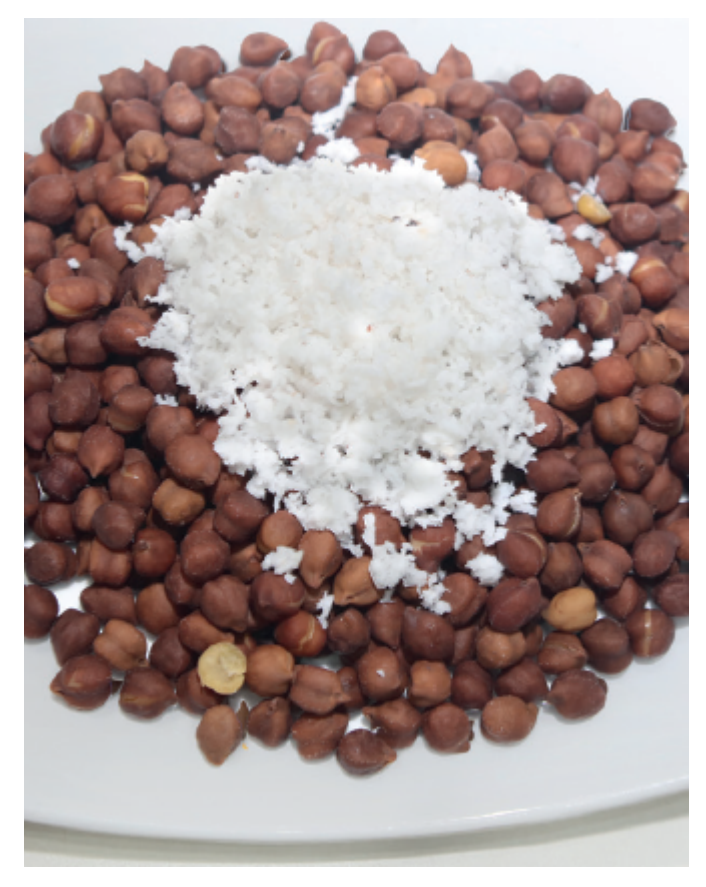
Boiled konda kadala is packed with plenty of nutrients.