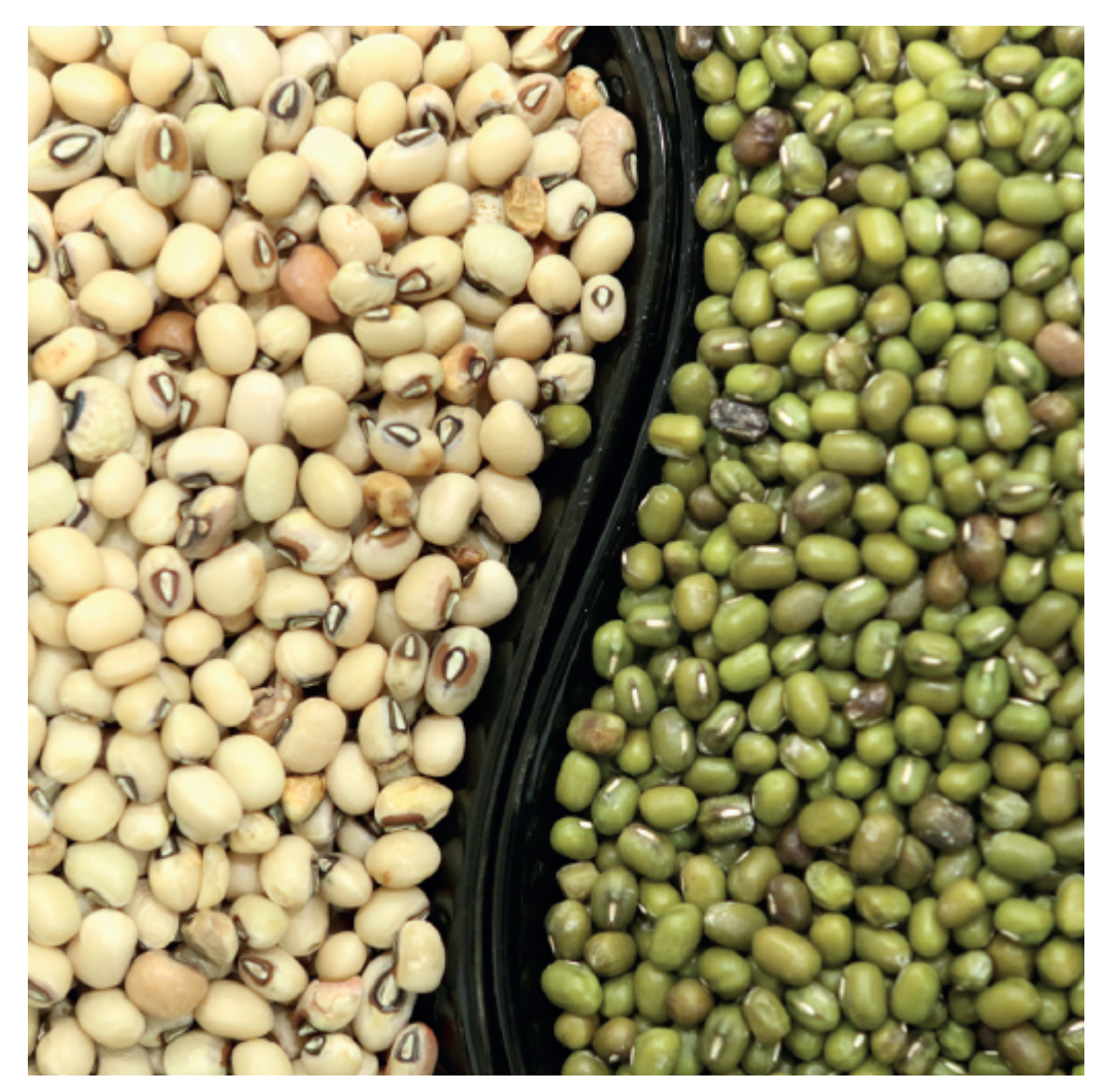
Black eyed peas or cowpea and mung eta/green gram.