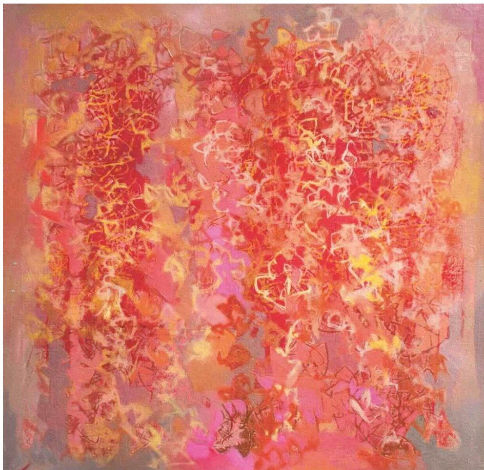
Freedom Search XVIII.