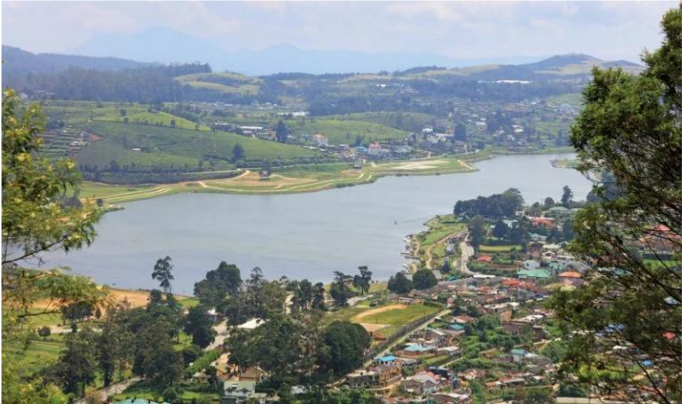
A bird's-eye view of Lake Gregory above which lie the Moon Plains

There were no words to describe the panorama. From the characteristic English architecture to the glistening Lake Gregory; everything wonderful about Nuwara Eliya was before our eyes. We could make out the colourful boats and jet skis near the lake. The Tudor-style cottages and flower gardens amidst modern buildings expanded throughout the valley with pockets of thick green. The Nuwara Eliya Racecourse stood quaint and beautiful. The Piduruthalagala and Hakgala mountain ranges were before us, a dark blue silhouette lost in the thick mist. Lush tea fields rolled off the mountain slopes like a neat carpet and the rays of the morning sun shone on Moon Plains like a spotlight.