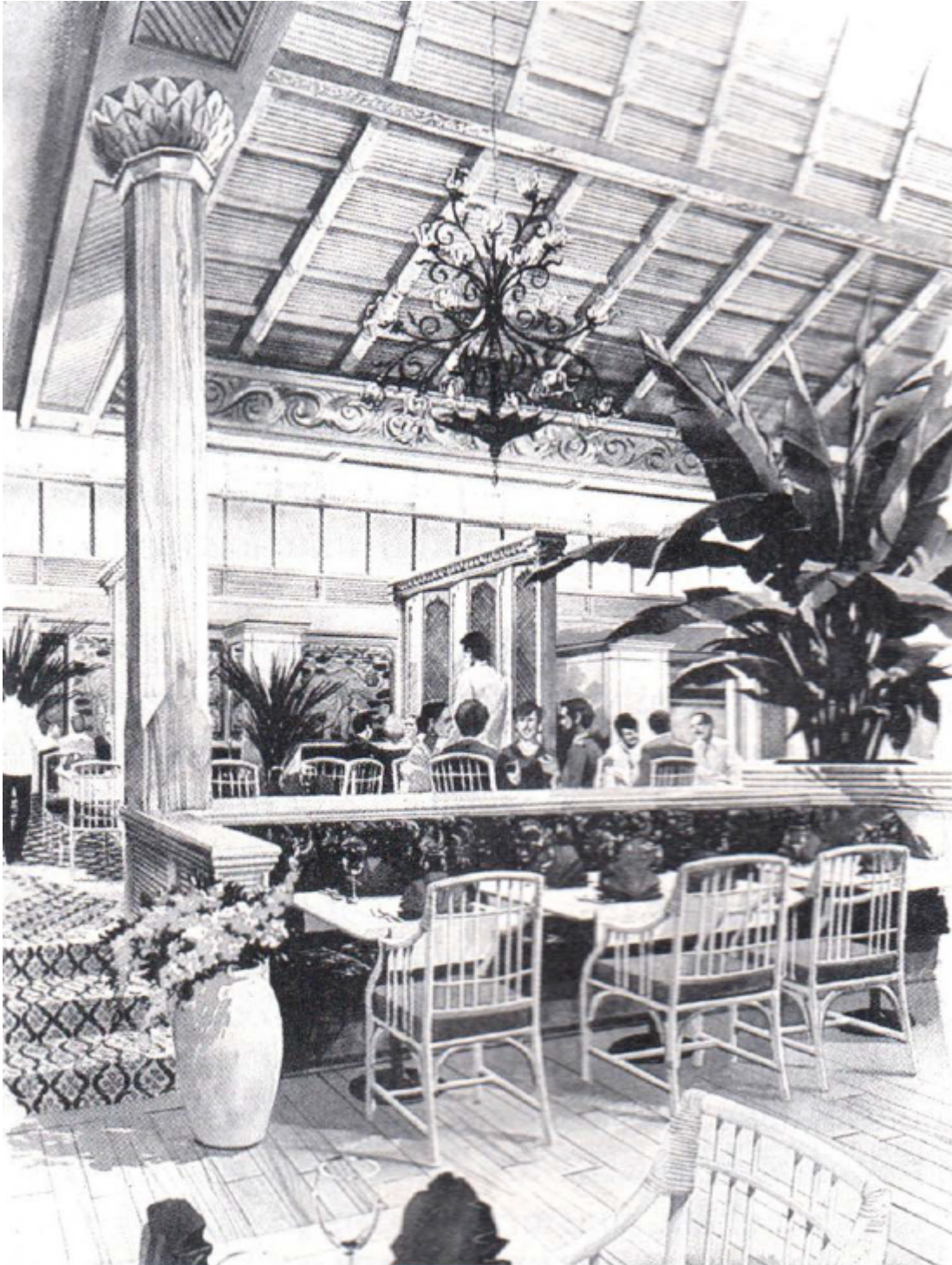
The LOTUS TERRACE which brings the feel of tropical flowers and ferns, and traditional Sri Lankan decor.