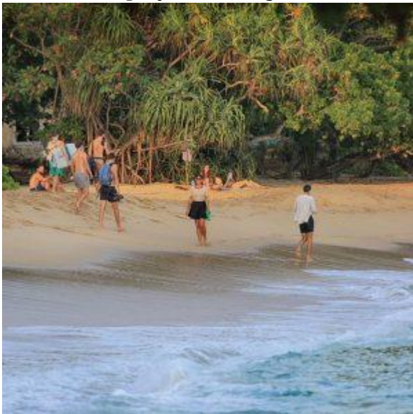
The cove is also perfect to enjoy with friends