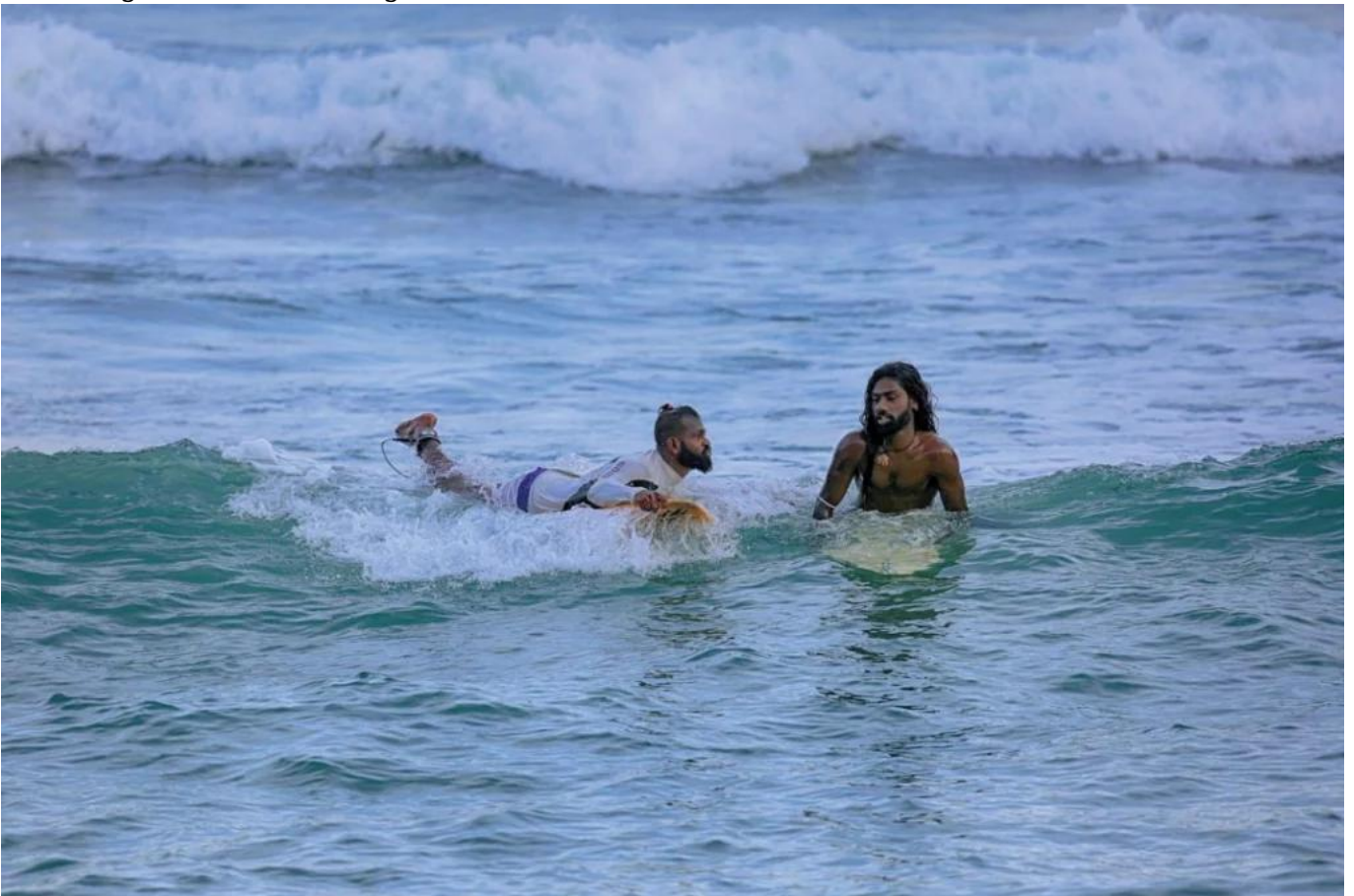
Sri Lankan surfers eagerly awaiting a big wave