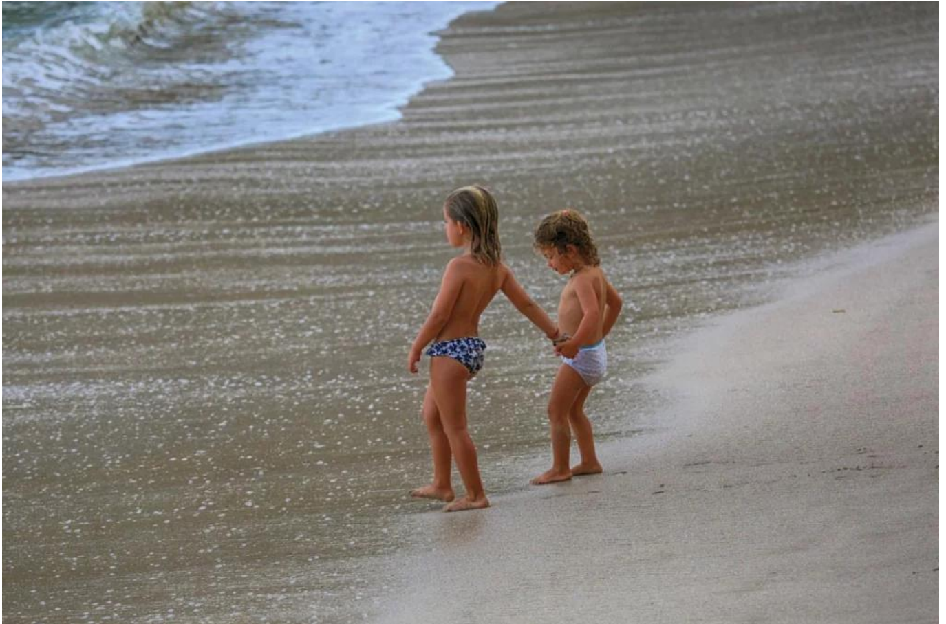
Kids love to play at the edge of the water