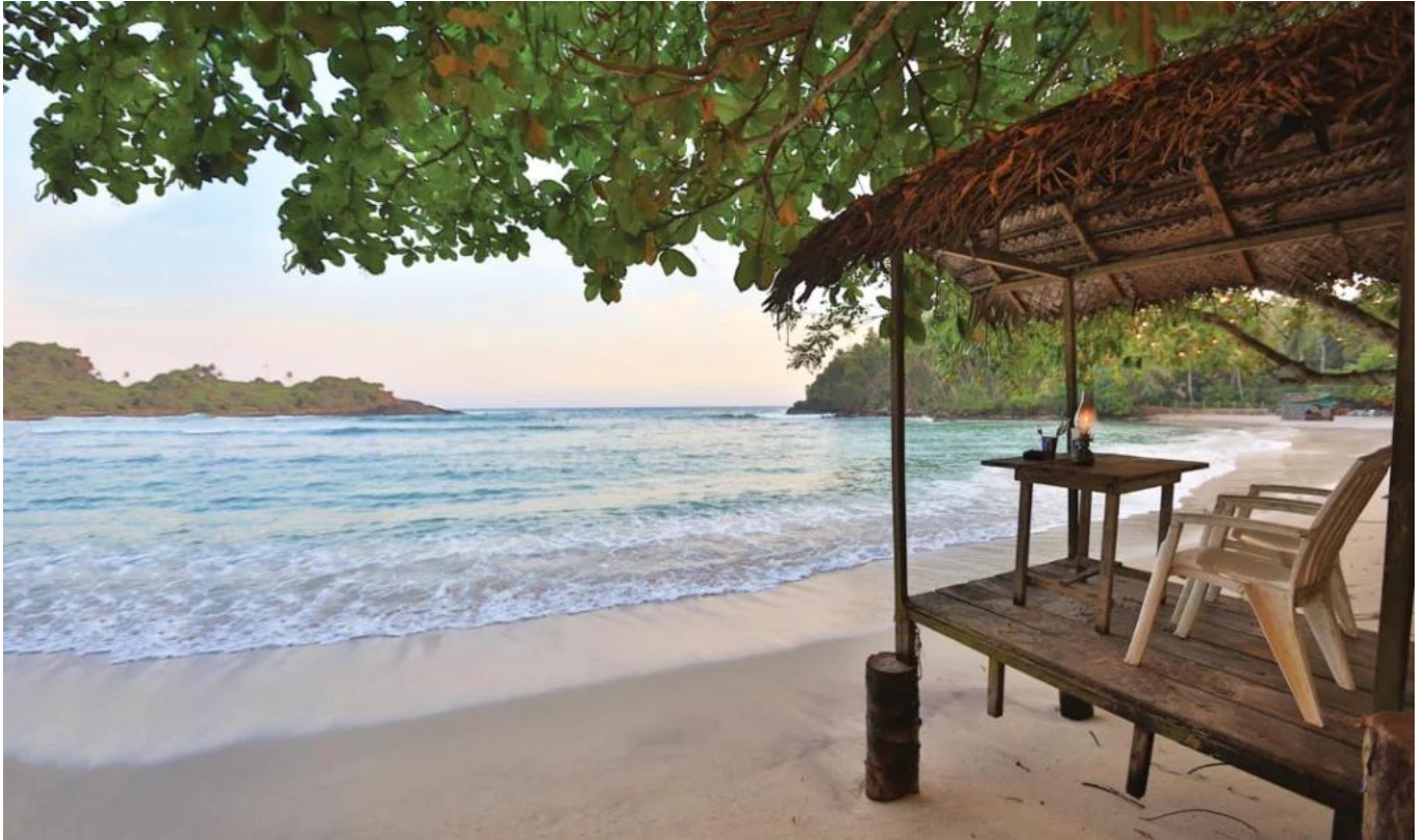
An ideal place to take it easy