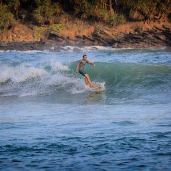
A race against the breaking wave