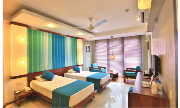
A spacious twin-bed room for a comfortable stay