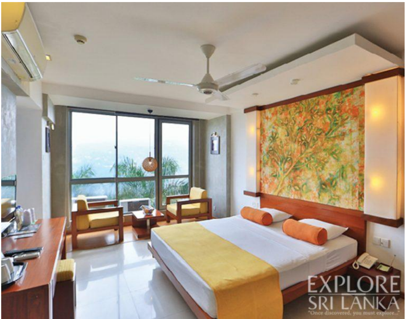
The elegant Presidential suite on the Green floor

Designed with dewy-eyed honeymooners in mind, the fourth level is a tribute to the lovers who desire the allure of Kandy. Dazzling red roses are the theme of this floor and thus, aptly named the 'Rose floor'.