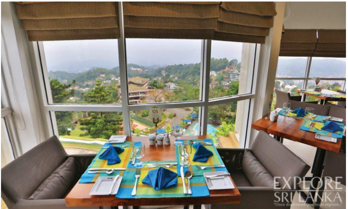
Dine while enjoying stunning vistas at Sky Lounge

With 72 rooms, positioned across several levels, Hotel Topaz strives to create a unique getaway for each guest. The first floor is the 'Water Lilly floor', which offers a range of comfortable twin-bed rooms. The corridors of this floor are furnished with little fish tanks on which a brightly lit tiny oil lamp is kept to add an ornamental charm and this feature extends to the tastefully decorated rooms. The cement wall finishes complement wooden touches and vibrant décor within spacious interiors. Each twin-room features modern amenities and has an en-suite bathroom with a chic marble bathtub.