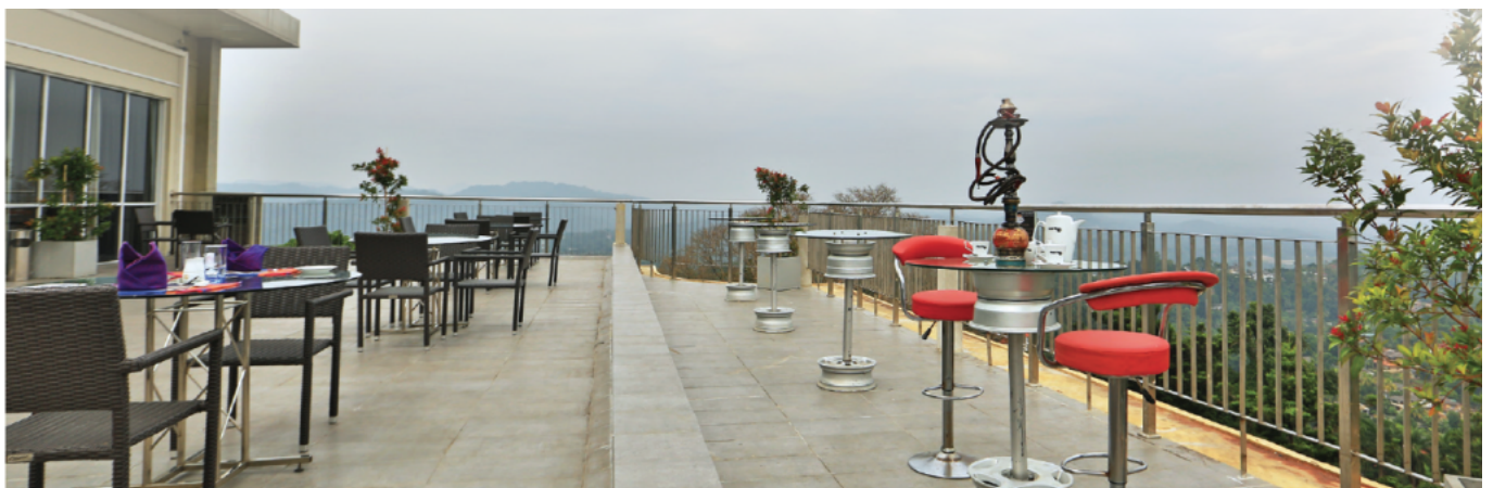
Snack on as you enjoy fascinating views from the Sky Lounge terrace