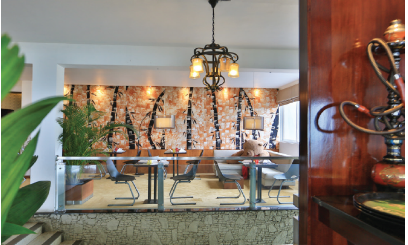
Treat yourself at the cozy coffee shop