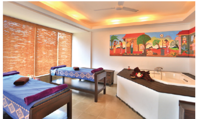
Get rejuvenated at the Tourmaline Spa