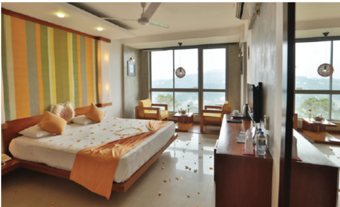
A beautifully decorated Honeymoon suite