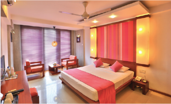
A Deluxe room featuring pastel shades