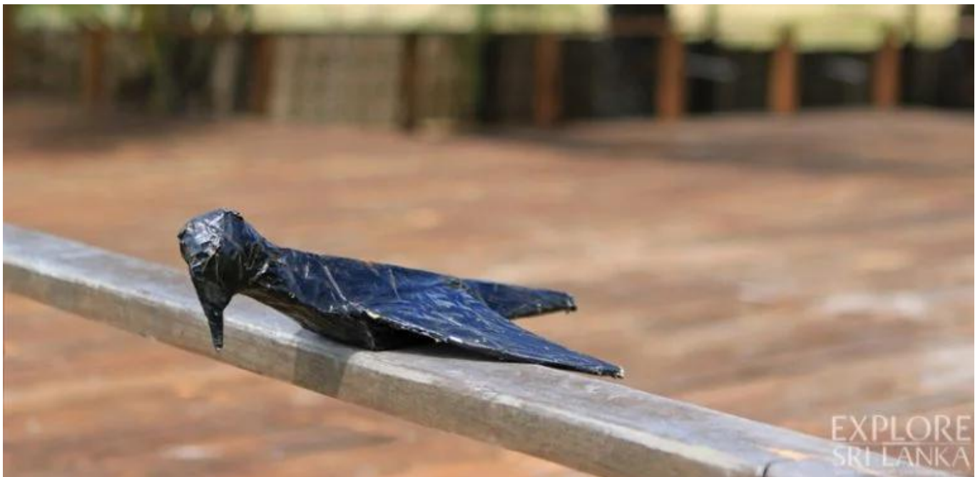
Handmade crows - another interesting method seen in Whisky Point

While one may think that only human figures are used as scarecrows, another interesting method used in Whisky Point to ward off birds from littering or stealing food, is to place a hand-made figure of a crow. At first one would assume it is an actual bird and it is only when you take a closer look that you realise the bird is literally a 'scarecrow'.