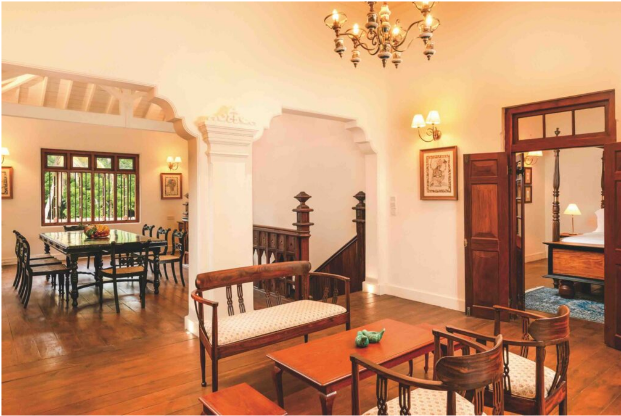
The 19th century bungalow, infused with colonial elegance.