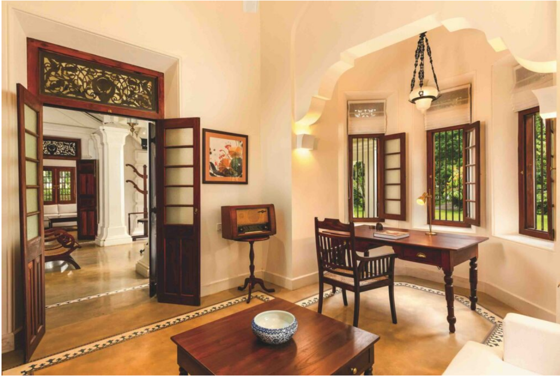
Grand suite features a spacious bedroom and a welcoming living area.