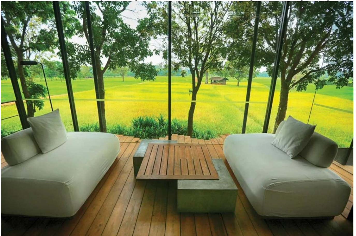
Guests can relax and immerse in the vistas of lush green paddy fields.