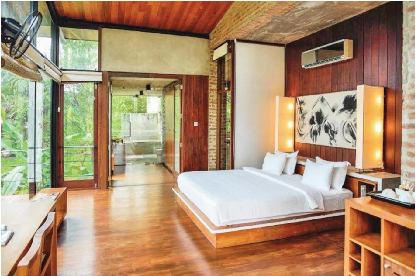
Bakmee chalet blends the comforts of sophistication and nature.

(+94) 775 205 475 reservations@kalundewaretreat.com kalundewaretreat.com