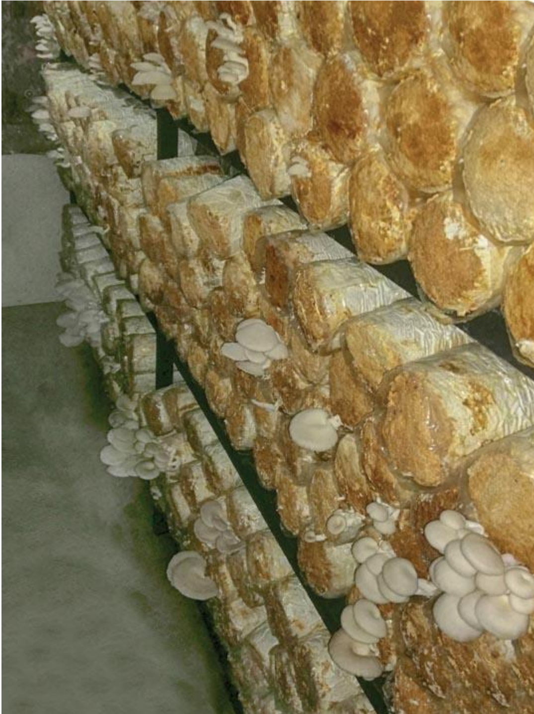
A mushroom farm cultivated in the property.