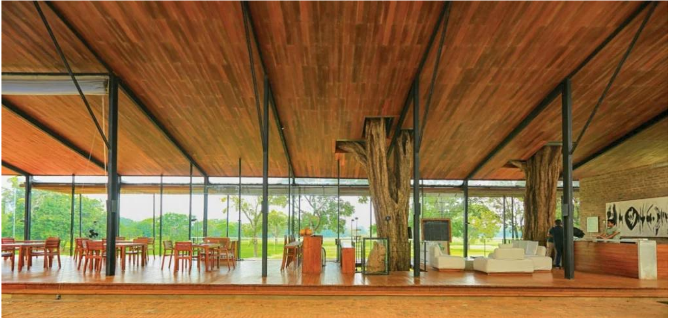
The open and spacious Tree House comprises the main restaurant and lobby.