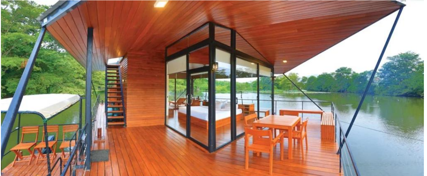
Nil Manel (Blue Water Lilly) floating villa is ideal for those seeking a romantic getaway.