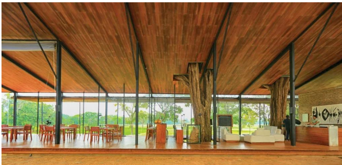
The open and spacious Tree House comprises the main restaurant and lobby.