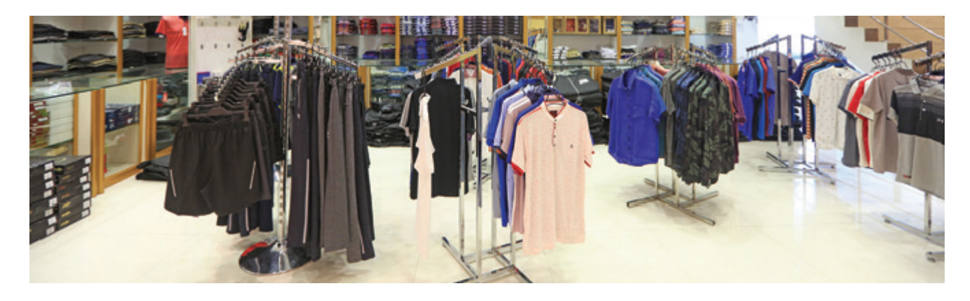
Gents can browse through a range of casual wear.