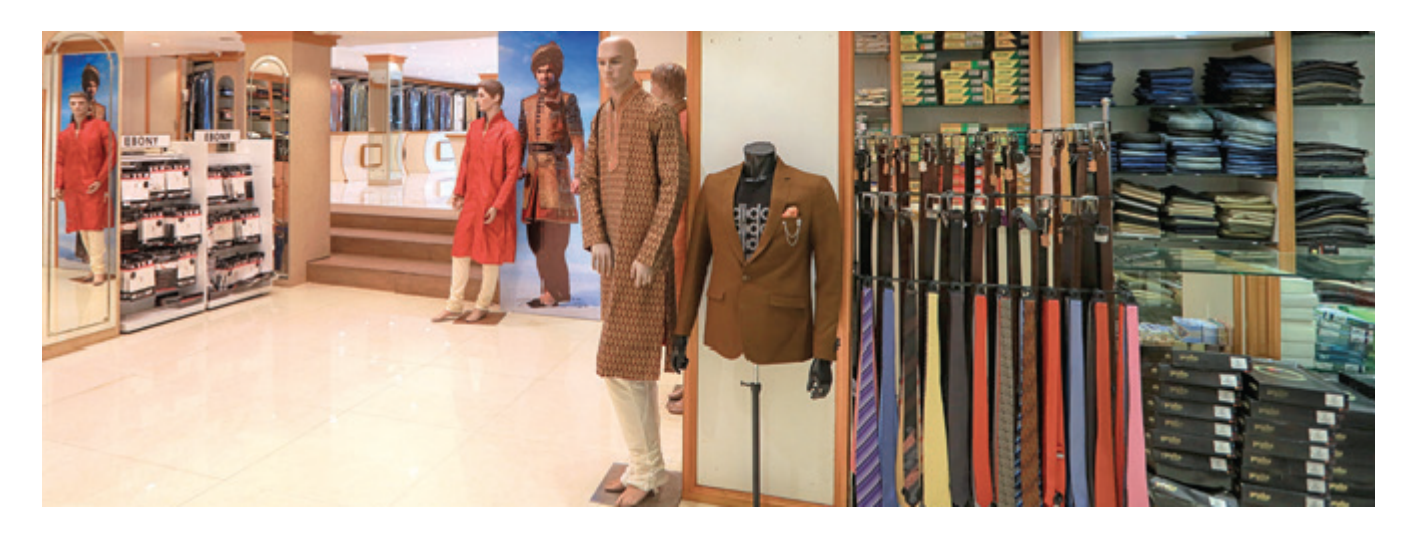
Third floor displays an array of ethnic groom's wear and complementing accessories.