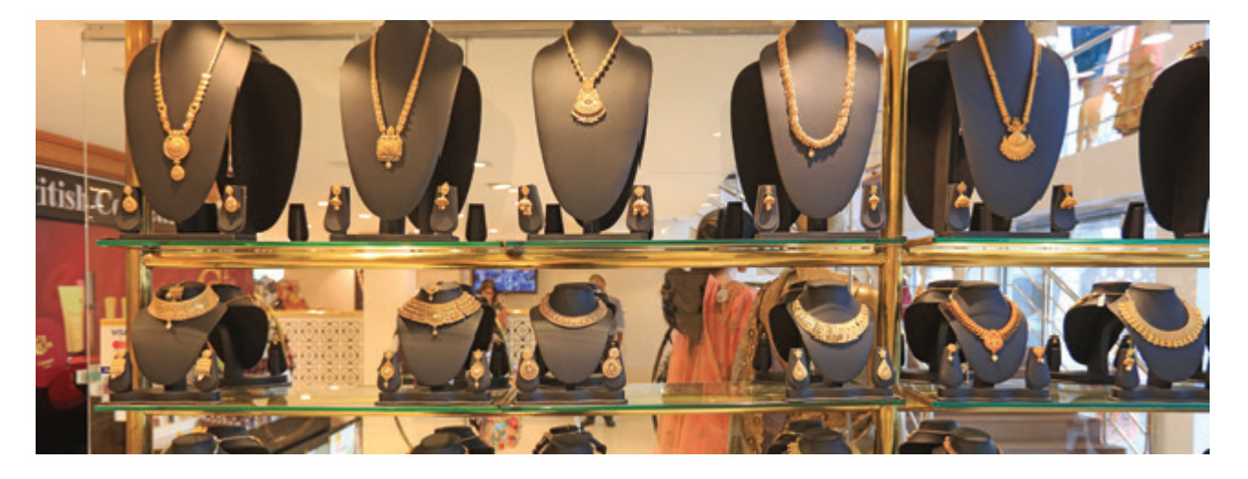
An opulent selection of aesthetic jewelry.