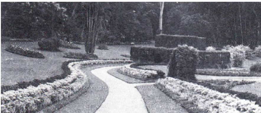
The neatly laid out borders along the paths at Peradeniya Botanical Gardens. (Suresh de Silva)

'While the Kandy Lake, built by the last king, Sri Wickrema Rajasinghe, is an inviting place for a morning or evening walk in the cool shade of large trees, there is also a boat service which will take you for a ride on the lake for a different view of Kandy town and the surrounding hills. But if it is the excitement of a tropical bazaar that one is looking for, one is bound to find it all in the many streets of the city. The shops open out to the street, some spilling over on to the sidewalk and traders invite you to be tempted with anything from batik sarongs to wall hangings, wooden Buddha images, wall plates in brass, chintzes and sarees, spices, tea and coffee beans, Chinese rice cookers or English pop-toasters.