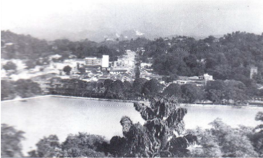
A view of Kandy town from across the lake.