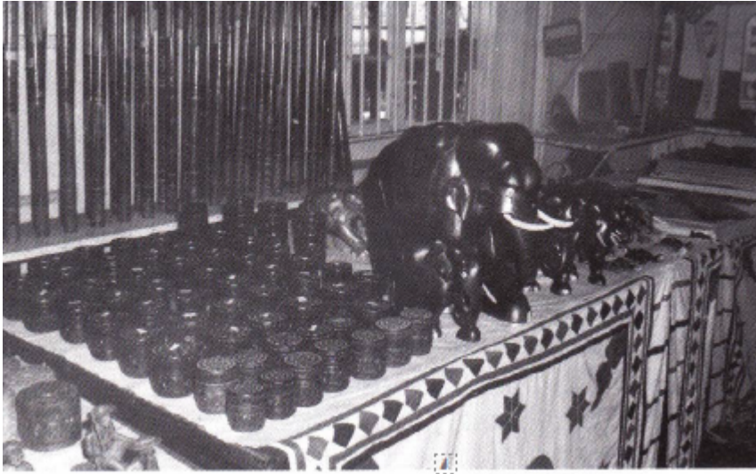
Ebony elephants, mahogany receptacles, wooden figurines and walking sticks on display at the showrooms of the KAA.