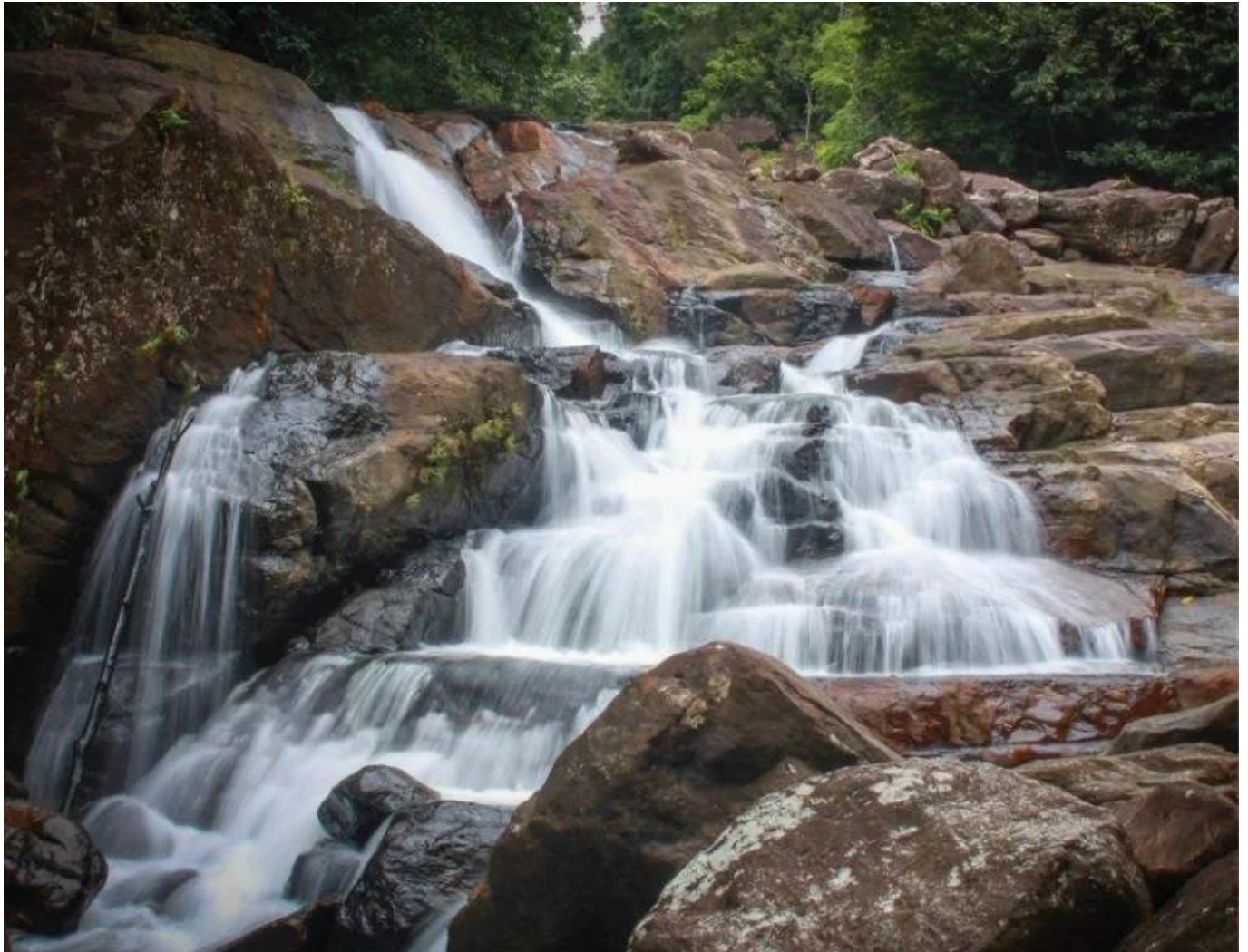
Anagimala Ella, waterfall captured during a non-rainy season

many endemic fish, the golden rasbora, cherry barbs and black ruby barbs, are seen the most.