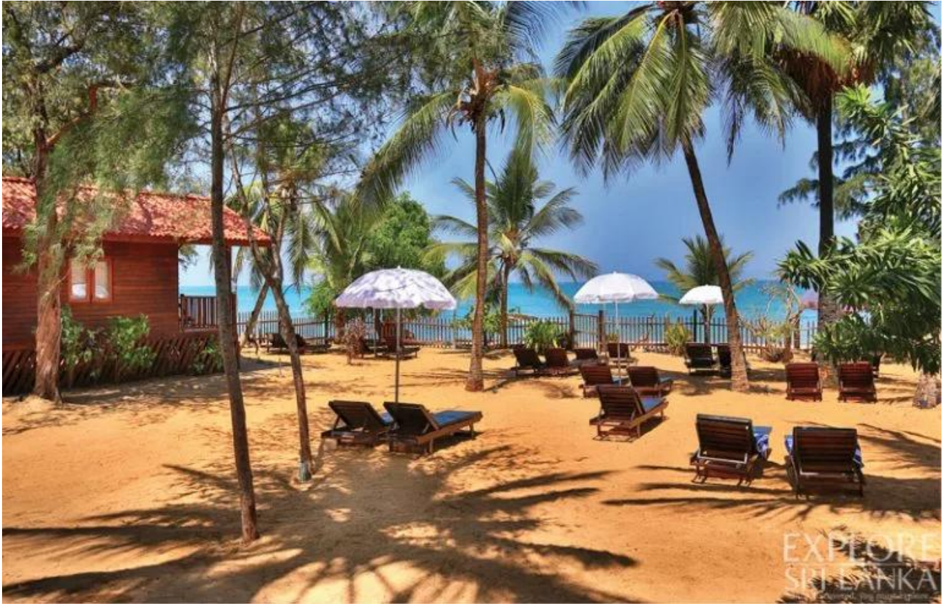
AirPod, the beachside lounging area

ArugamBay PodBay is the partner property of the pioneering Paper Moon Kudils in Whisky Point and Arugambay Roccas. Like the other two other properties, all staff at ArugamBay PodBay are full time employees from in and around the area, thus moving away from the norm and setting an example to all. The initiatives of these properties have raised the profile of the area to become a destination that sees visitors all year round. Thus, Arugambay is no longer solely about surfing. Arugambay was selected by Lonely Planet as Asia's eighth best destination to visit, thus recognising the diversity of the South-East coast.