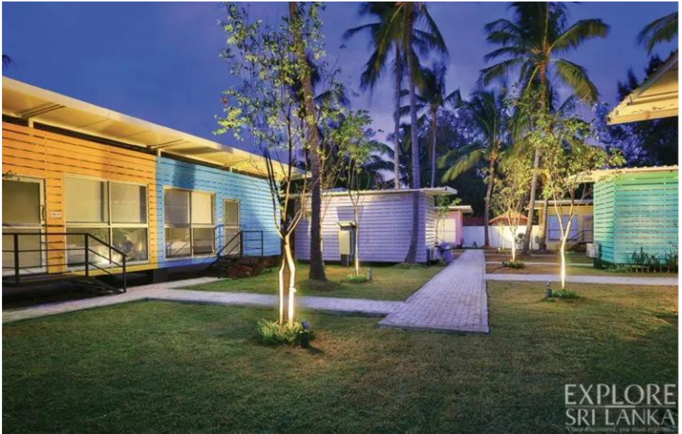
Colourful Pods are arranged symmetrically

The WaterPod, which is the swimming pool at ArugamBay PodBay is one of the largest in the area. The beachfront, termed AirPod is lined with sunbeds and umbrellas so that guests can enjoy the cool air under the eastern sun. From the beach front of the resort, one can see both points of the main bay; Arugambay Point and Pottuvil Point.