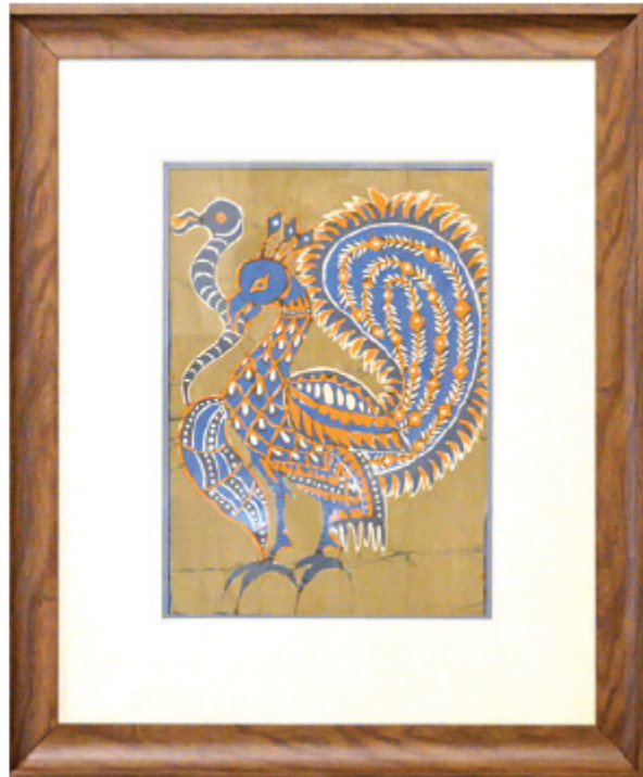
Left and right photo: Peacock and snake by Padmini Jayasinghe, 1970's.