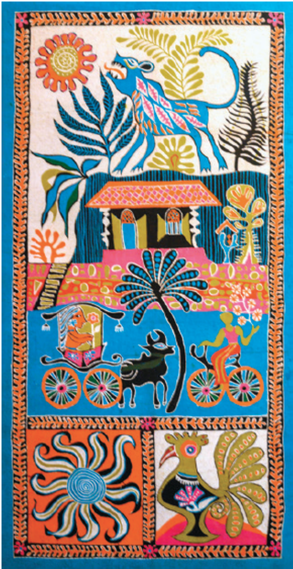
Wall hangings with village scene by Laki Senanayake, 1967.