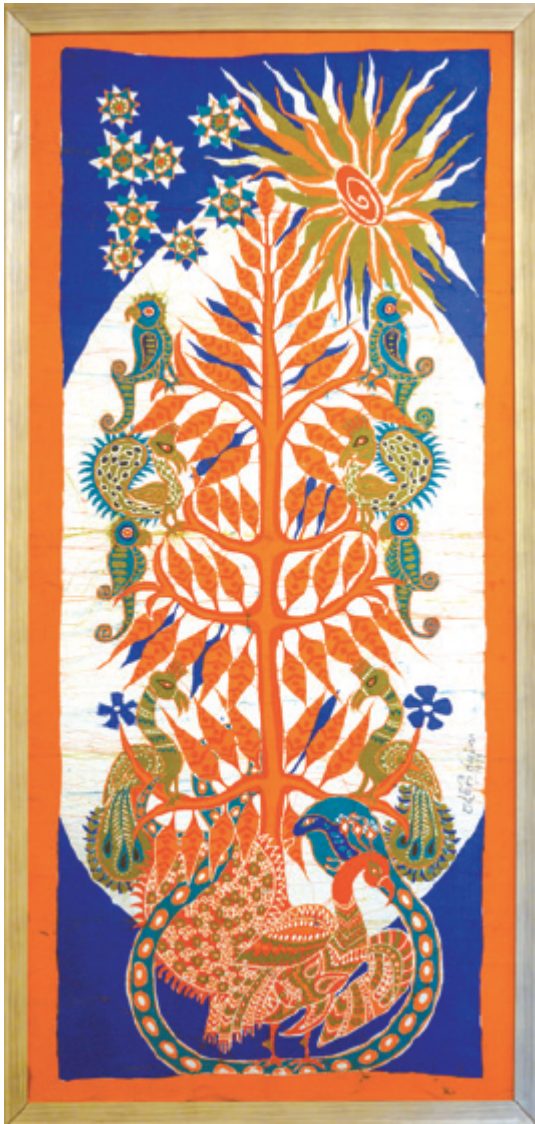
Tree of Life by Padmini Jayasinghe, 1970's.