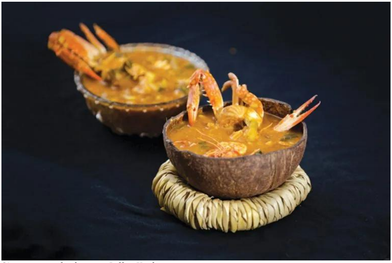
Signature seafood soup - Jaffna Kool.