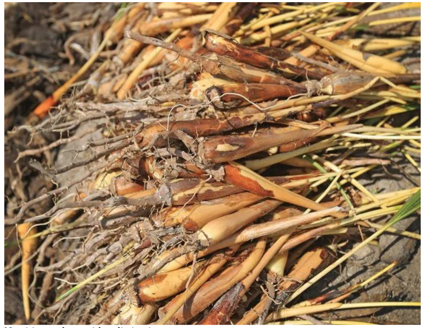
Nutritious tubers with a distinctive taste.