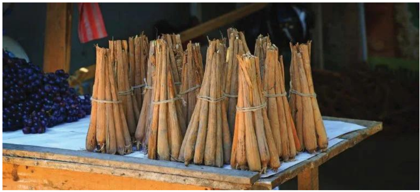
A bundle of joy.