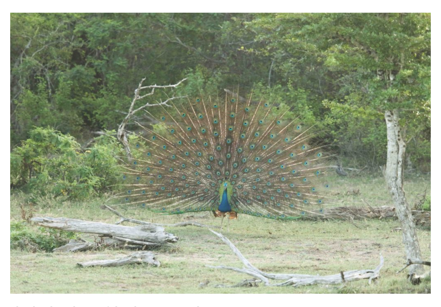
The dazzling dance of the elegant peacock.