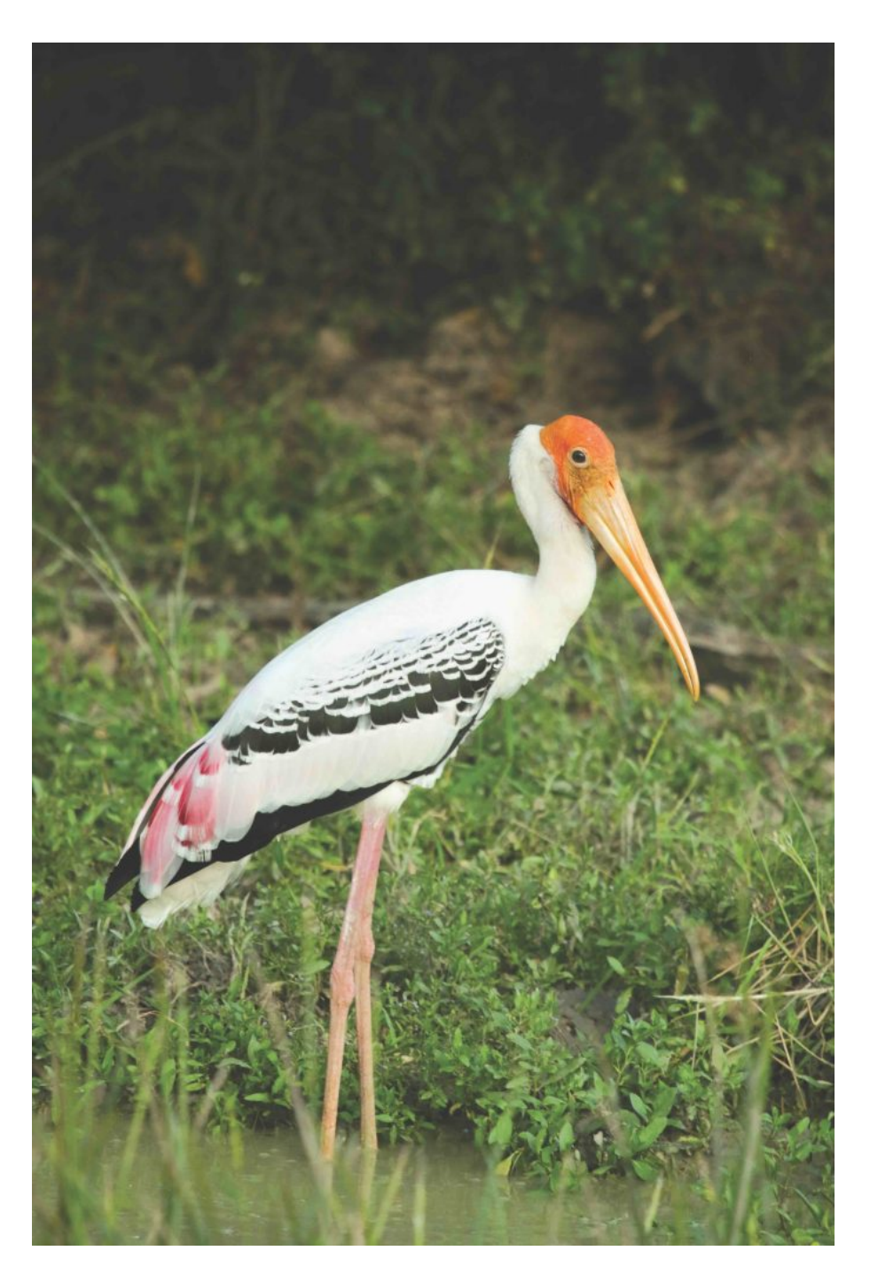
Standing out stylishly - the Painted Stork.