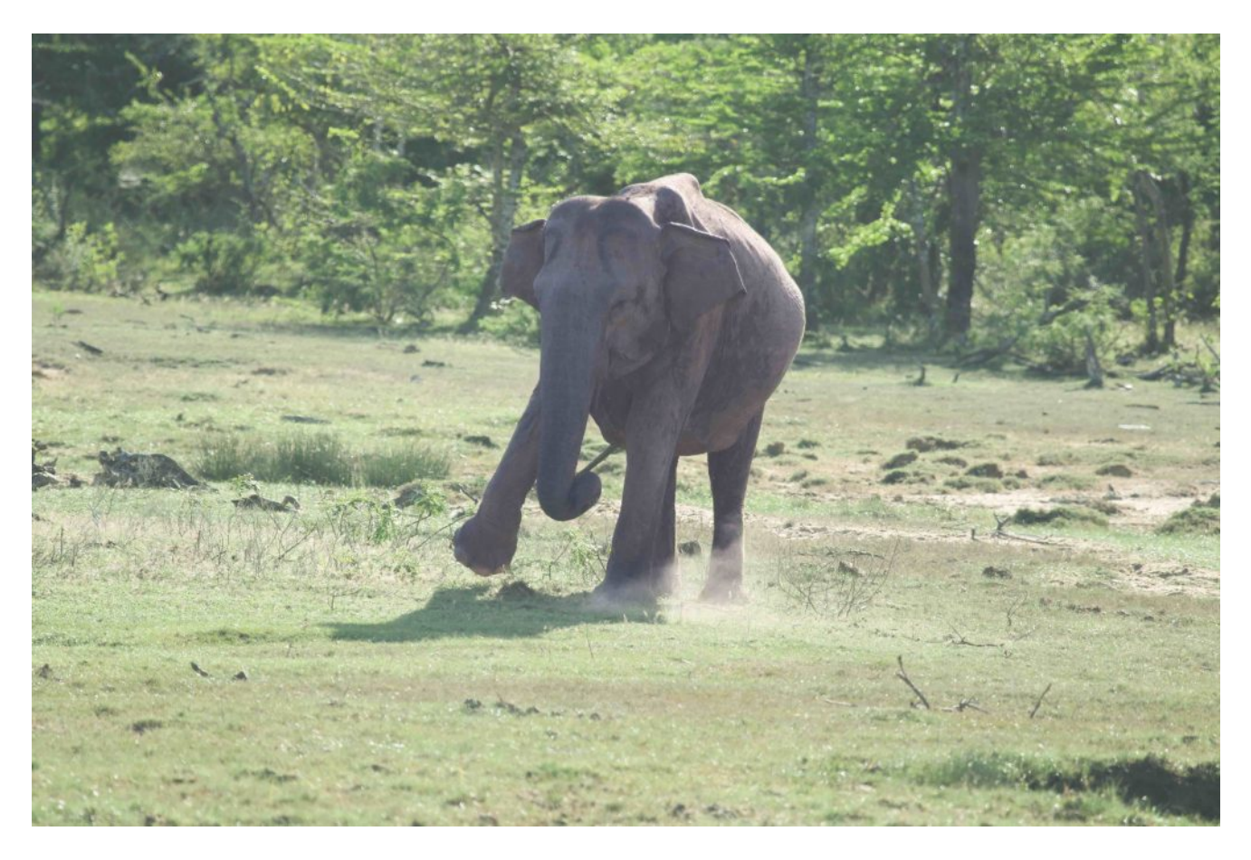
A playful moment.