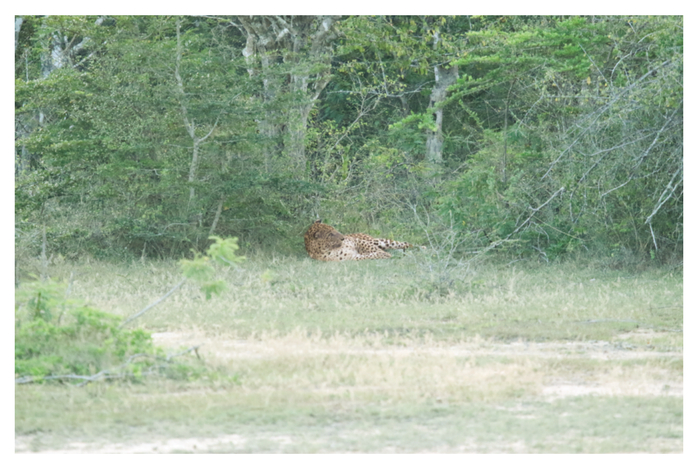
The majestic leopard in a mesmerizing and marvelous mood.