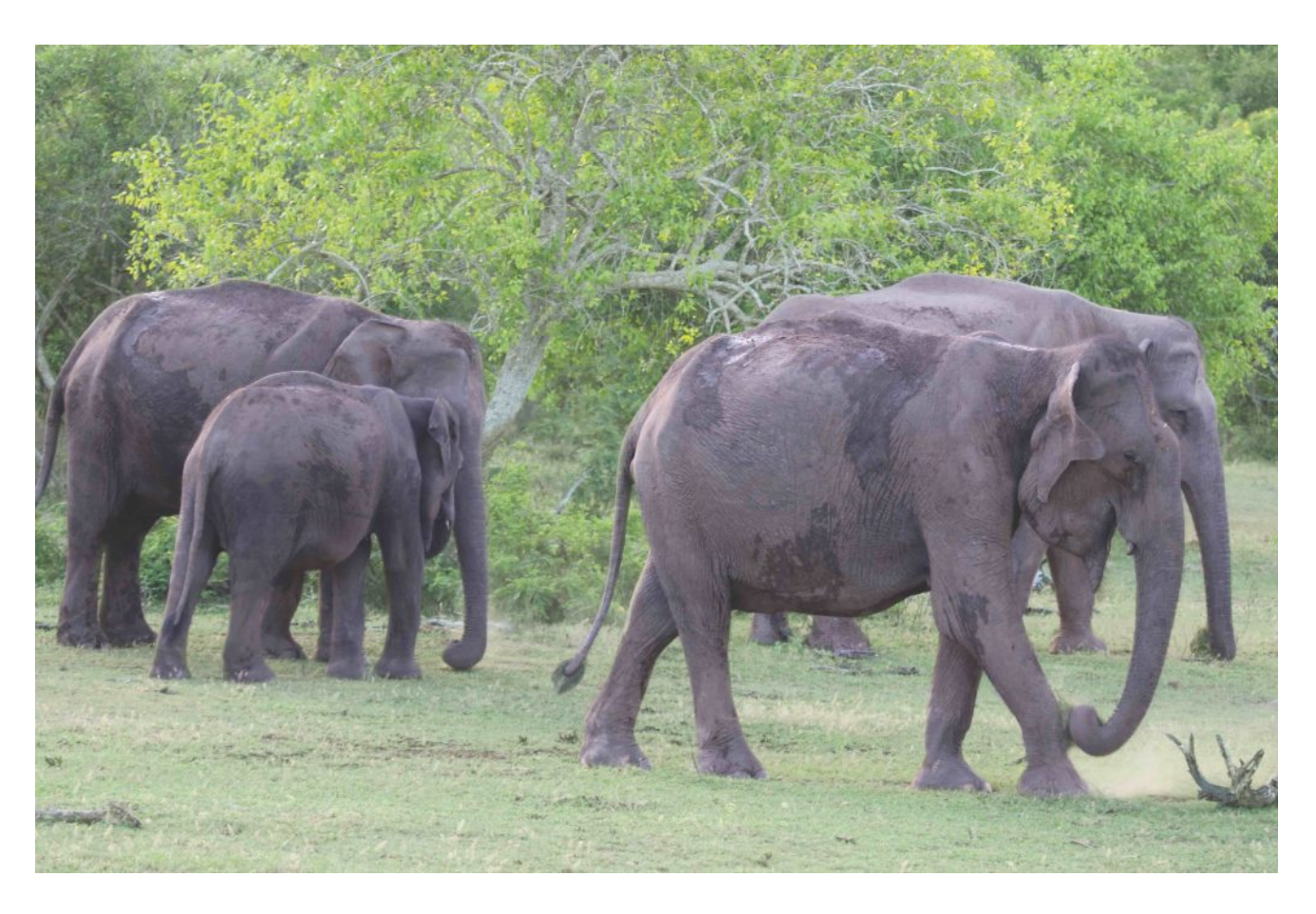
May 14, 2024.

Gentle giants enjoying the early evening cool vibes.