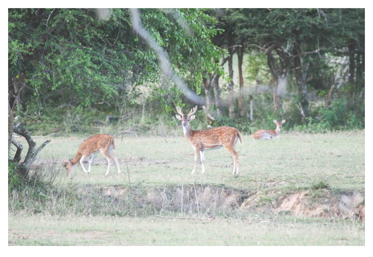
Spotted deer decorating the park with their presence.