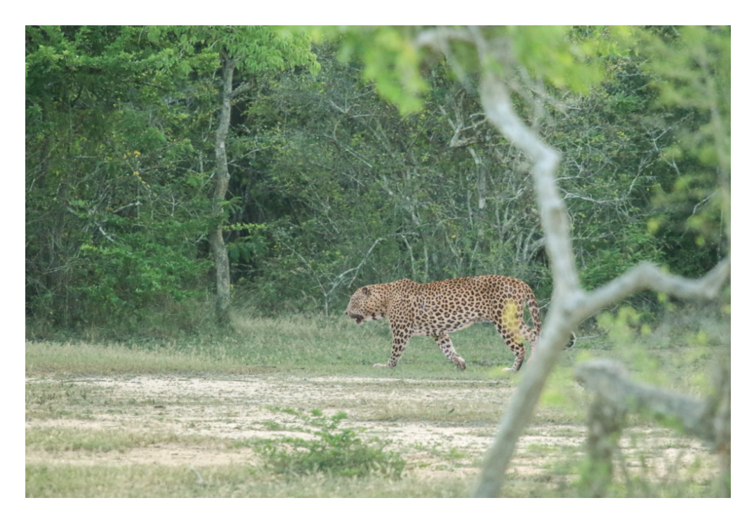
Wonderful sighting of the magisterial leopard.