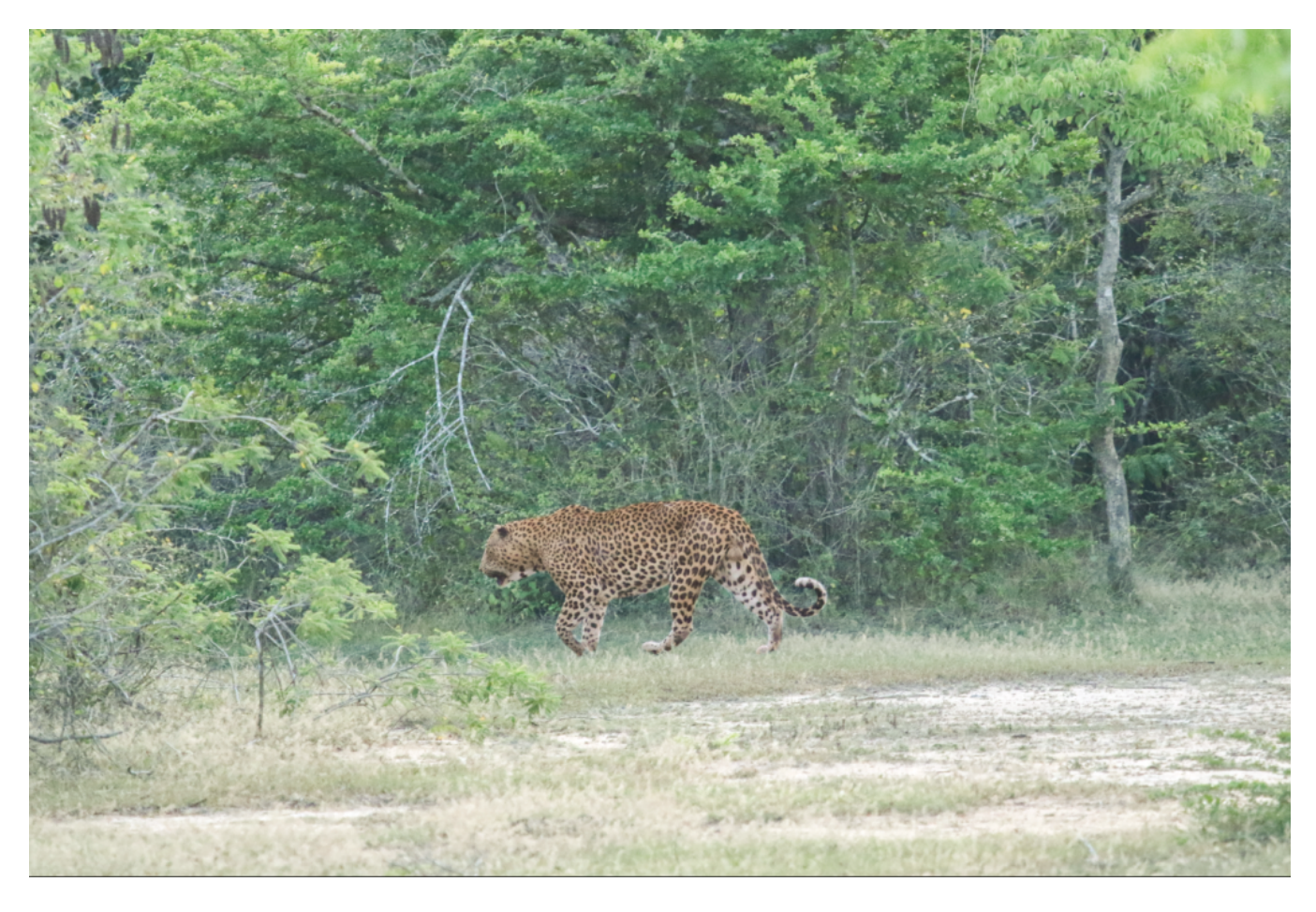
One of the majestic and marvelous creatures of nature.