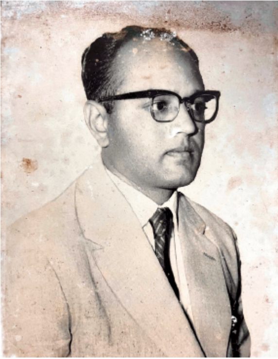
Taken in 1964: just before fate changes.