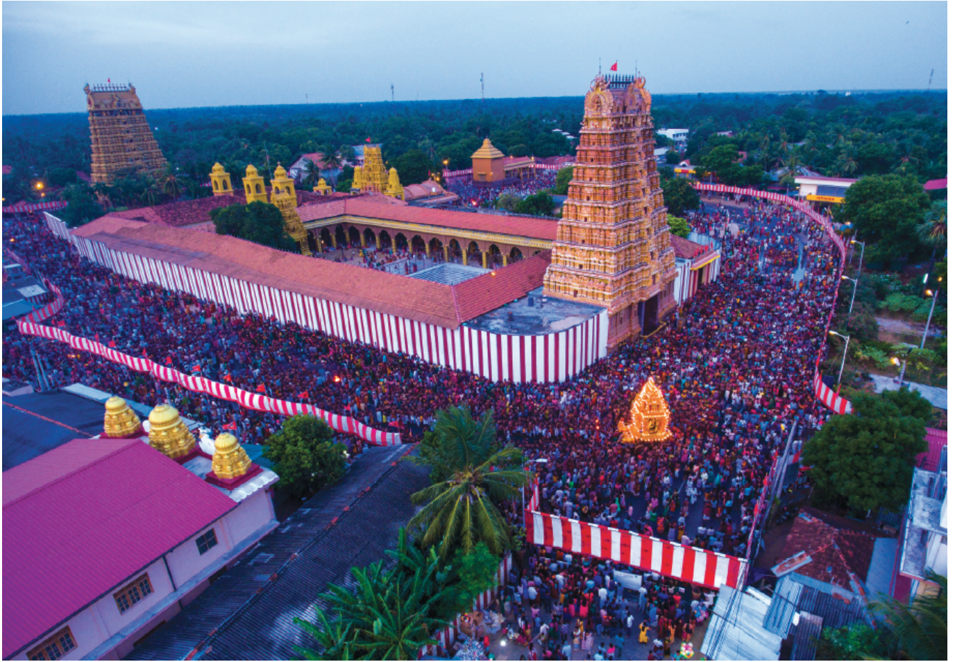
Aerial view of the temple and festival - showing the expansion of the temple done by Kumaradas Maapaana Mudaliyar during his tenure.