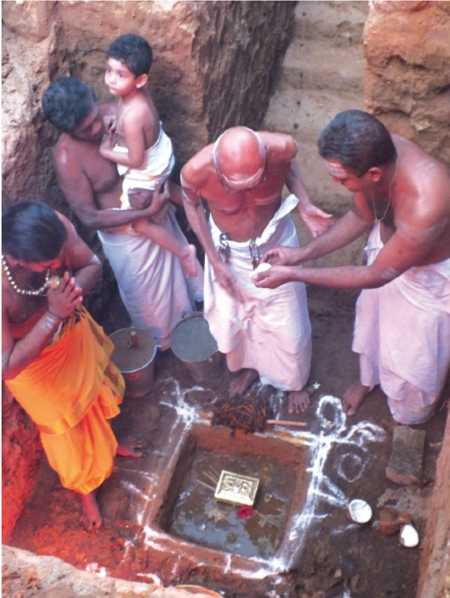
Laying of the Holy foundation for the Northern entrance Tower 'Kubera Raja Gopuram' in 2012. Along with son and grandson, which is recorded today as the island's biggest Gopuram (to date).