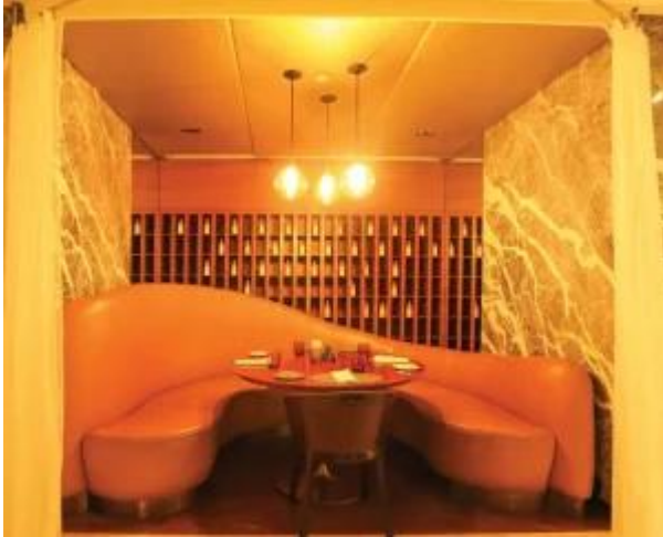
The private dining spaces.

At Graze Kitchen, the pod shaped show kitchens reflect various international cuisines.