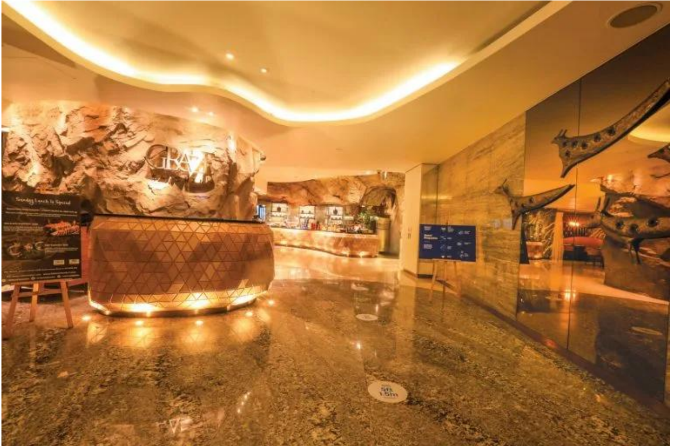
The exuberant entrance to the Graze Kitchen.

With warm natural earthen tones, the L.A.B and Graze Kitchen at the Hilton Colombo seamlessly blend to provide wonderful dining and socializing spaces serving delicious cuisine and delectable beverages.