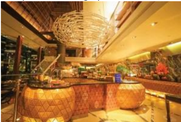
The dessert counter with the birds nest inspired chandelier.