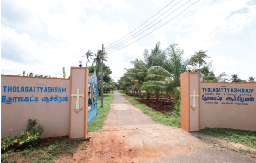
Entrance to the Rosarian Congregation's monastery now located at Achcuveli, Jaffna.