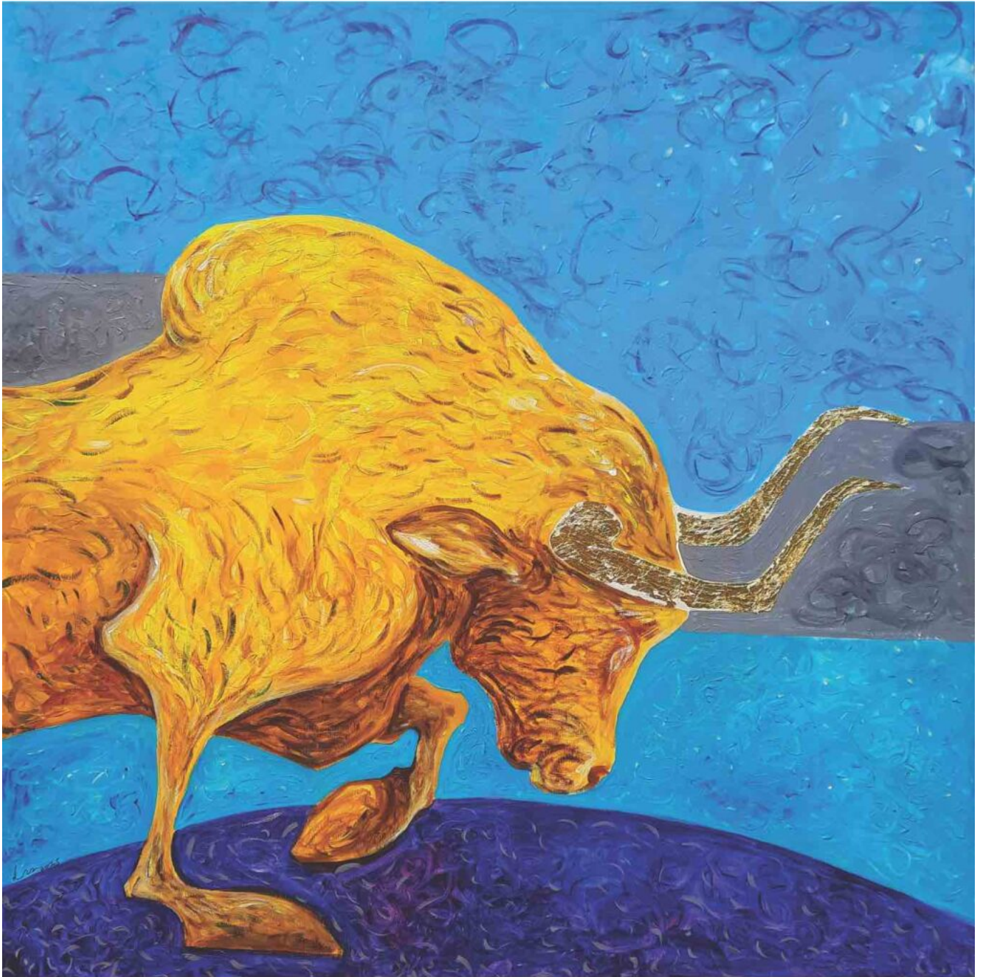
Royal Horn I.