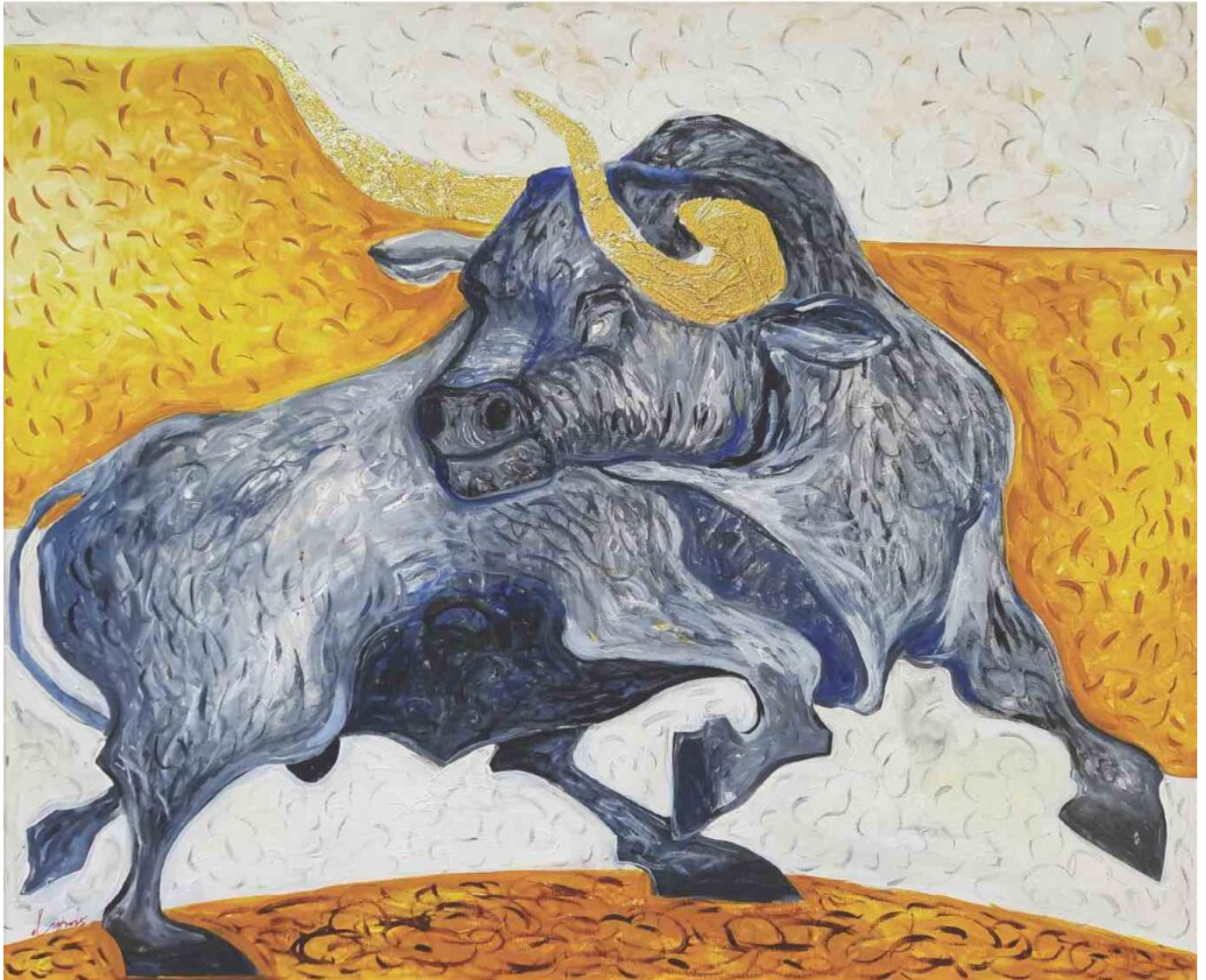
King of Cultivation I.