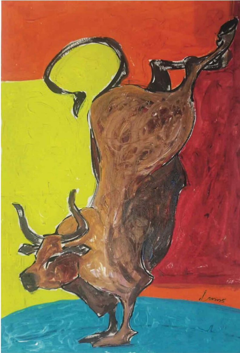
Playful Bull VI.