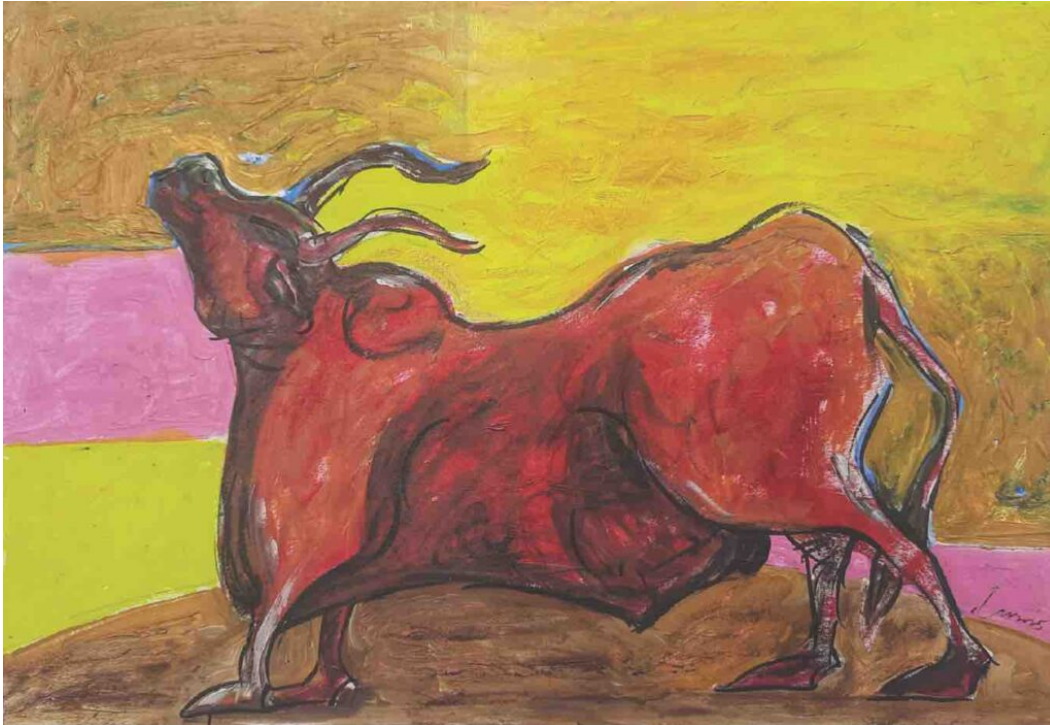
Playfull Bull III.