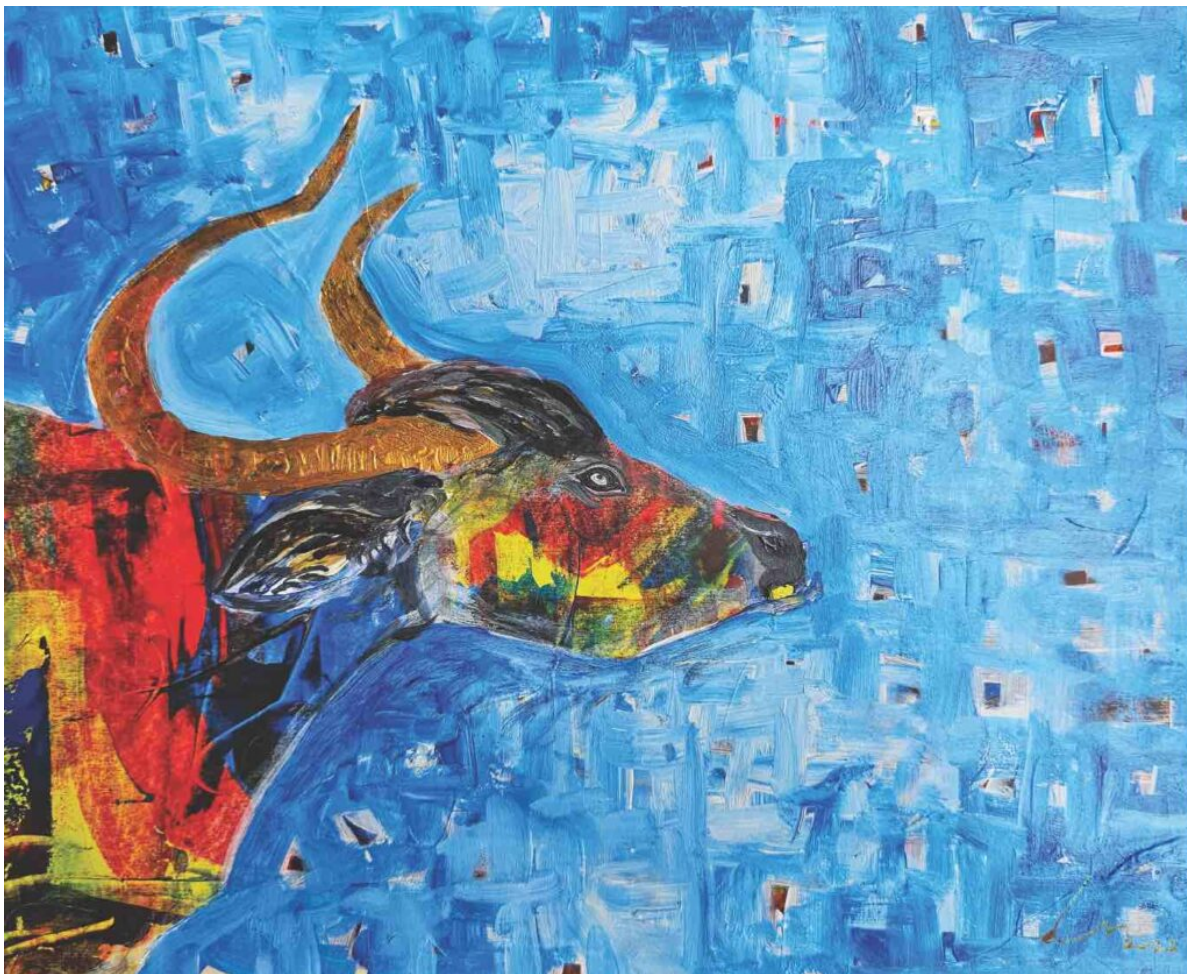
The Rainbow Bull.

The Bayleaf restaurant, in its 20 th year, continues to add special features that interest many guests and visitors. The Bayleaf Art Gallery was launched in December 2024 to promote local talent in art and creativity on the upper level. The Gallery has been featuring talented Sri Lankan artists each month.