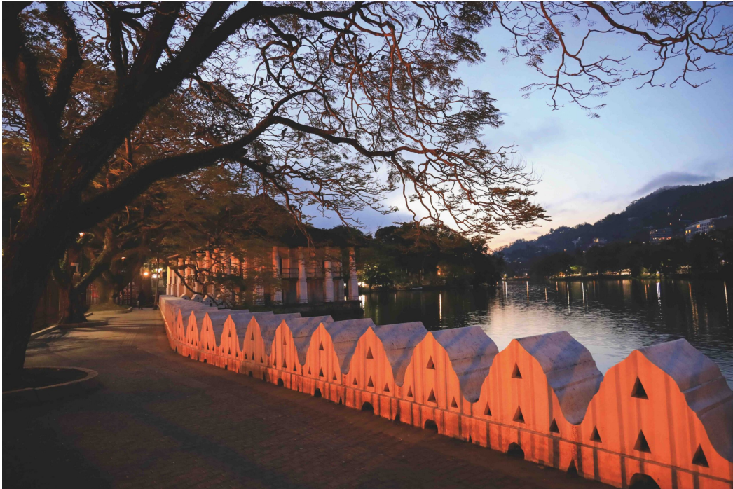
Dawn is unfolding gently over Kandy Lake.

There is something about Kandy that insists you slow down, even when the streets themselves seem determined to move at full speed. Perhaps it is the mist that rolls gently over the hills at dawn, or the way the waters of Kandy Lake hold the morning light like a polished mirror. Perhaps it is the echo of temple drums at dusk, carried softly above the impatient hum of buses, tuk tuks, and three-wheeled taxis weaving through traffic. Whatever it is, Kandy does not rush for anyone. It invites you to walk, even if you must first learn how to cross its spirited roads.