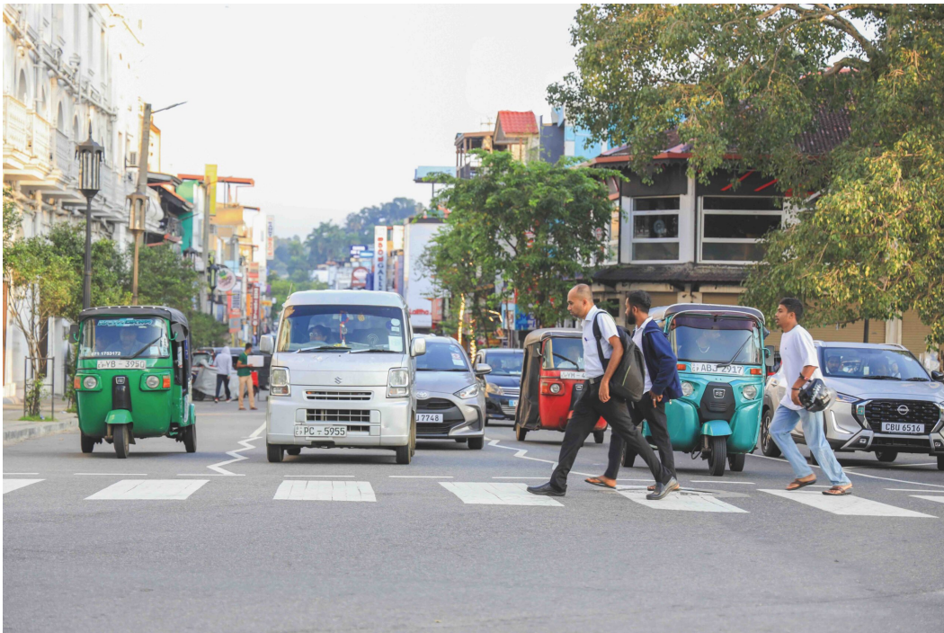
Between tuk-tuks and traffic, the city moves.

There is chaos, yes, but it is choreographed chaos. It feels like a dance learned over decades, perhaps centuries. Inside the Temple of the Sacred Tooth Relic, the world shifts again. Drums beat in rhythmic devotion. Conch shells sound. Devotees clutch lotus blossoms and frangipani garlands. The scent of jasmine thickens the air. Although the Sacred Tooth Relic remains encased within golden caskets, revealed only during ritual, the energy is unmistakable. Faith settles over you like a quiet shawl.