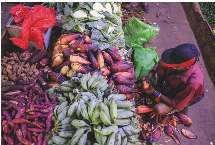
A burst of color and freshness at Kandy Market.

Kandy does not ask you to escape its busyness. It asks you to walk within it. To cross its roads. To pause at its stalls. To listen to its drums. To find stillness not despite the movement, but because of it.