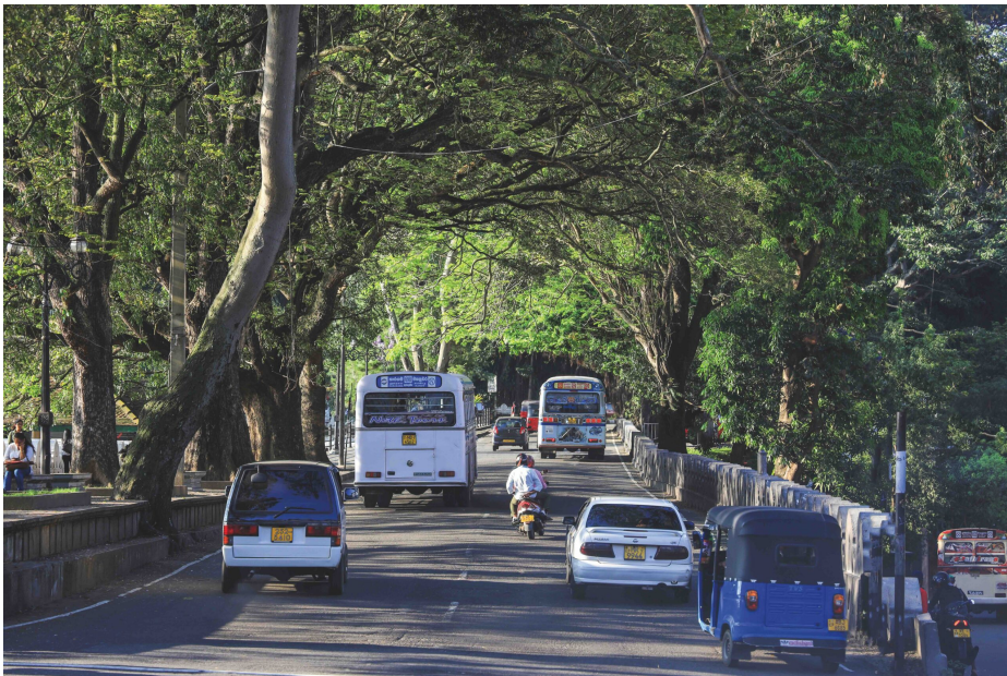
Where the journey feels as beautiful as the destination.

The forest feels like an exhale. Paths wind beneath towering trees. Sunlight filters through tangled vines. A troop of monkeys watches curiously from above. Somewhere deeper within, a monk meditates in stillness. The city continues its busy