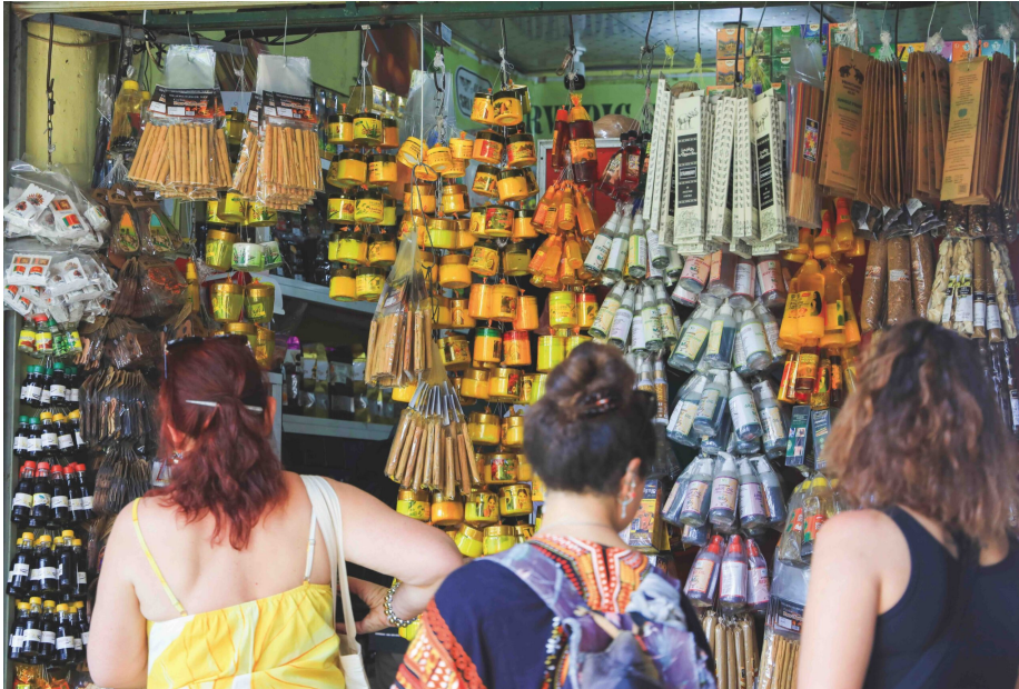
Bottled aromas and golden hues — a glimpse into Sri Lanka's spice culture.