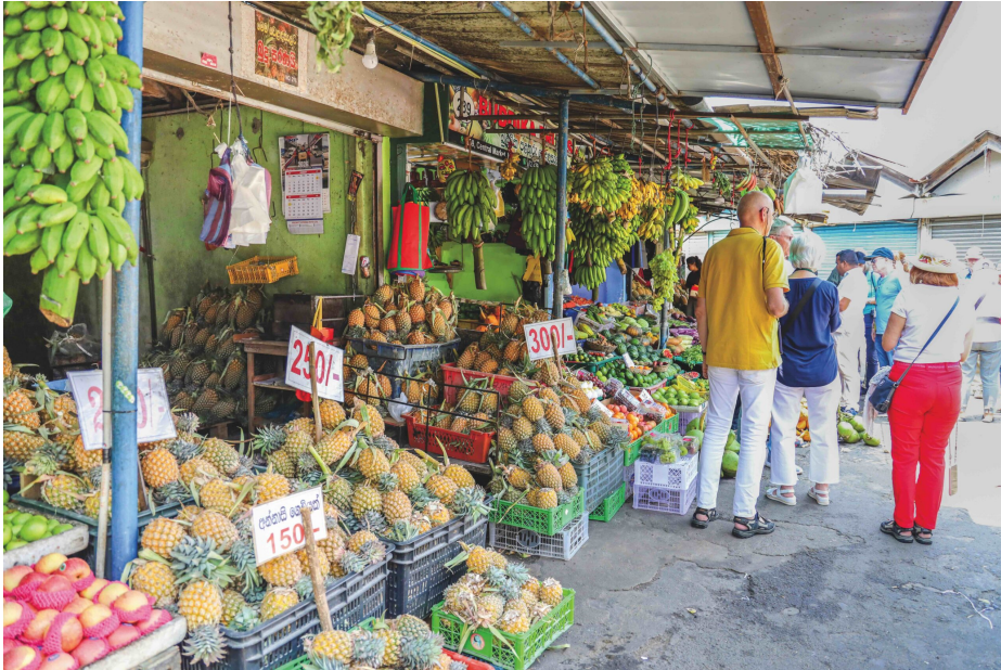
Sweet abundance at Kandy's bustling fruit market.

It means tasting spice in a crowded market and breathing forest air moments later. It means understanding that history and modern life share the same narrow pavements. By the time night fully settles, the streets hum at a lower frequency. A distant train horn echoes through the valley. A final bus sighs into its bay. Somewhere, a temple bell rings. Kandy does not ask you to escape its busyness. It asks you to walk within it. To cross its roads. To pause at its stalls. To listen to its drums. To find stillness not despite the movement, but because of it. And as I finally step away from the lake, I realize that the true rhythm of Kandy lies not only in its sacred spaces or misty hills, but in the vibrant, busy streets that keep its heart beating.