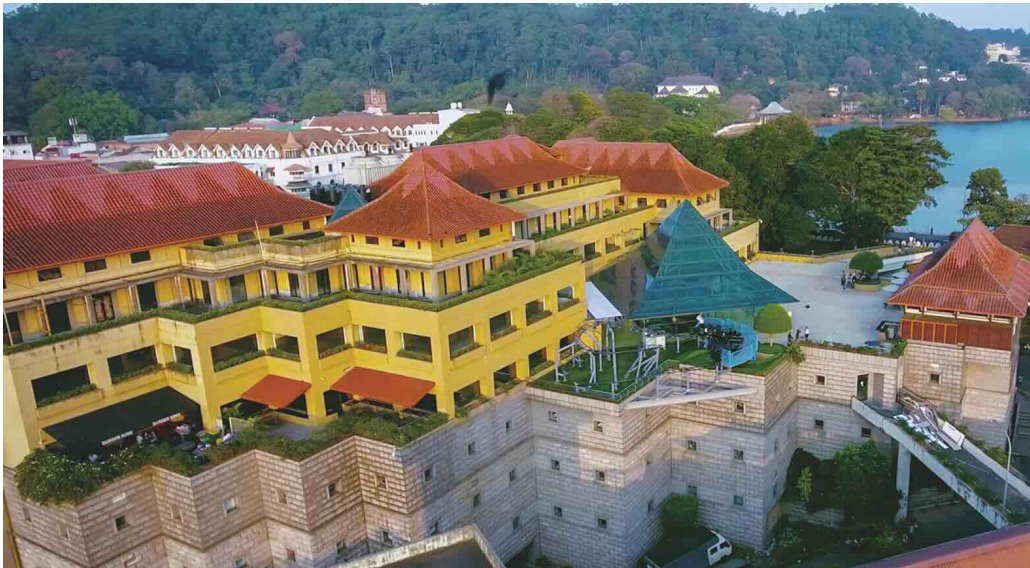
Kandy City Centre — A vibrant landmark in the heart of Kandy.

negotiations beyond the tree line, but here time stretches and softens. Returning downhill in the late afternoon, I reenter the bustle with renewed appreciation. Kandy's busy streets are not merely traffic corridors. They are living arteries. They carry schoolchildren, pilgrims, merchants, tourists, and office workers. They carry stories. I take a tuk tuk partway up to the Hanthana hills, where tea plantations ripple across the slopes. From above, the city appears gentler. The lake gleams like polished glass. The Temple of the Sacred Tooth Relic stands luminous and white.