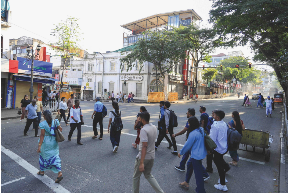
Streets that carry a thousand daily stories.