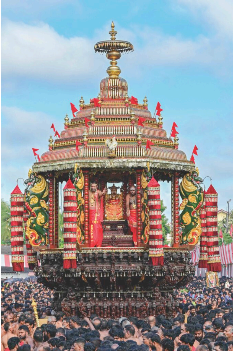
Lord Murugan, the six-faced, twelve-armed warrior, symbolizes strength and is celebrated during the Ther Thiruvila, or Chariot Festival.