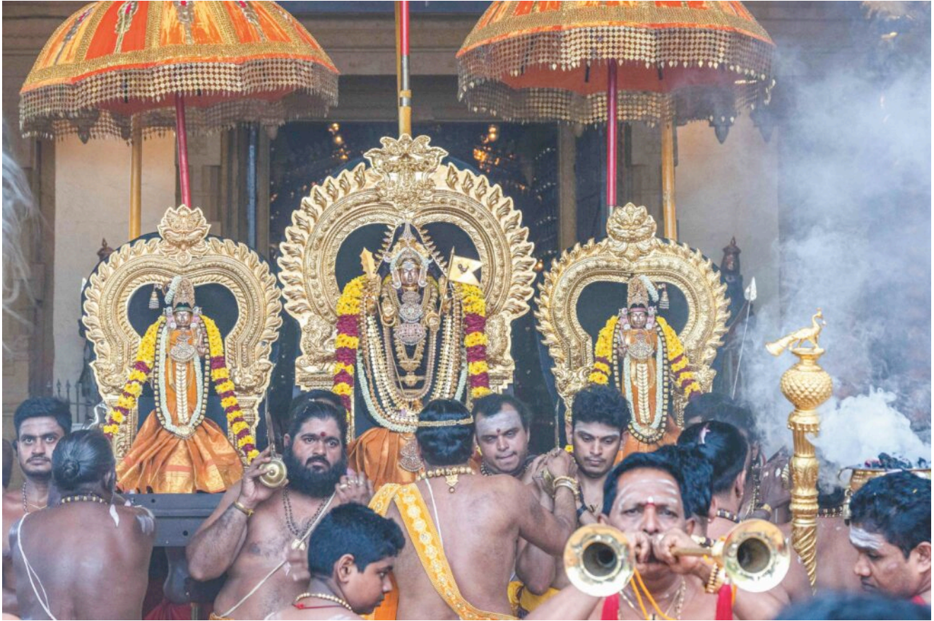
During the Manjam festival, Lord Murugan and his consorts are carried in a solemn procession.