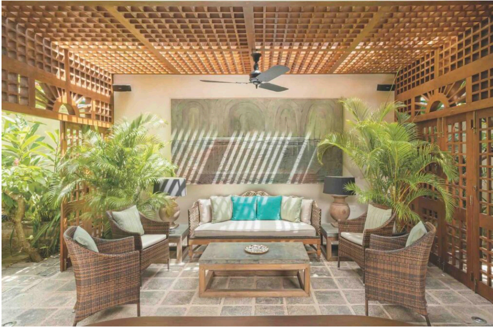
A radiant inner courtyard, illuminated by the warm embrace of natural light.