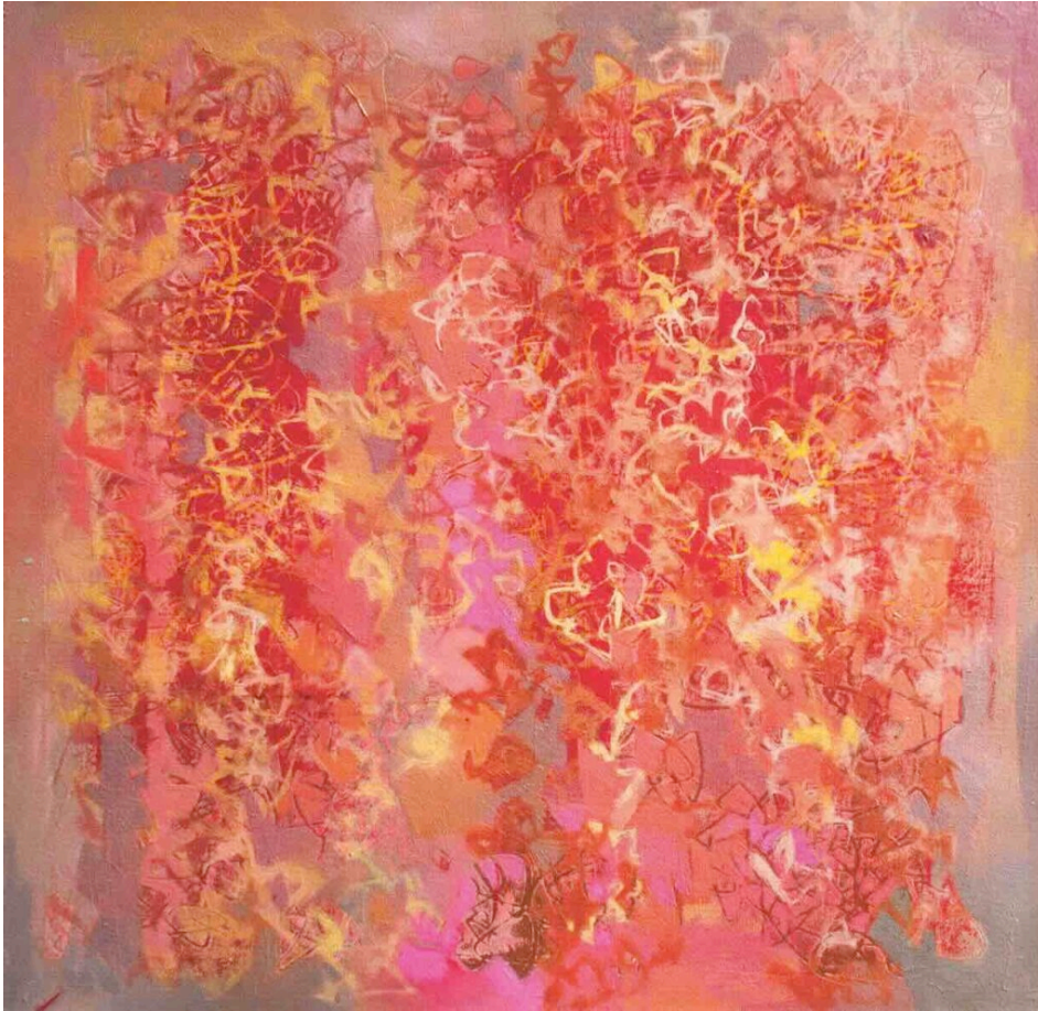
Freedom Search XVIII.