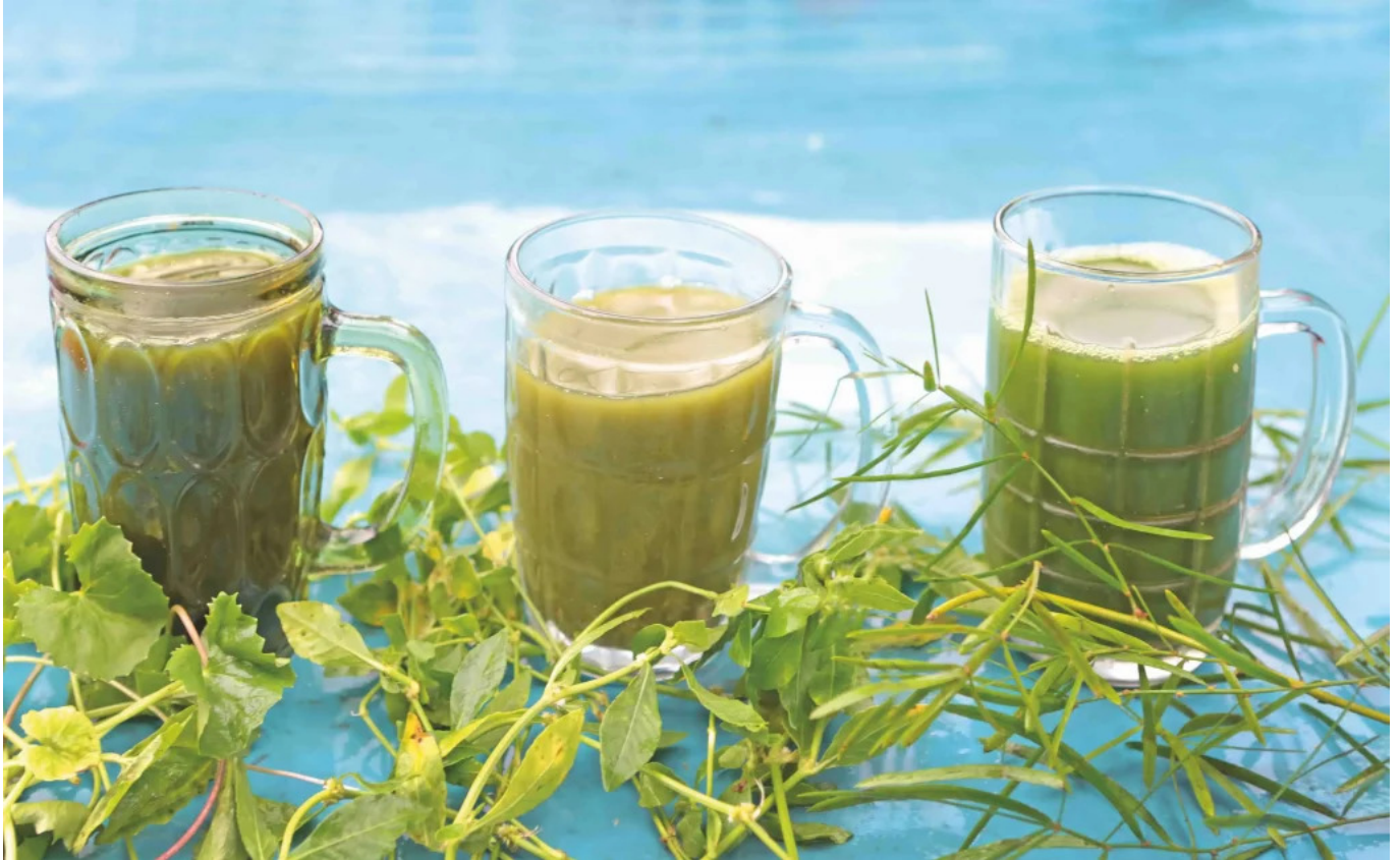
Gotu Kola, Mukunuwenna and Hathawariya kenda.

Most Sri Lankans gulp down a morning mug of Kenda, a veritable magic potion that gives the drinker strength to face the day.