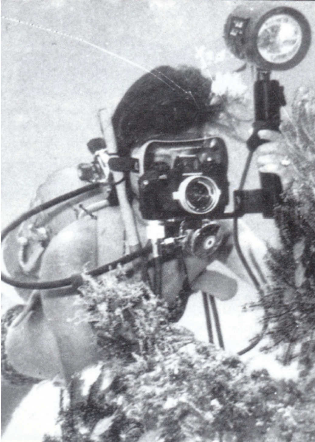
The world 40 feet under the warm tropical sea, just a few miles away from the Hikkaduwa