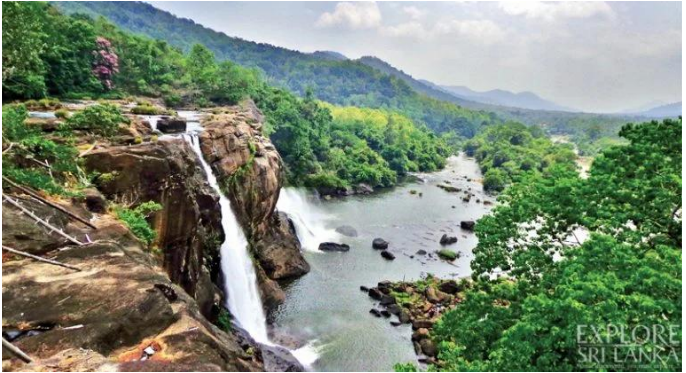
Rare flowers, steam trains and quirky hill stations are all on offer in the Western Ghats