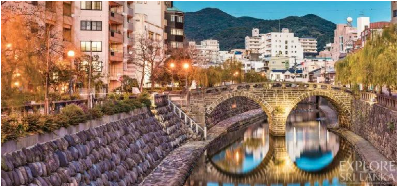
Nagasaki's identity transcends one violent act