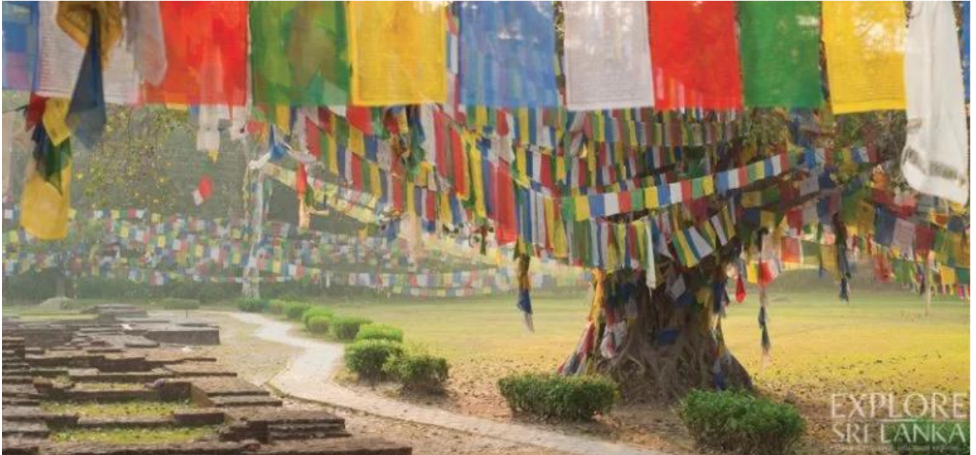
Change is apace in sleepy Lumbini