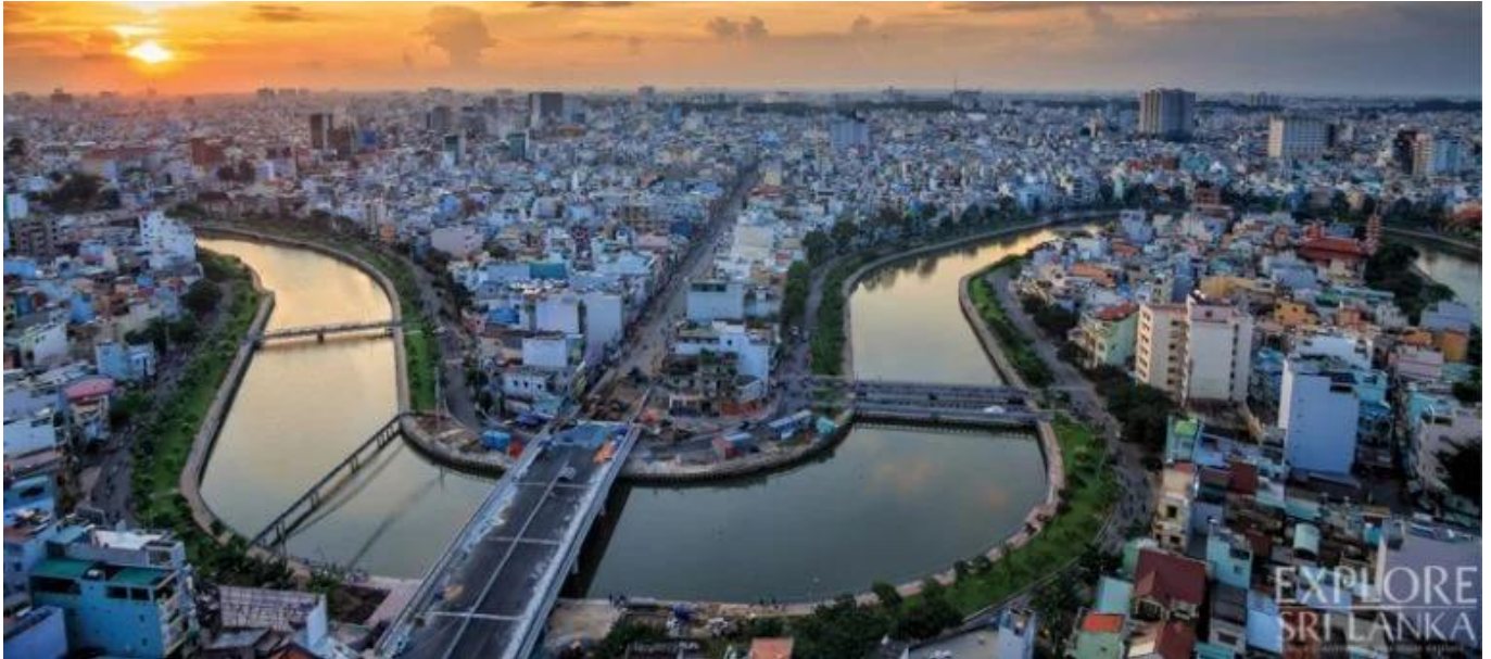
This slick supercity is in no danger of going out of style