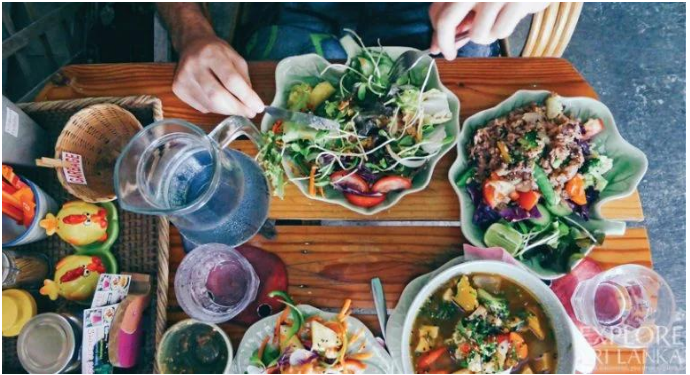
A new energy has enveloped ancient Chiang Mai, evident in its innovative culinary scene