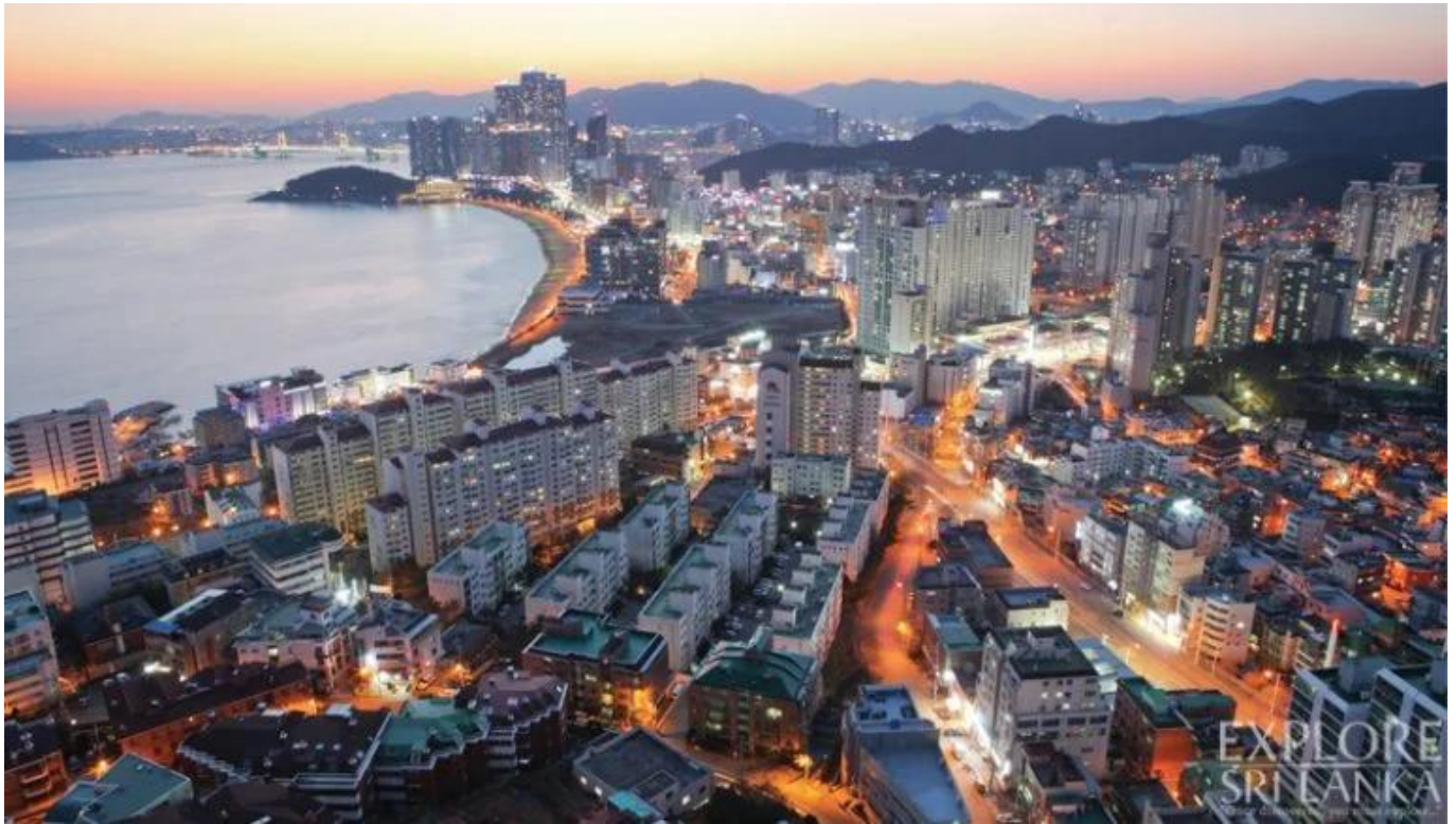
It's the perfect time to visit South Korea's second city