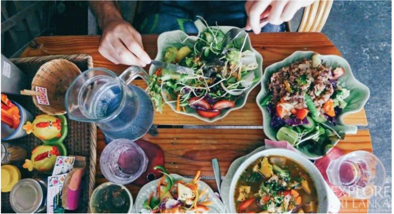
A new energy has enveloped ancient Chiang Mai, evident in its innovative culinary scene