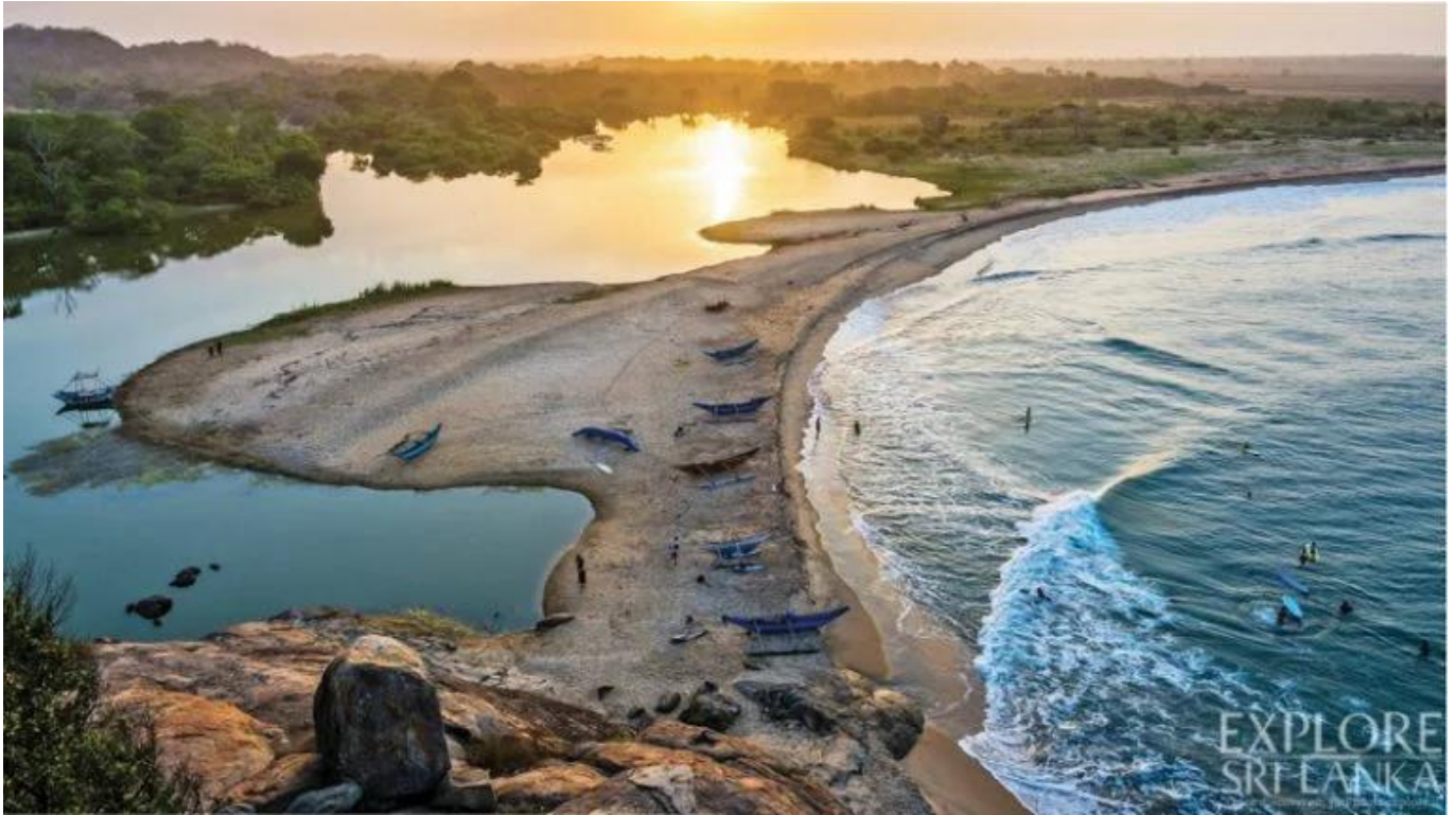
Arugam Bay boasts a laid-back vibe and surf breaks for all levels