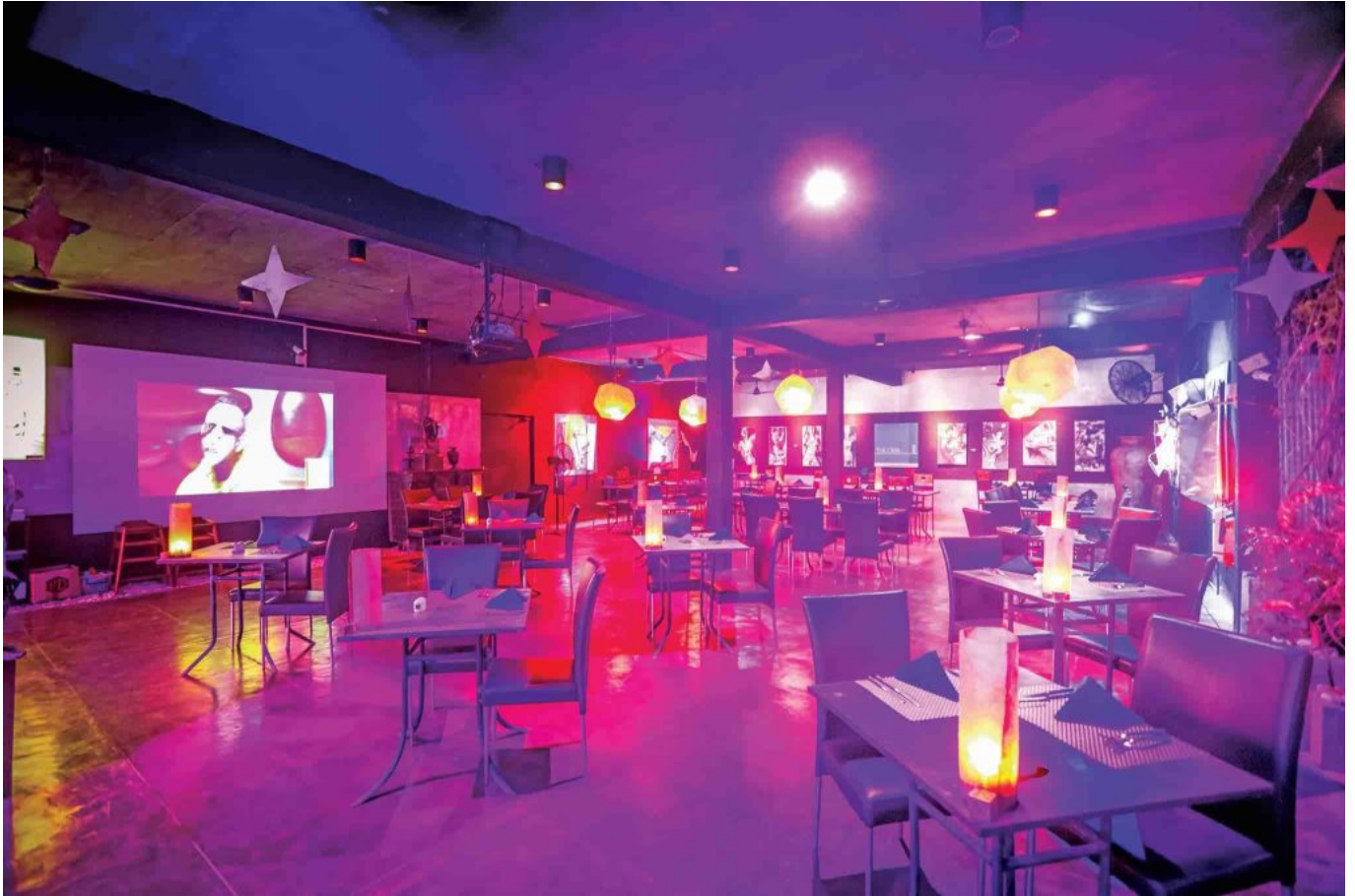
Stylish Oval restaurant is suitable for families and large groups.