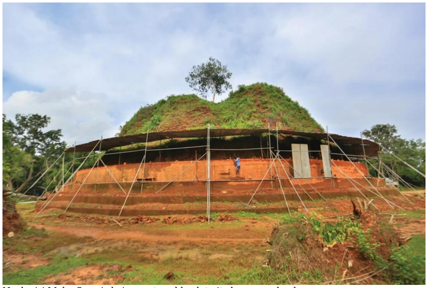
Neelagiri Maha Seya is being restored back to its bygone splendor.