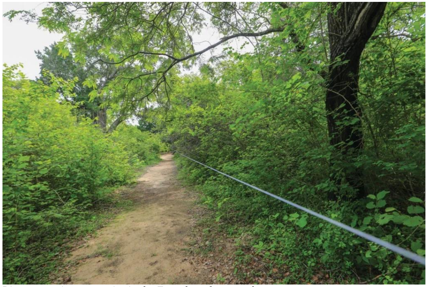
Discover ancient mysteries in the East along forest paths.