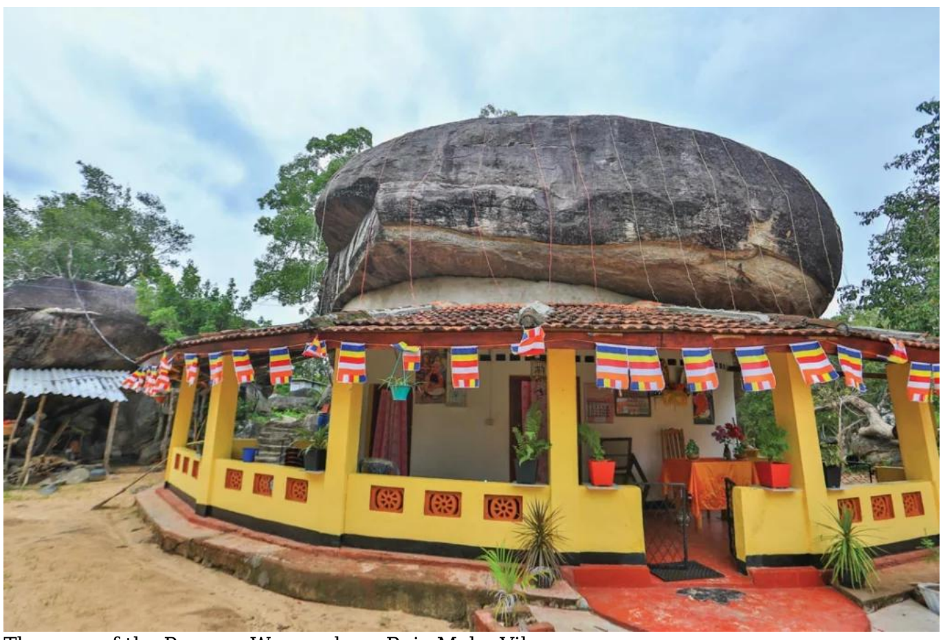
The cave of the Panama Wawevehera Raja Maha Viharaya.