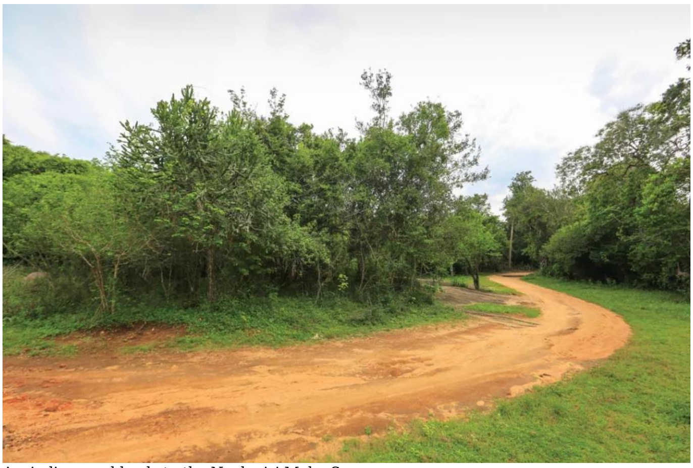
A winding road leads to the Neelagiri Maha Seya.