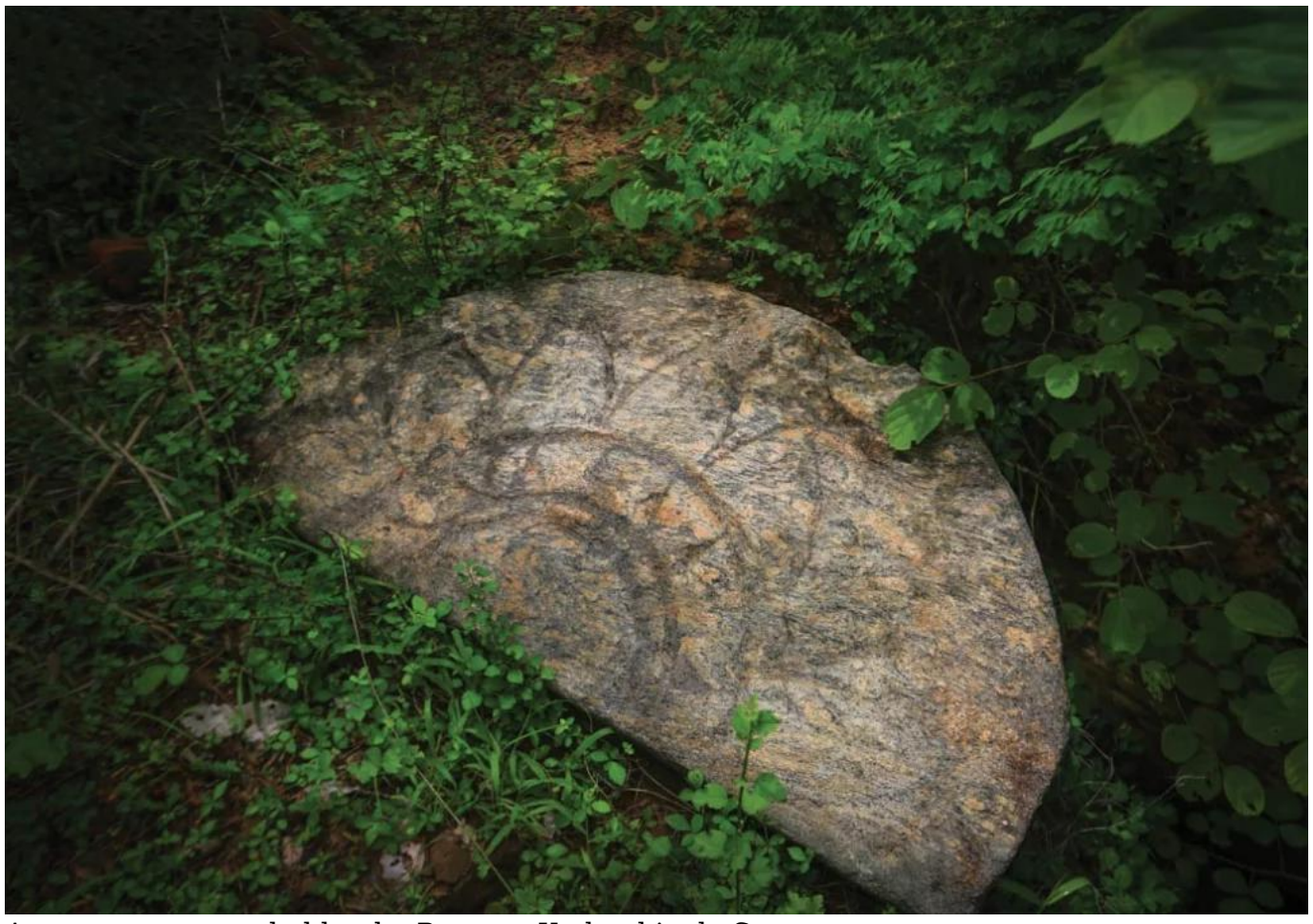
A moonstone guarded by the Panama-Kudumbigala Sanctuary.